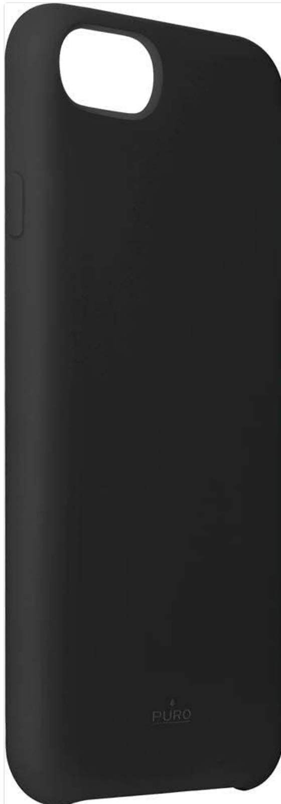
Figure 2: Side view of the case, illustrating the precise button covers and cutouts for easy access.