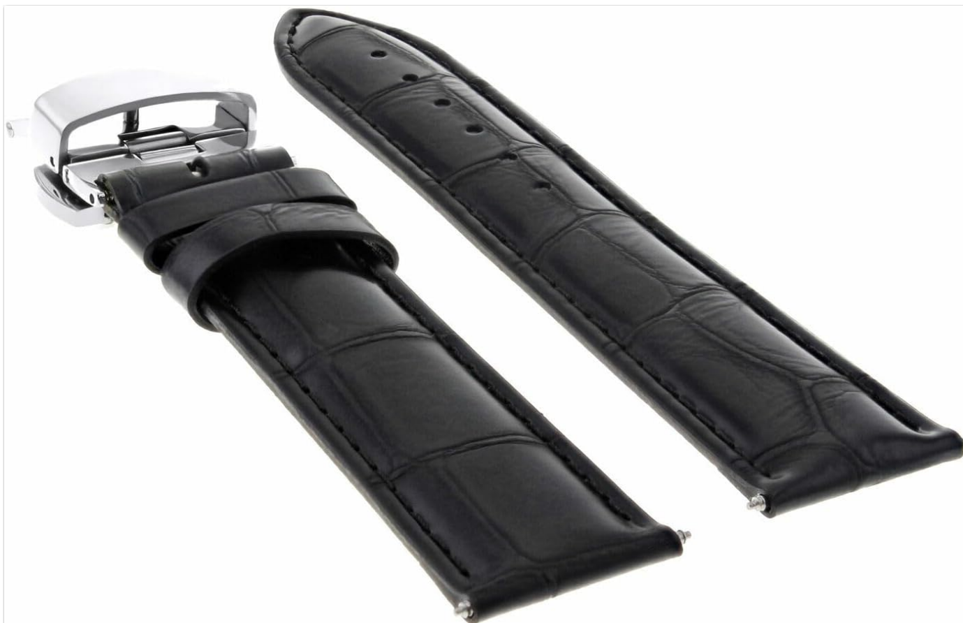
Figure 4.1: The Ewatchparts 22mm leather watch band strap with the butterfly deployment clasp fully assembled and ready for attachment to a watch. This view shows the top side of the strap and the integrated clasp.