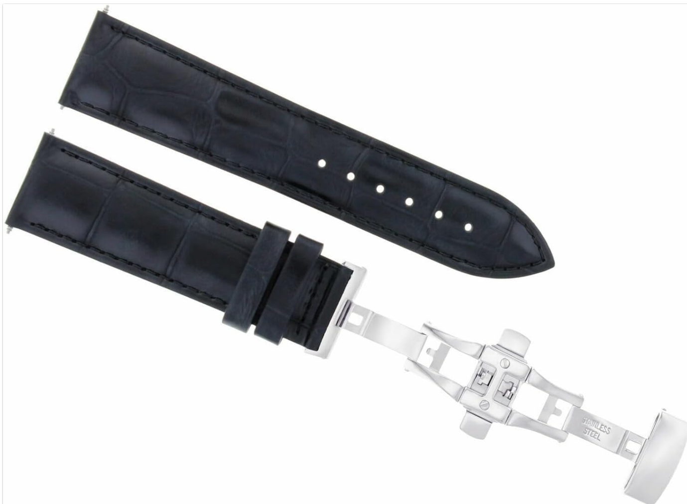
Figure 3.1: The Ewatchparts 22mm leather watch band strap shown with its separate butterfly deployment clasp. This image displays the two strap pieces and the stainless steel clasp mechanism, illustrating the components included in the package.