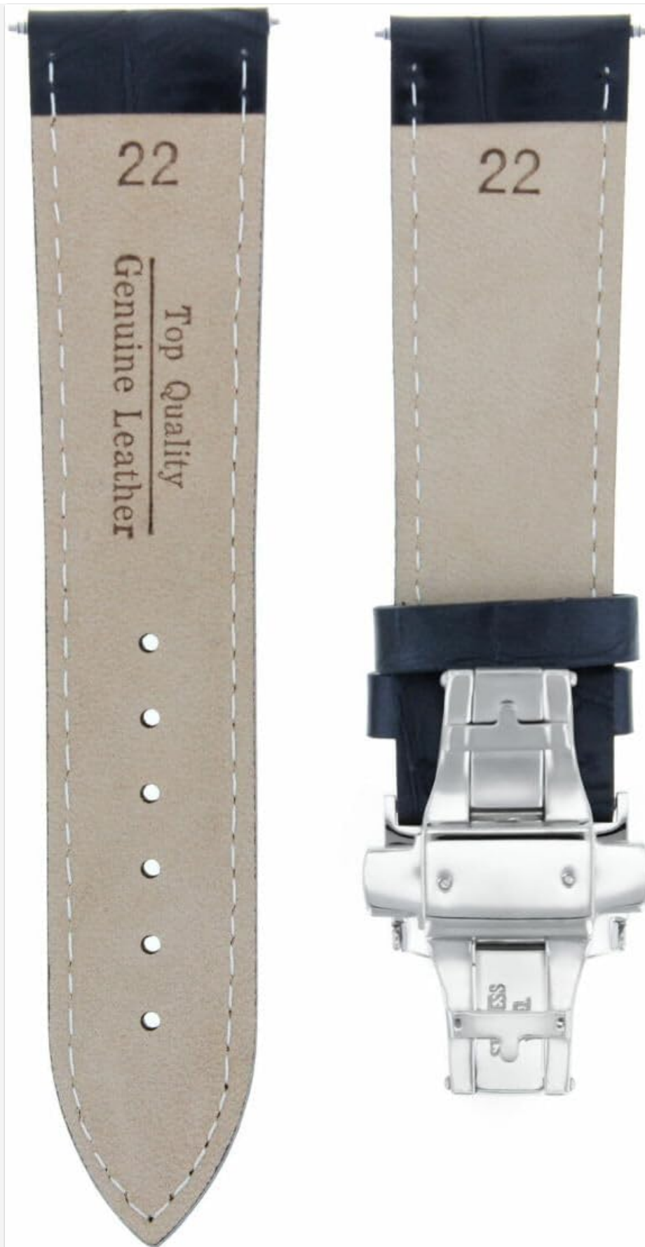
Figure 4.2: The underside of the Ewatchparts 22mm leather watch band strap, displaying the 'Top Quality Genuine Leather' marking and the '22' size indicator near the lug ends. This view is helpful for confirming strap details during installation.