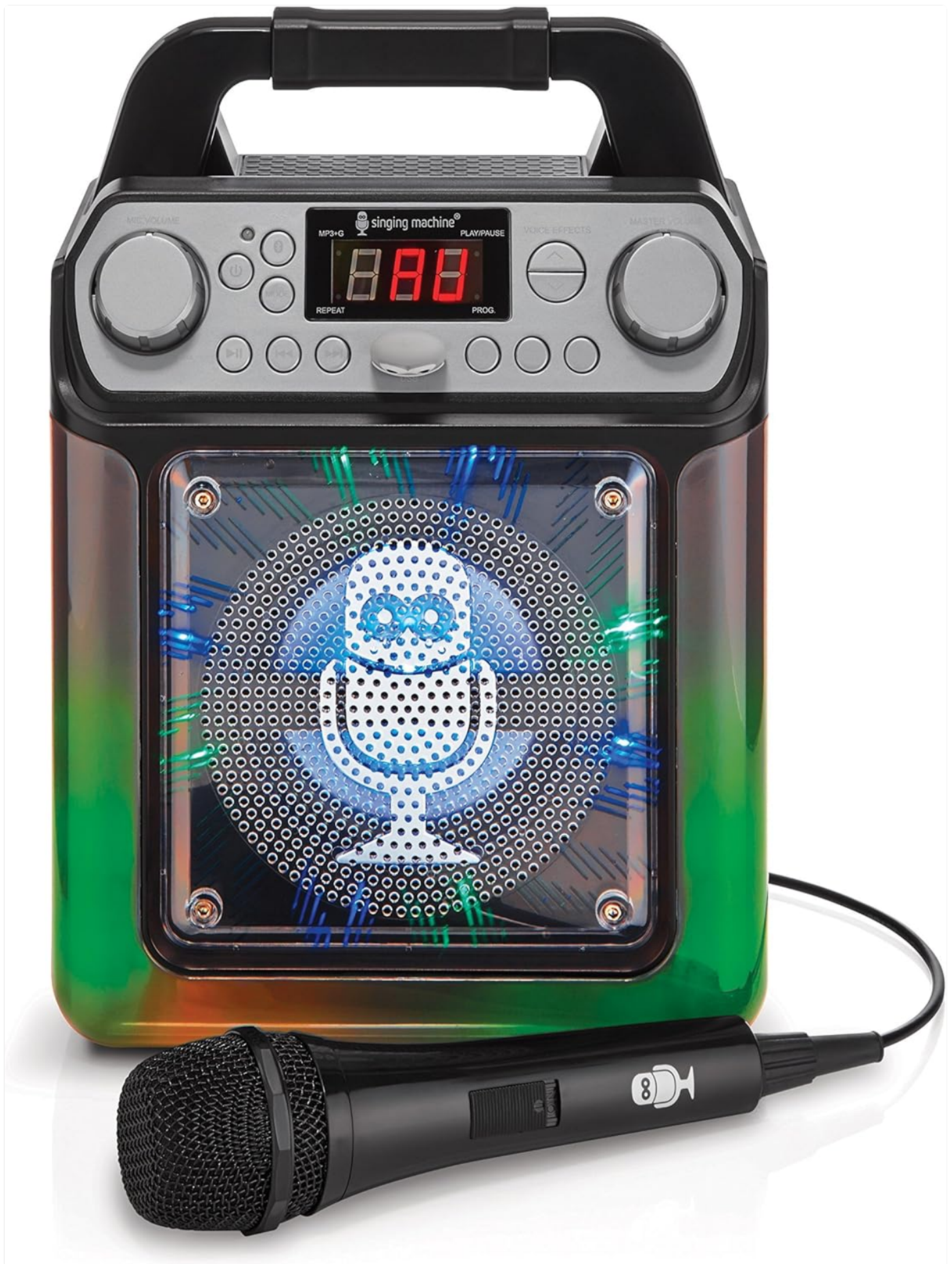
Figure 6: LED Lights (Blue/Green, Angled). An angled view of the karaoke machine with blue and green LED lights active, providing a different perspective of the light effects.