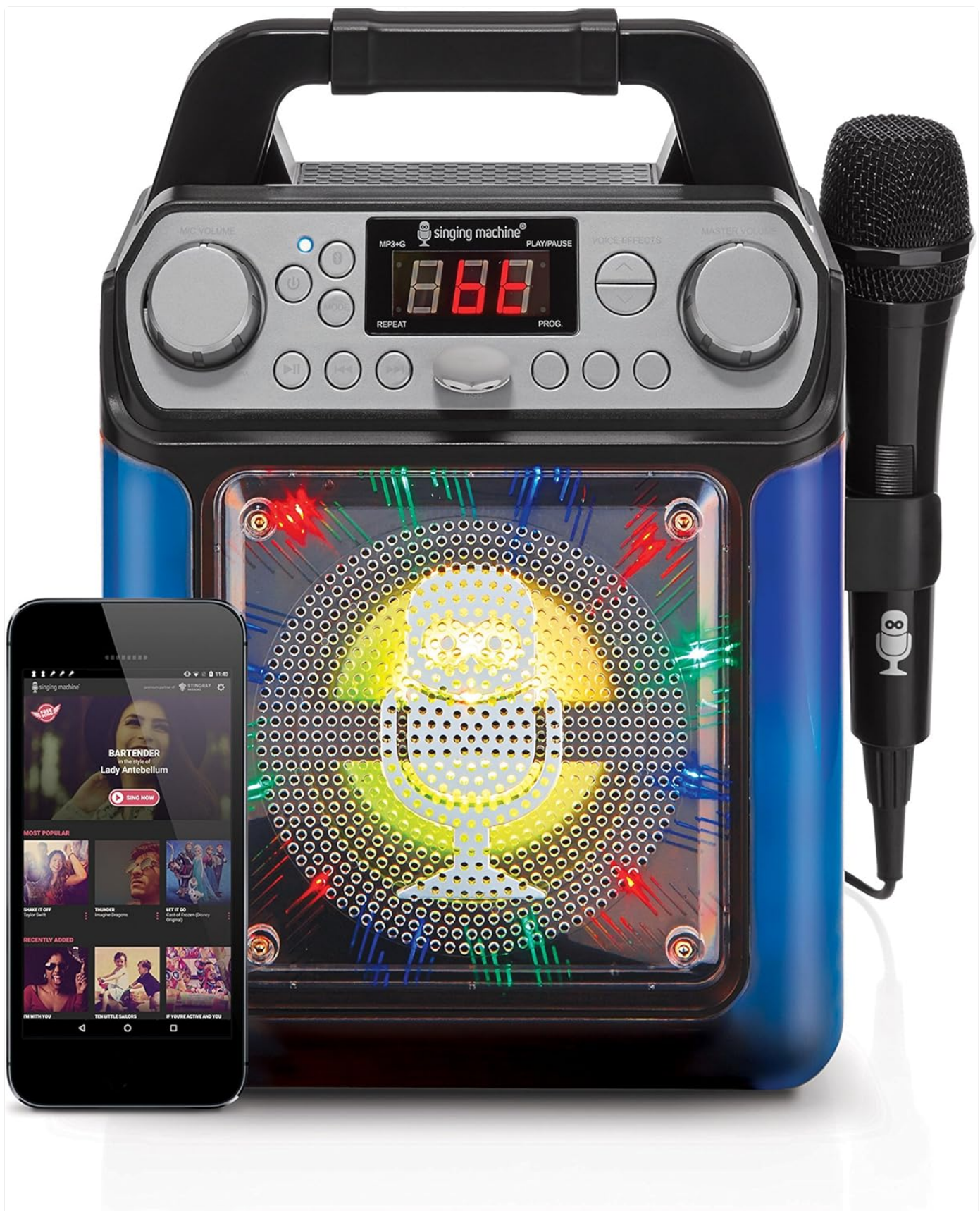
Figure 1: Front Panel and Controls. This image shows the front of the karaoke machine, highlighting the main display, control buttons, volume knobs, and the integrated LED light show. A smartphone is depicted next to the unit, illustrating Bluetooth connectivity.