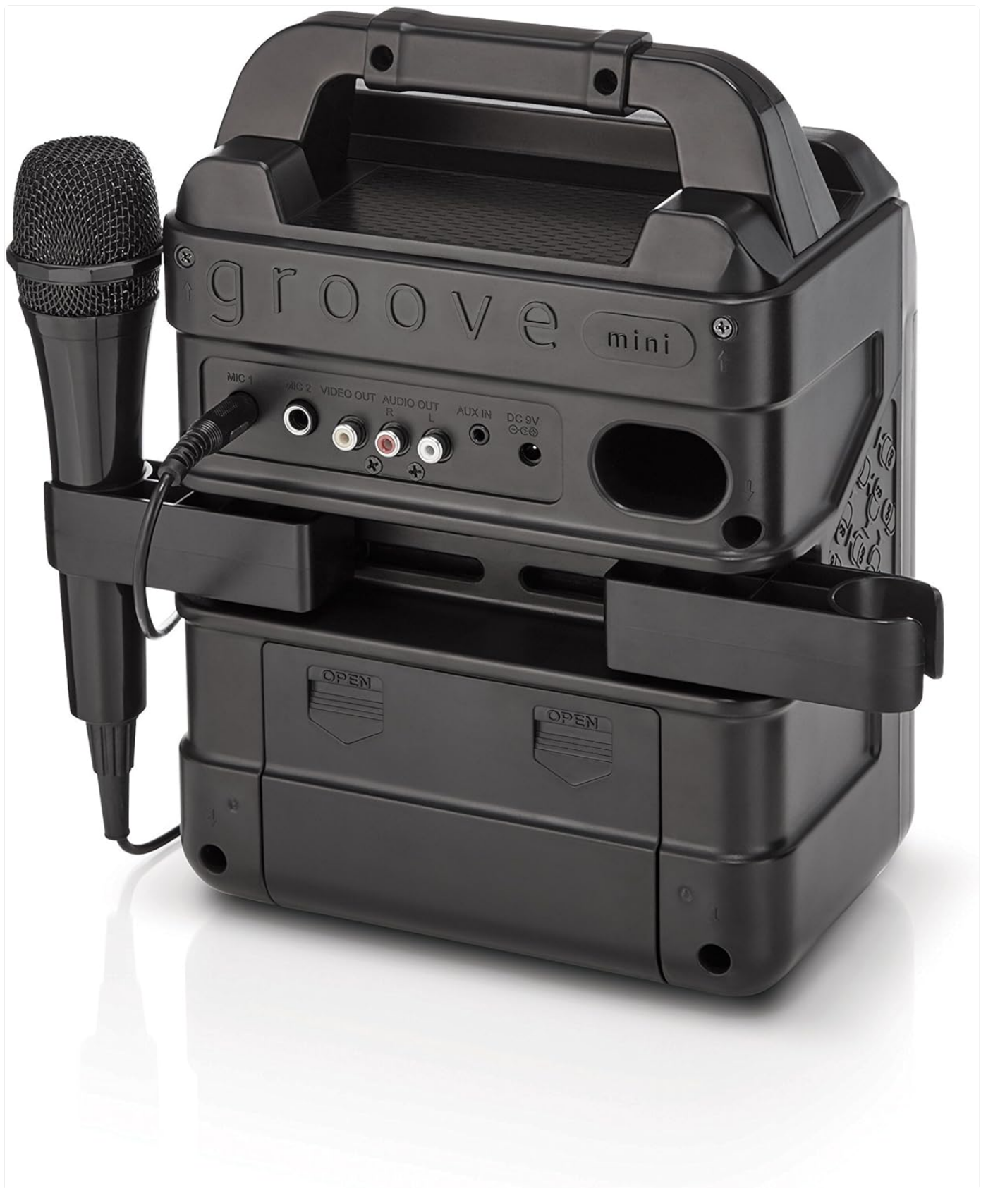
Figure 2: Rear Panel Connections. This image displays the back of the karaoke machine, detailing the various input and output ports, including microphone inputs, video out, audio out, AUX in, and the DC power input. The battery compartment is also visible.