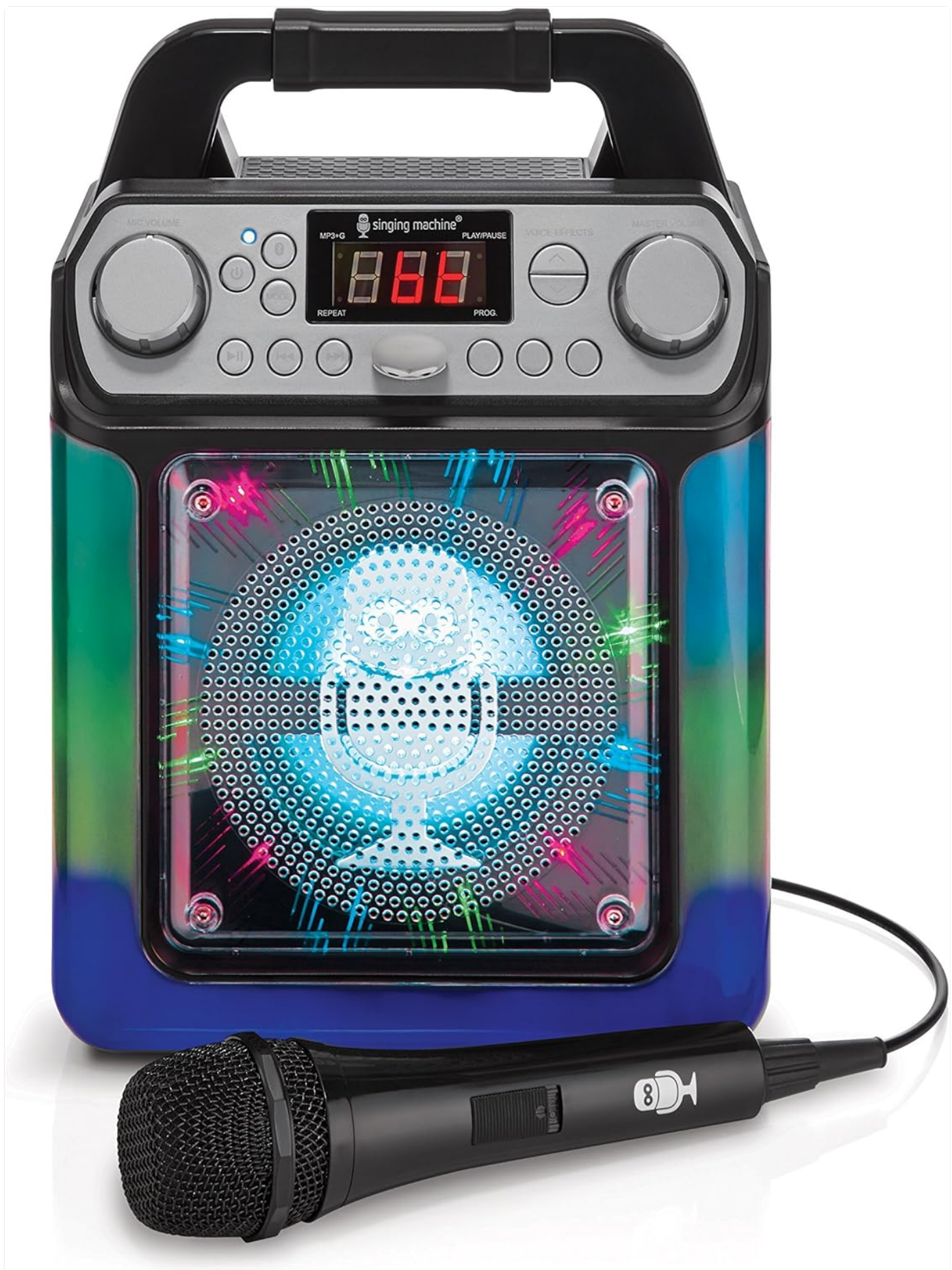
Figure 4: LED Lights (Blue/Green). This image shows the karaoke machine with its front speaker grille illuminated by blue and green LED lights, demonstrating one of the light show patterns.