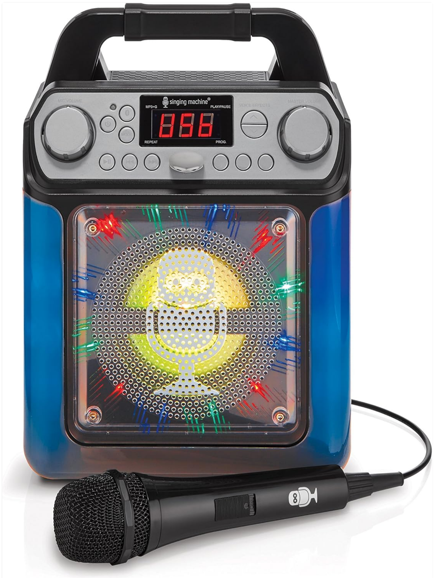
Figure 5: LED Lights (Blue/Yellow). This image shows the karaoke machine with its front speaker grille illuminated by blue and yellow LED lights, demonstrating another light show pattern.