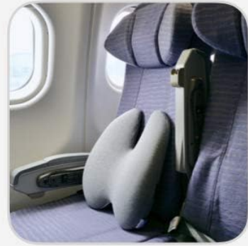
On the plane