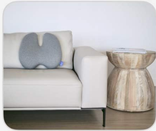
On the sofa