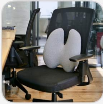
At the office