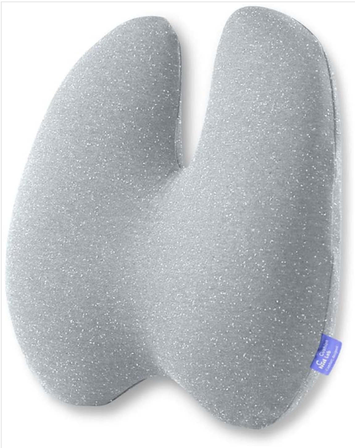
Figure 1: The C CUSHION LAB Extra Dense Lumbar Pillow in Grey. This image displays the overall shape and texture of the pillow, highlighting its ergonomic design.