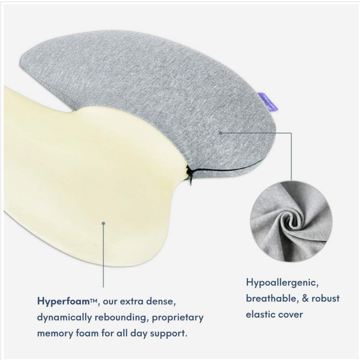
Figure 5: This image shows the Hyperfoam™ core and the hypoallergenic, breathable, and robust elastic cover, highlighting its removable nature for maintenance.