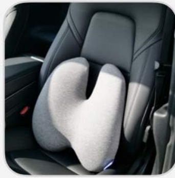
In the car