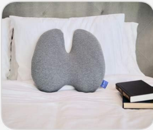
On the bed