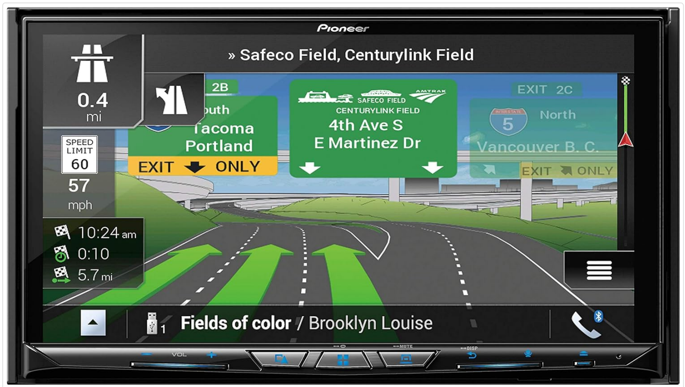
Image: The Pioneer AVIC-W8400NEX screen showing a detailed navigation map with current location, route, speed limit, and estimated arrival time.