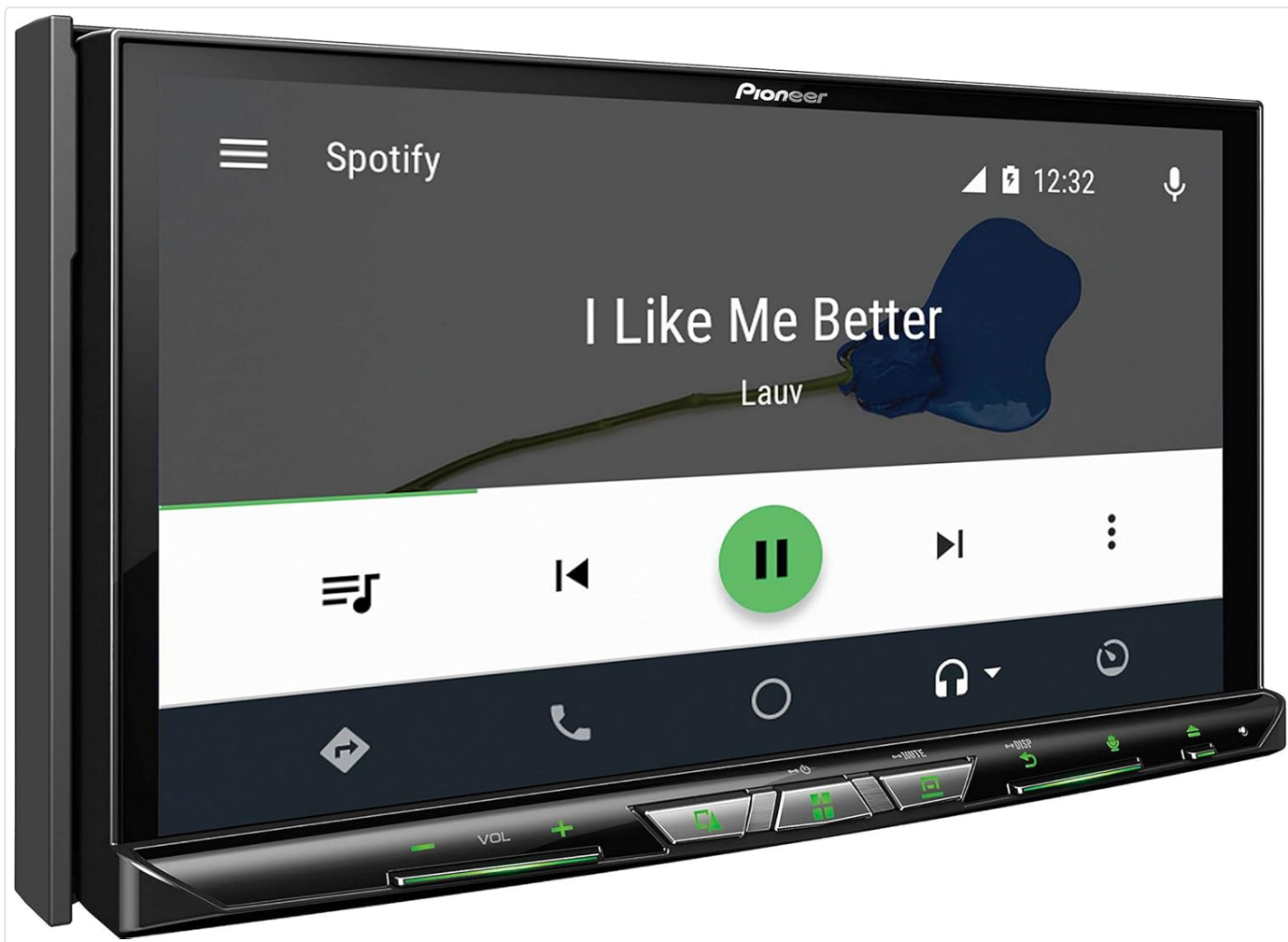
Image: The Pioneer AVIC-W8400NEX screen displaying the Spotify music application within Android Auto, showing current song information and playback controls.