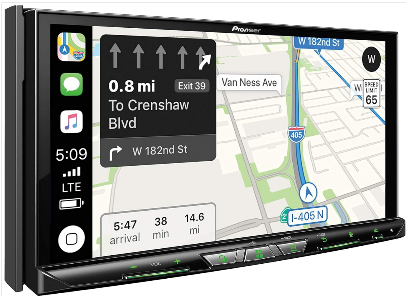
Image: The Pioneer AVIC-W8400NEX screen displaying Apple Maps navigation, showing turn-by-turn directions, estimated arrival time, and distance to destination.