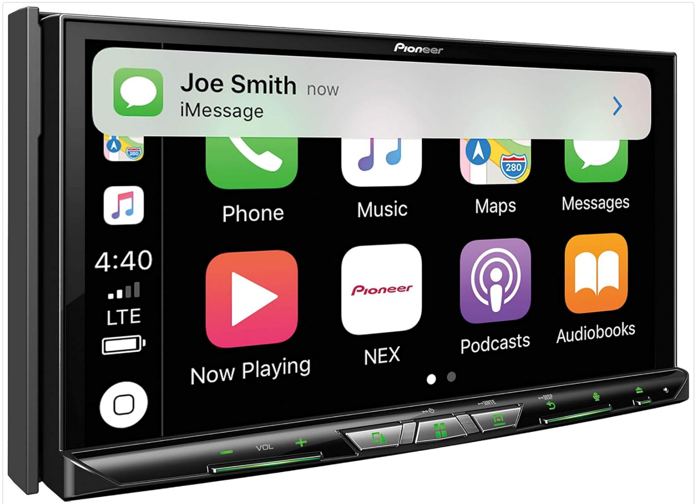
Image: The Pioneer AVIC-W8400NEX screen displaying an incoming iMessage notification from "Joe Smith" within the Apple CarPlay interface.