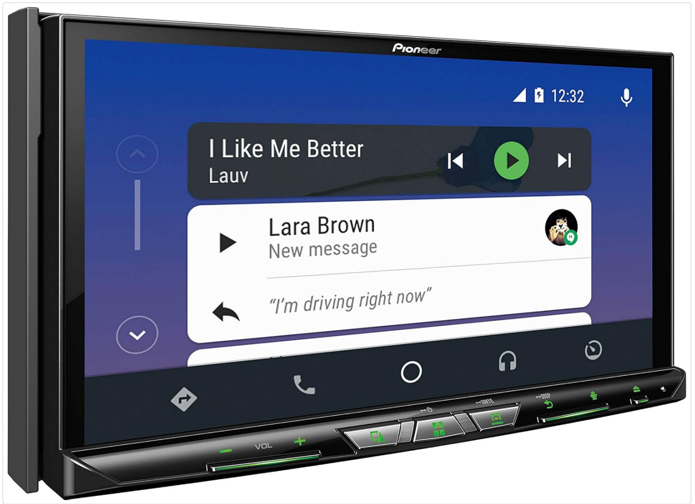
Image: The Pioneer AVIC-W8400NEX screen showing the Android Auto interface, displaying current music playback and a new message notification from "Lara Brown".

Maps, music, messages, and voice commands through Google Assistant directly from the receiver's display.