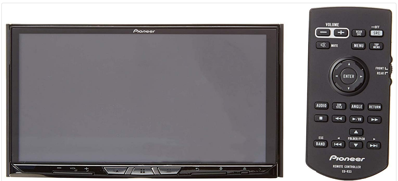
Image: The Pioneer AVIC-W8400NEX head unit alongside its wireless remote control, illustrating the primary user interfaces.