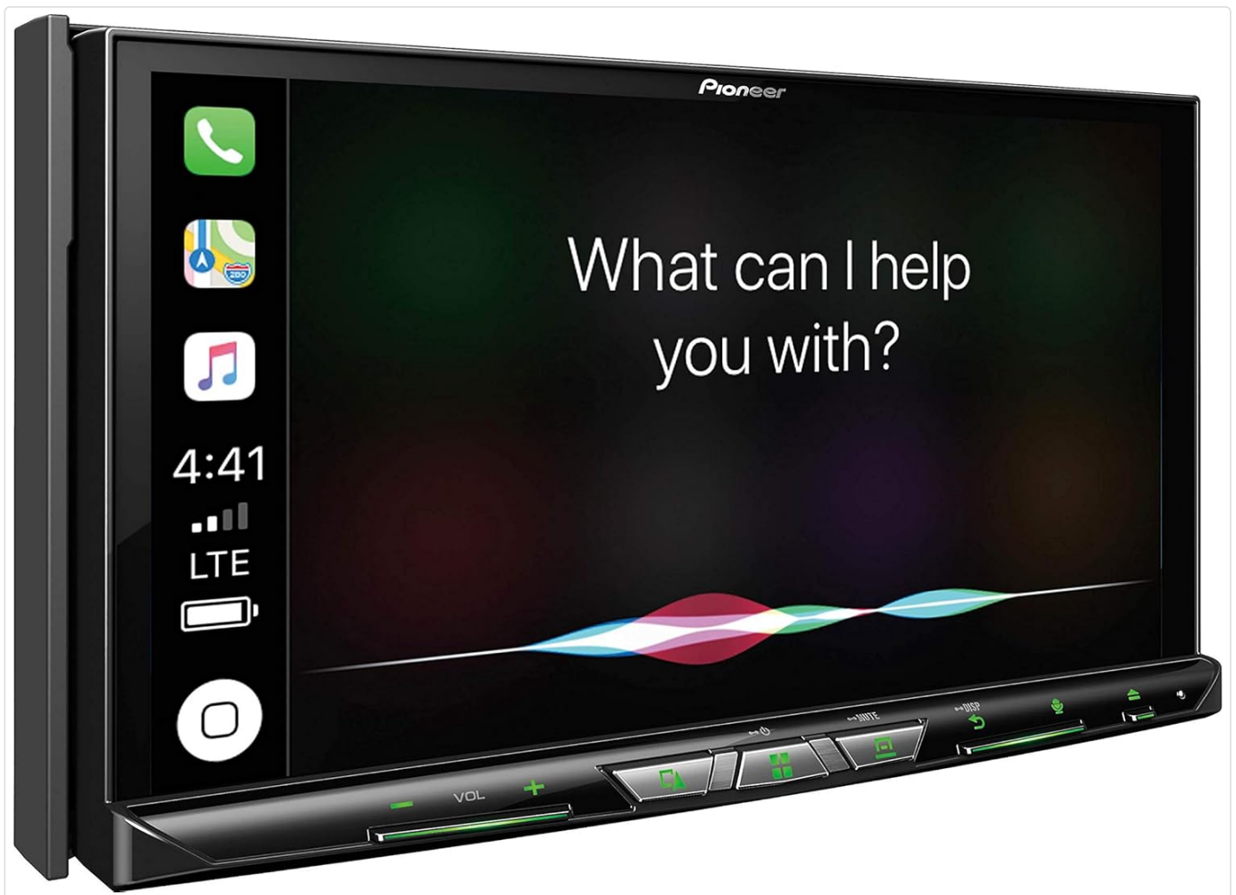
Image: The Pioneer AVIC-W8400NEX screen showing the Siri voice assistant interface, ready to receive a voice command.