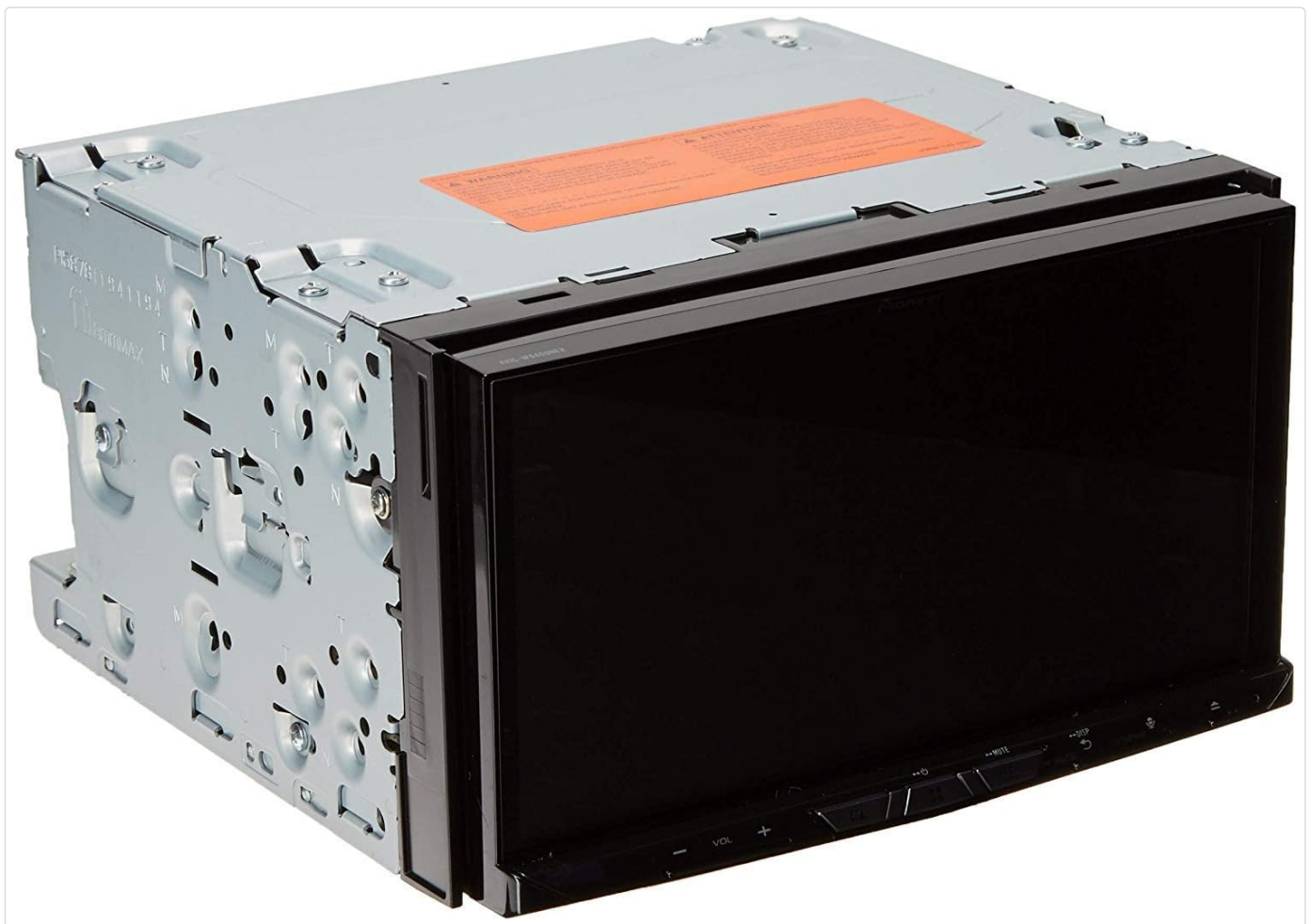
Image: The Pioneer AVIC-W8400NEX head unit with its 7-inch screen powered off, showing the physical buttons below the display.