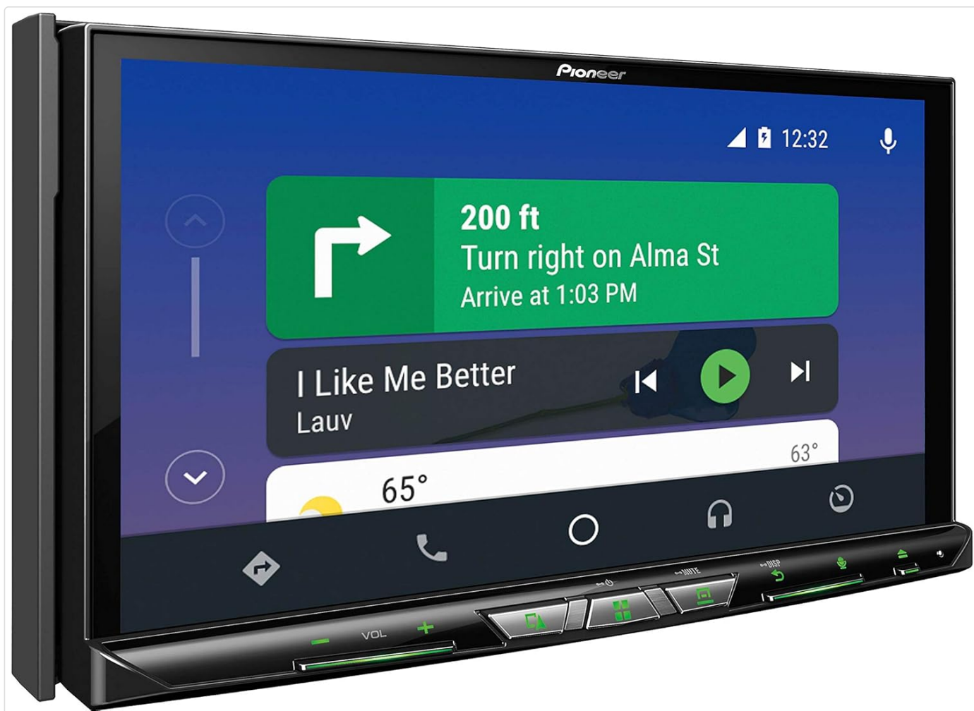
Image: The Pioneer AVIC-W8400NEX screen displaying Android Auto navigation, showing a turn instruction, estimated arrival time, and current music playback information.