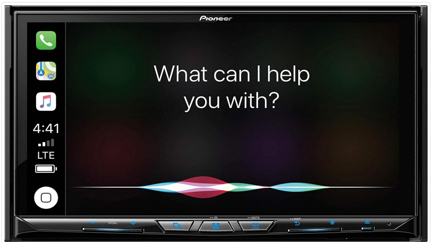
Image: The Pioneer AVIC-W8400NEX screen displaying the Siri voice assistant interface with a dynamic, colorful waveform, indicating it is listening for a command.