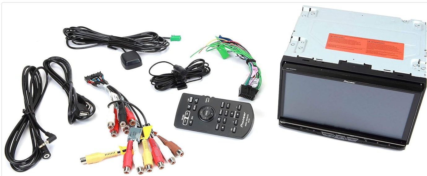
Image: Contents of the Pioneer AVIC-W8400NEX package, showing the main head unit, various wiring harnesses, a USB extension, a remote control, and other accessories.