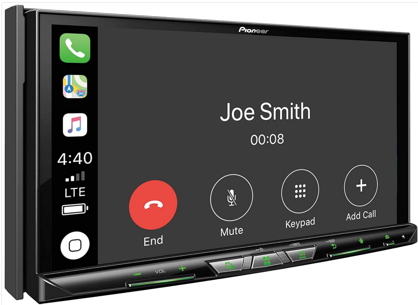
Image: The Pioneer AVIC-W8400NEX screen showing an active phone call from "Joe Smith" in the Apple CarPlay interface, with options to end, mute, use keypad, or add a call.