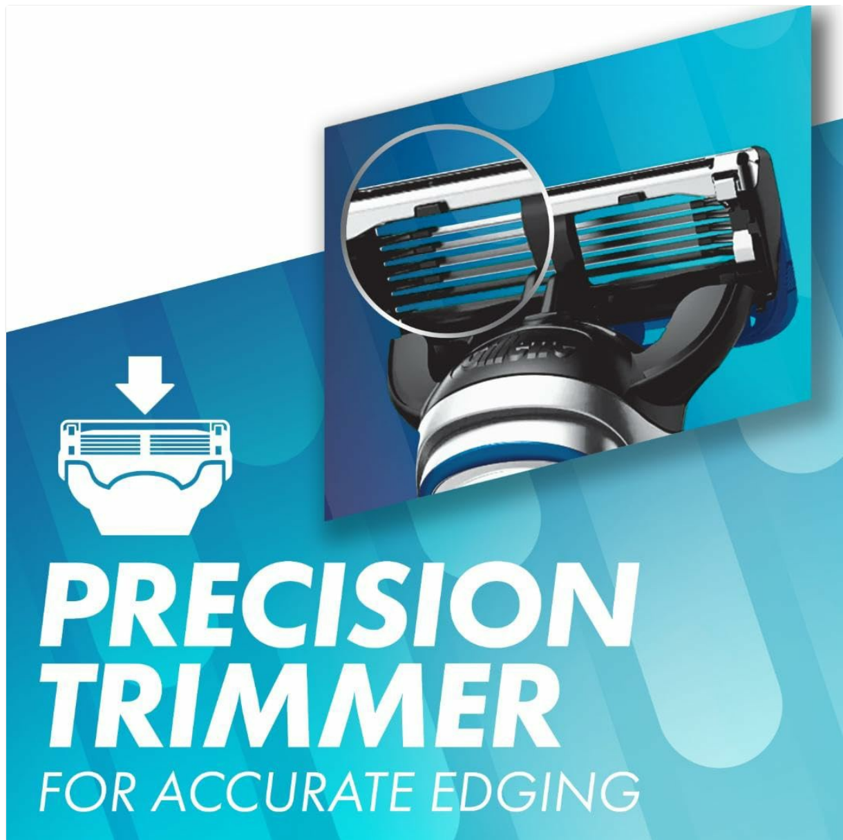
Image: The Gillette5 razor head featuring a precision trimmer, useful for accurate edging and hard-to-reach areas.