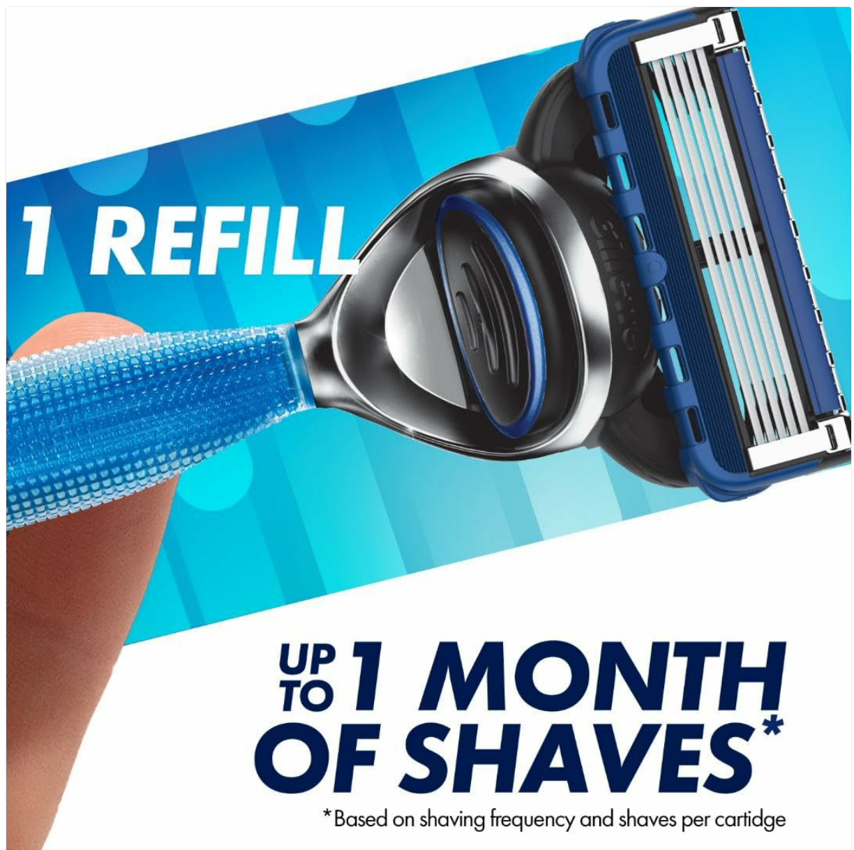
Image: A Gillette5 razor with text highlighting that one refill can provide up to one month of shaves, based on typical usage.