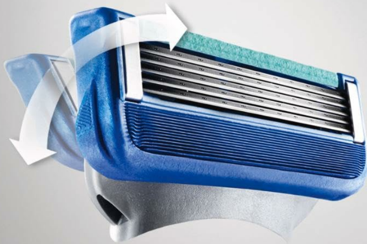
Image: A diagram demonstrating the Front Pivot technology, which helps distribute pressure evenly for enhanced skin comfort during shaving.