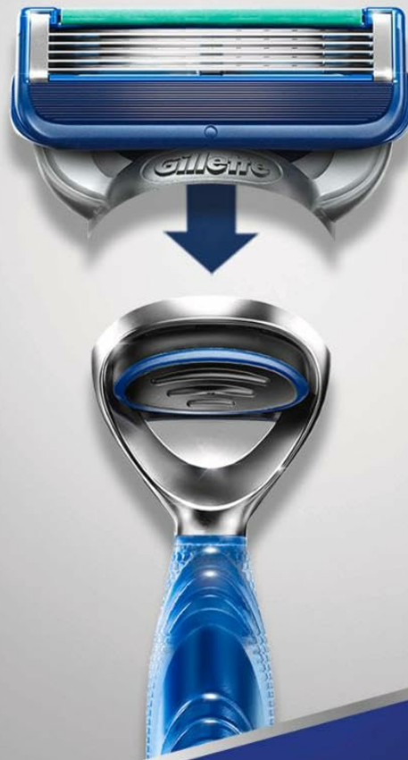
Image: A detailed view of the 15 Soft Microfins on the Gillette5 razor, designed to gently stretch the skin for a more effective shave.