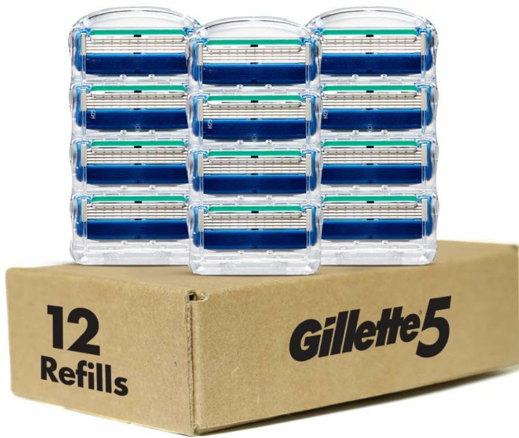
Image: A detailed view of the Gillette5 razor head, highlighting its five precision blades for a close and comfortable shave.