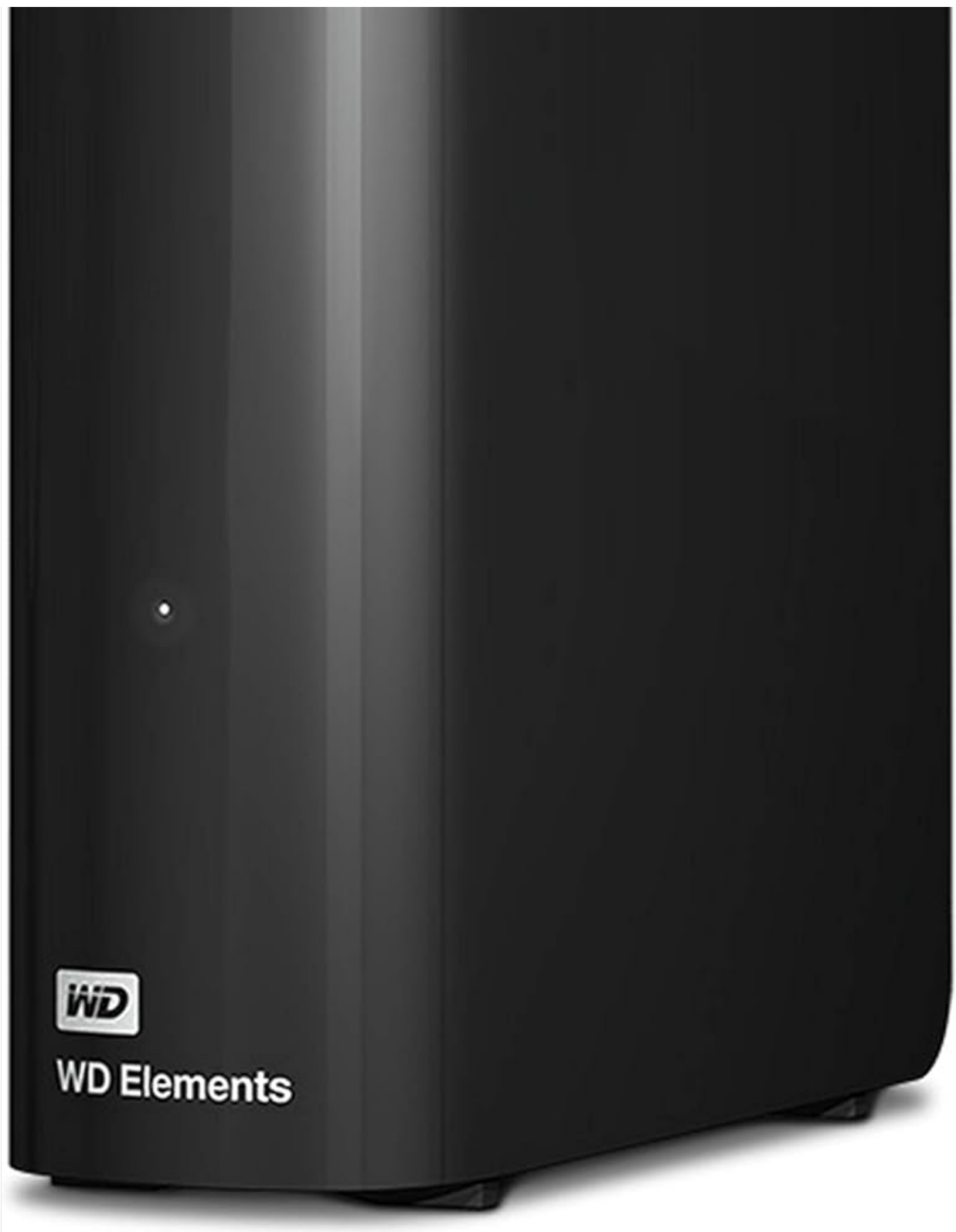
Figure 1.1: Western Digital 8TB Elements Desktop External Hard Drive.