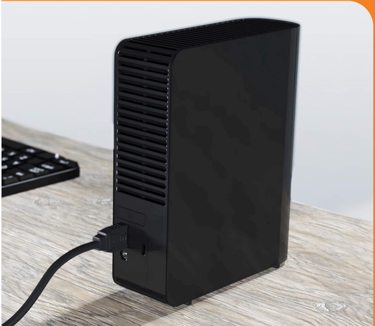
Figure 4.1: Enjoy fast data transfer rates with USB 3.0 connectivity.