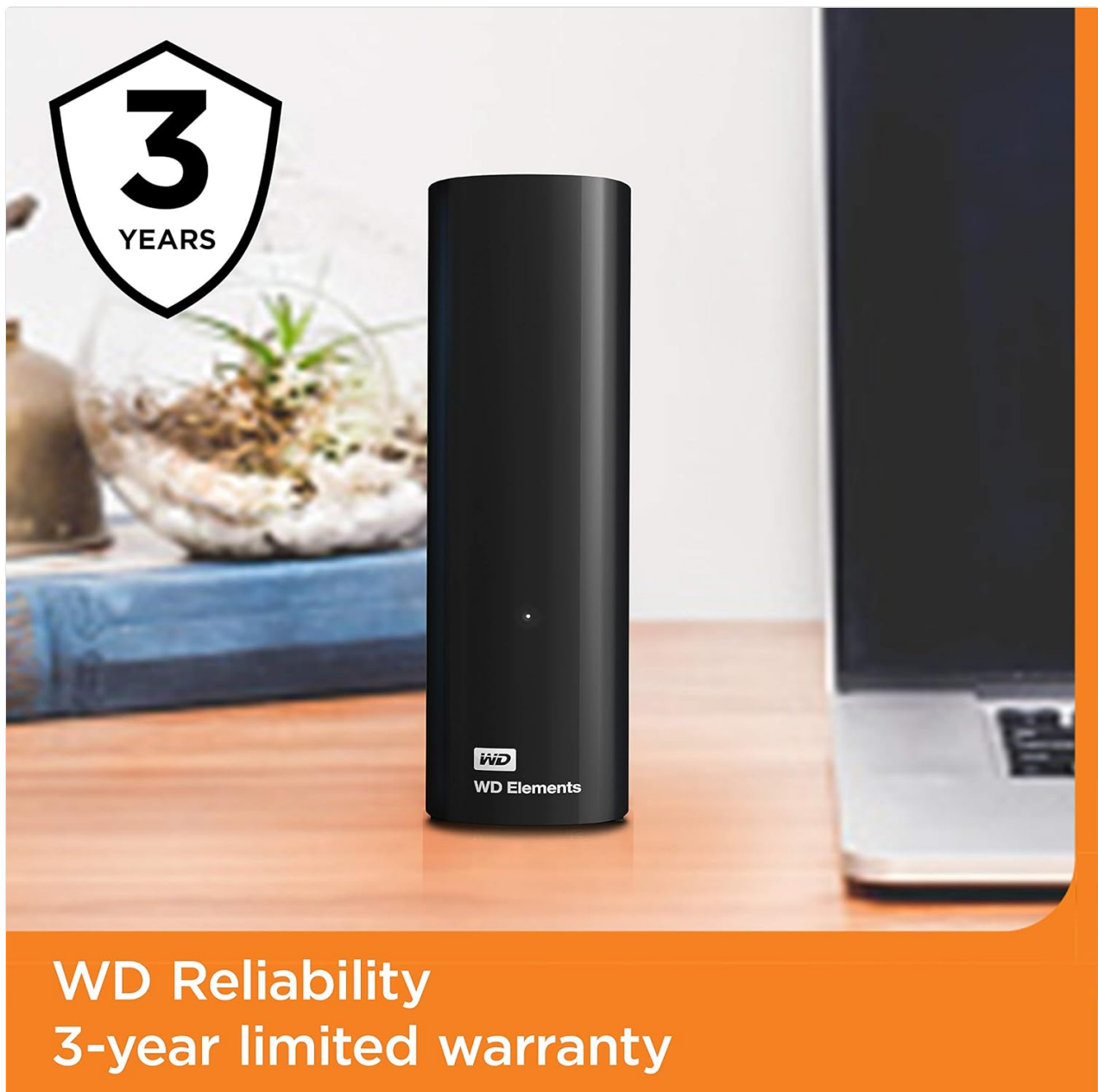
Figure 8.1: WD Elements offers reliable storage with a 3-year limited warranty.