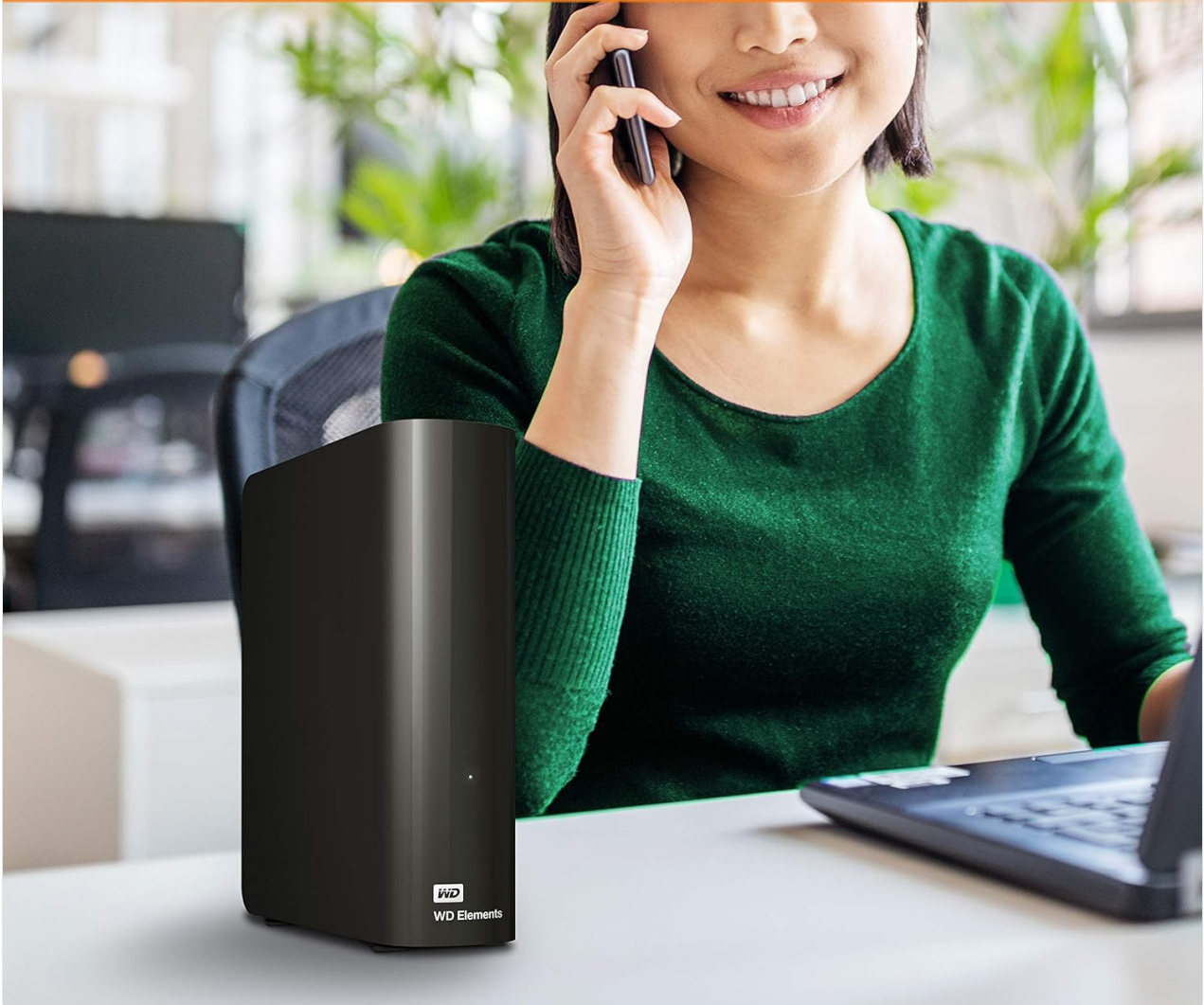
Figure 4.3: The drive offers high capacity in a sleek, desktop-friendly design.