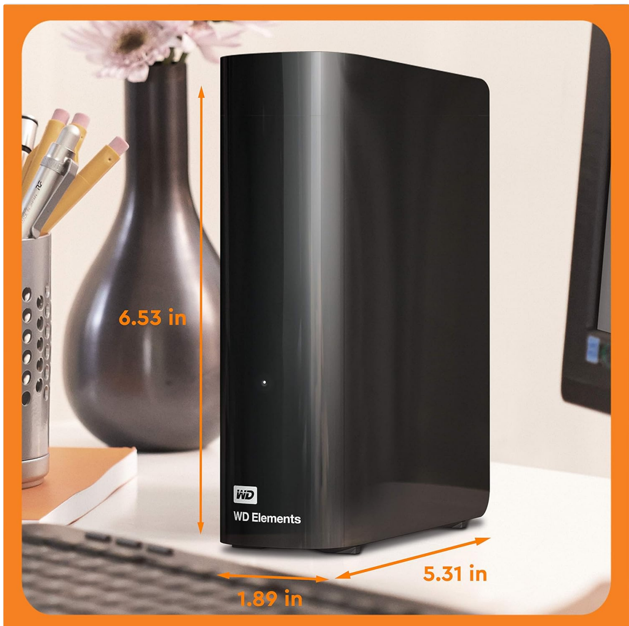
Figure 7.1: Product dimensions for the WD Elements Desktop drive.