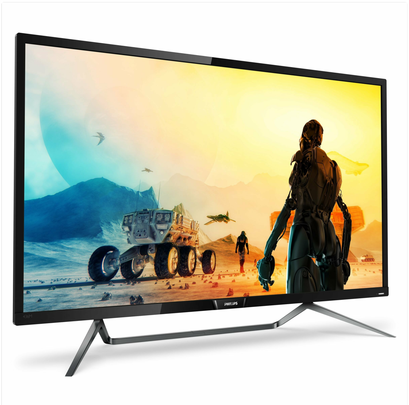
Image: Philips Momentum 436M6VBPAB Monitor and its accessories, including various cables and the stand.