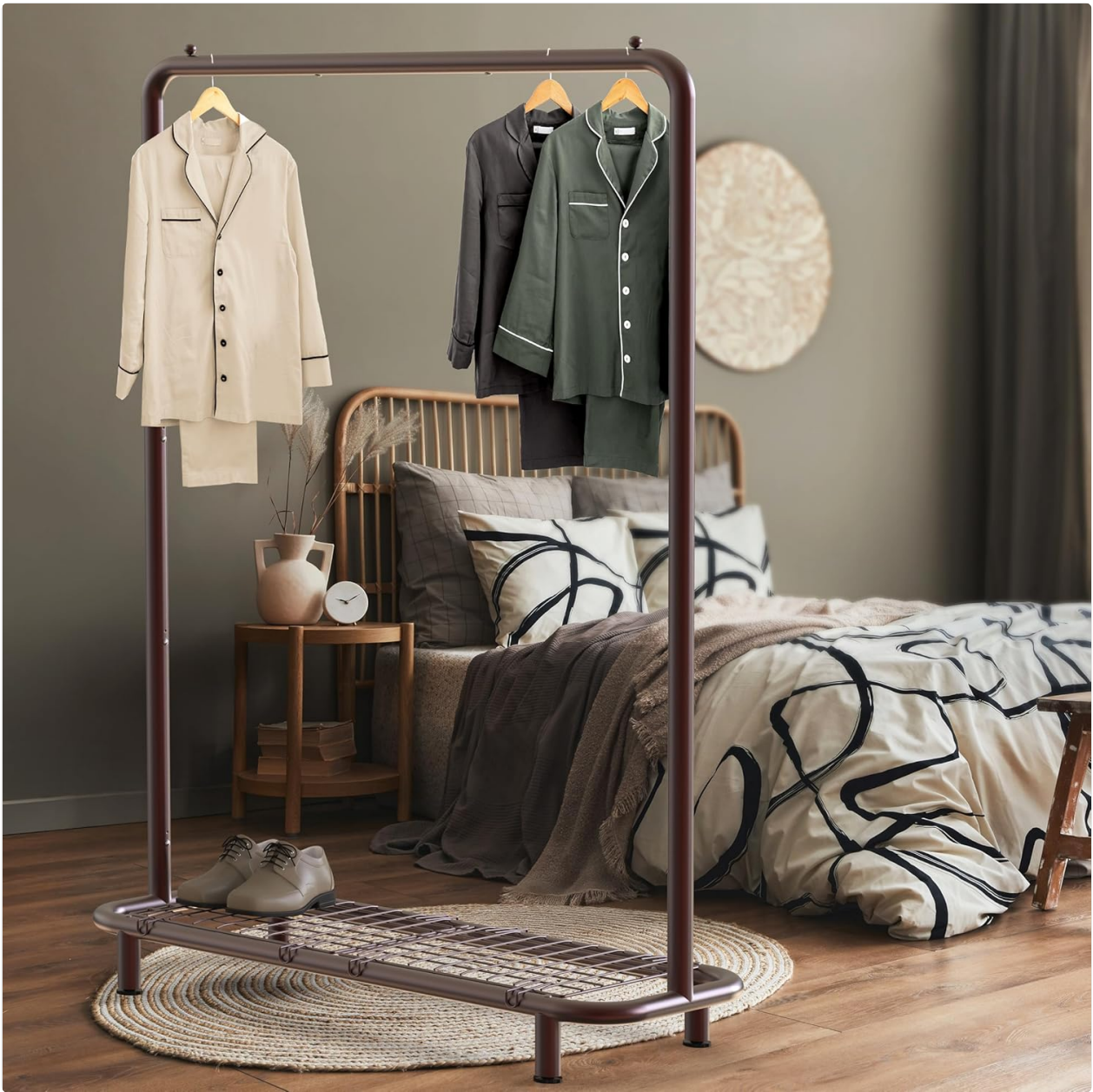
Image: The clothing rack positioned in a bedroom, demonstrating its use for hanging pajamas and storing shoes on the bottom shelf, integrating seamlessly into a living space.