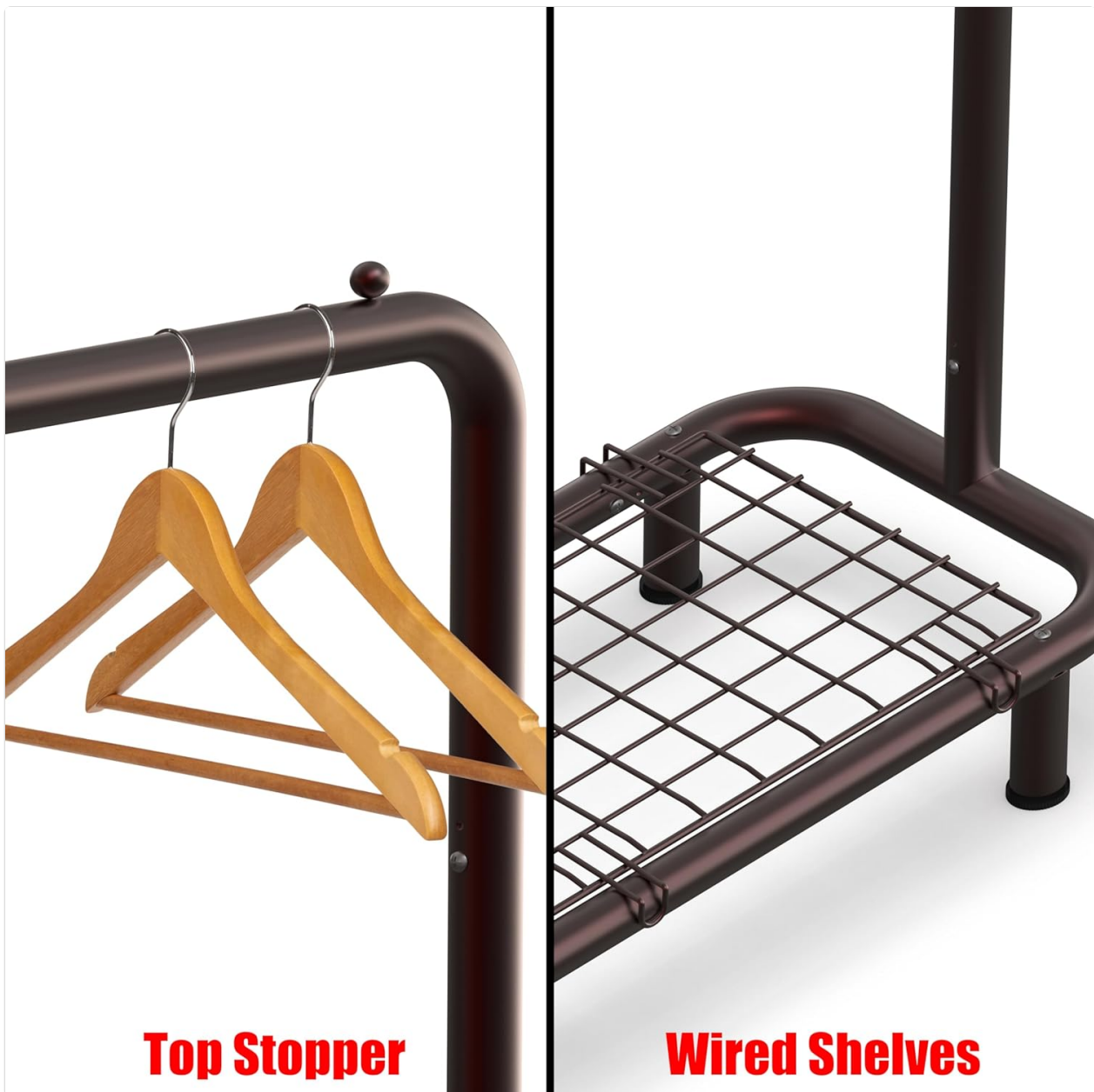
Image: A detailed view highlighting the top stopper on the hanging rod, which prevents hangers from sliding off, and the construction of the wired bottom shelves.