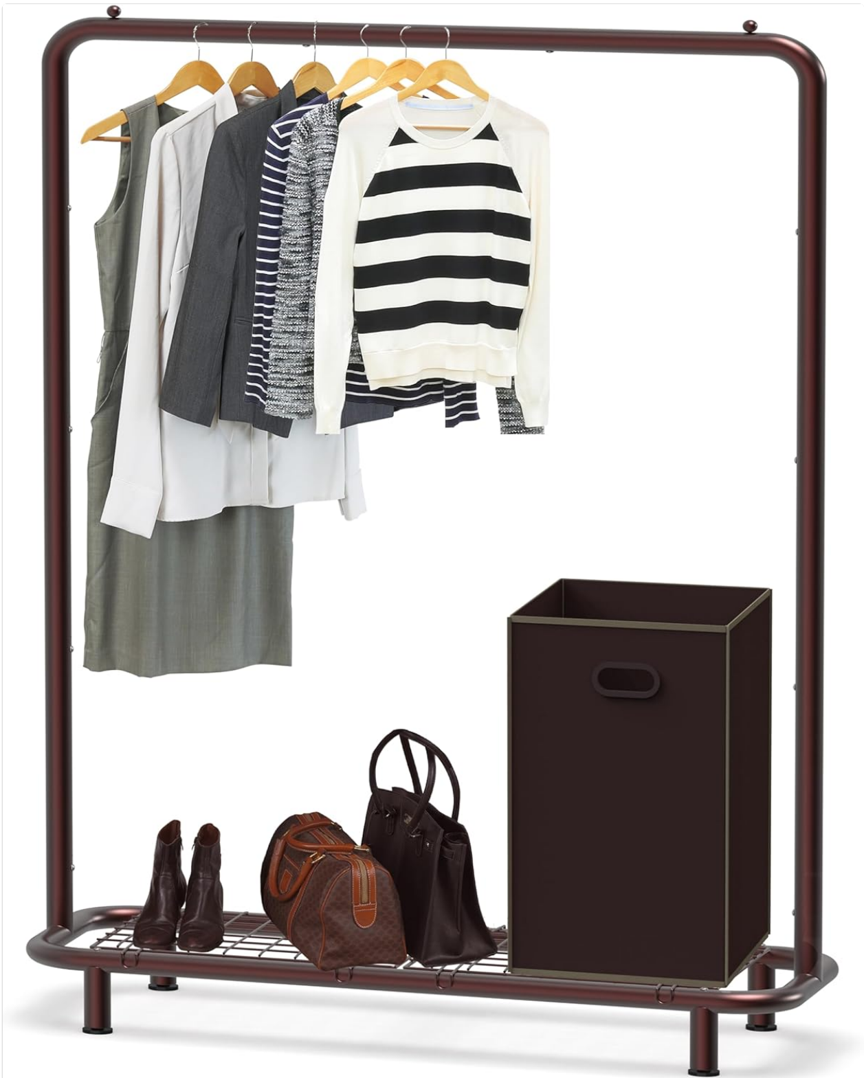
Image: The Simple Houseware Clothing Rack, showcasing its single hanging rod, bottom wire shelves, and overall bronze finish. Clothes are hung on the rod, and shoes and bags are placed on the shelves, demonstrating its storage capacity.