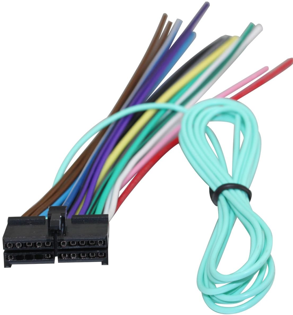
Figure 1: Overview of the Sky International 20-Pin Power Plug Cable Assembly, showing the multi-colored wires and the main connector.