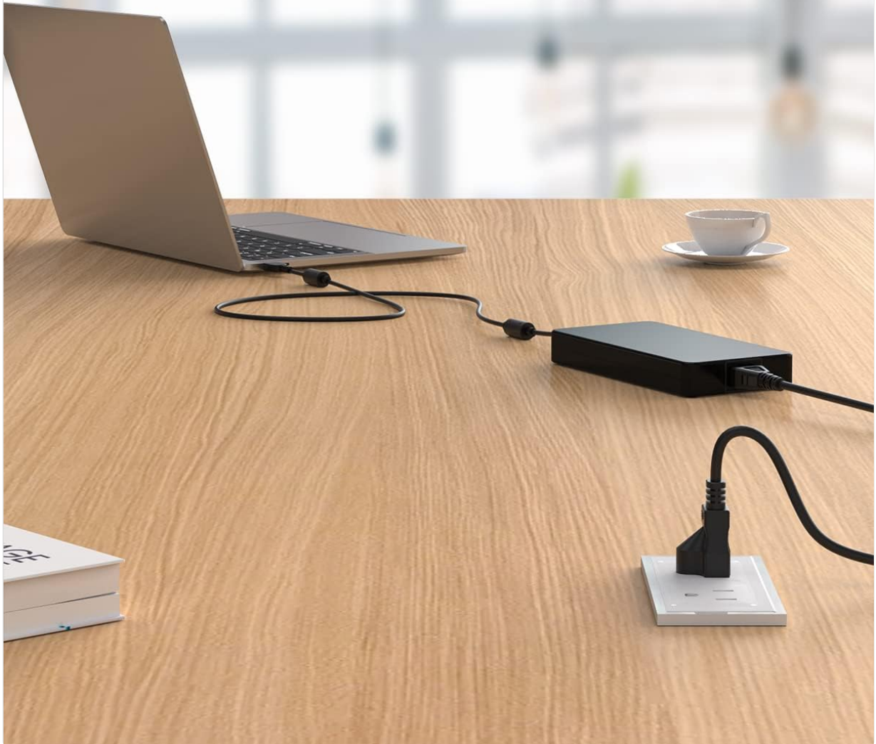
Image: A close-up view of the slim tip connector being properly inserted into a laptop's charging port.

Deliver Stable and Smooth Power to Your Laptop