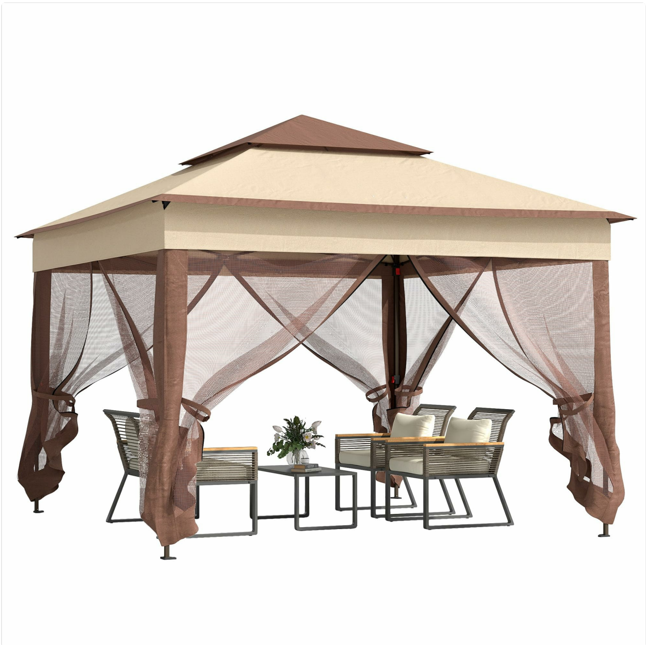
The Outsunny 11' x 11' Pop Up Canopy Gazebo with its khaki canopy and brown mesh sidewalls, providing shade over an outdoor seating area.