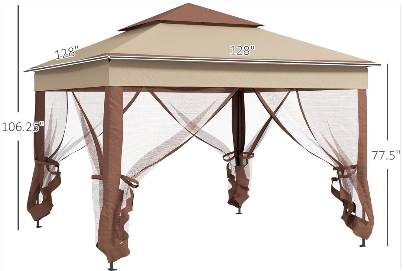
A clear diagram providing the overall length, width, height, and eaves height of the assembled gazebo.