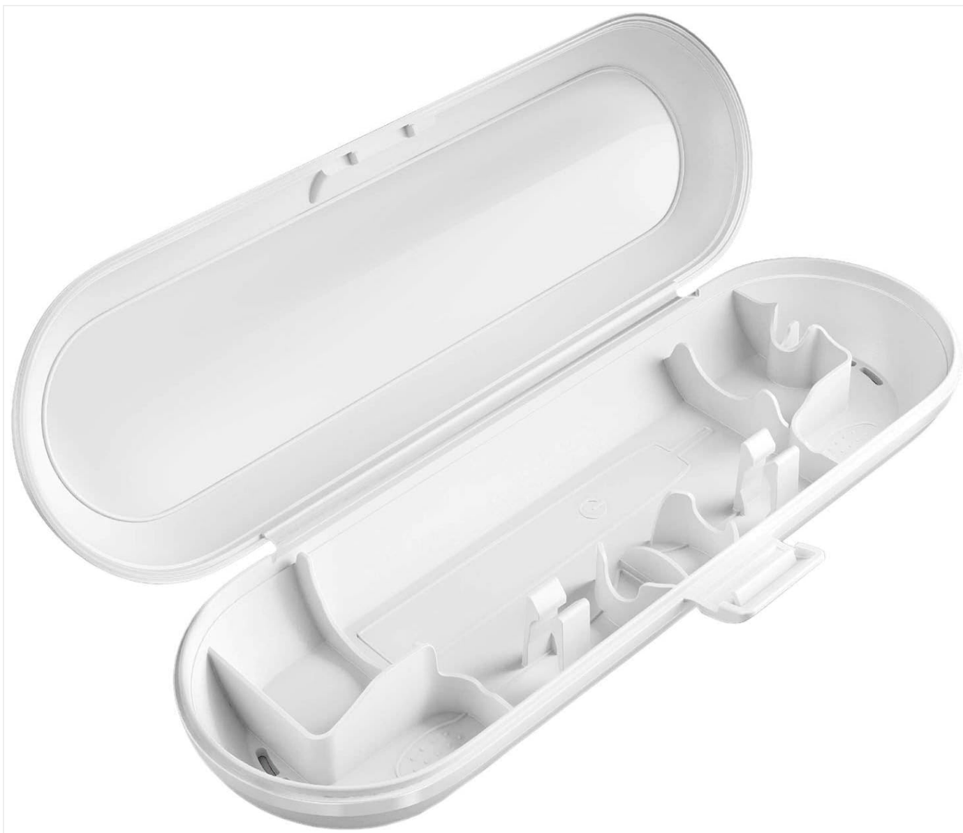
Image: The Philips Sonicare ProtectiveClean travel case, designed to hold the toothbrush handle and two brush heads securely for travel.