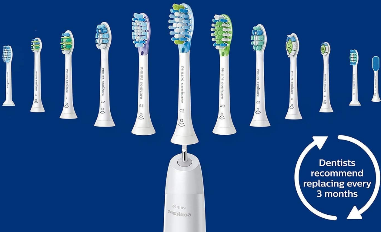
Image: A display of various Philips Sonicare click-on brush heads, demonstrating their compatibility with the toothbrush handle and the recommendation to replace them every 3 months.

Fits all Philips Sonicare click-on handles