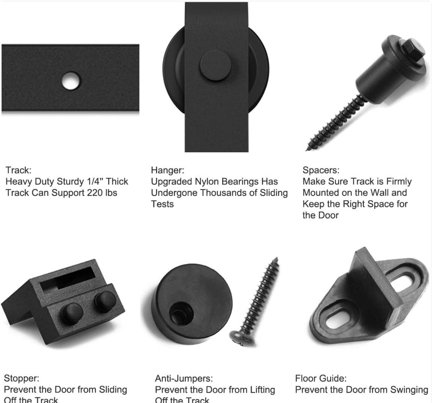
Figure 4: Close-up view of key hardware components including track, hanger, spacer, stopper, anti-jumper, and floor guide.