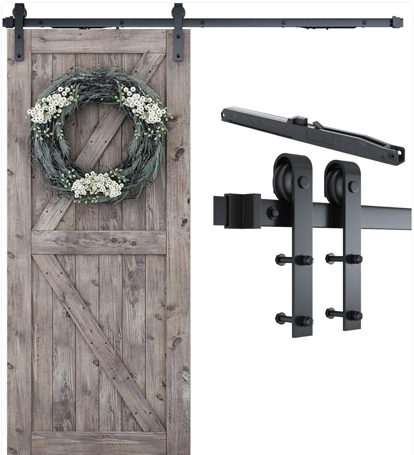
Figure 1: Complete SMARTSTANDARD 6.6 FT Sliding Barn Door Soft Close Hardware Kit.