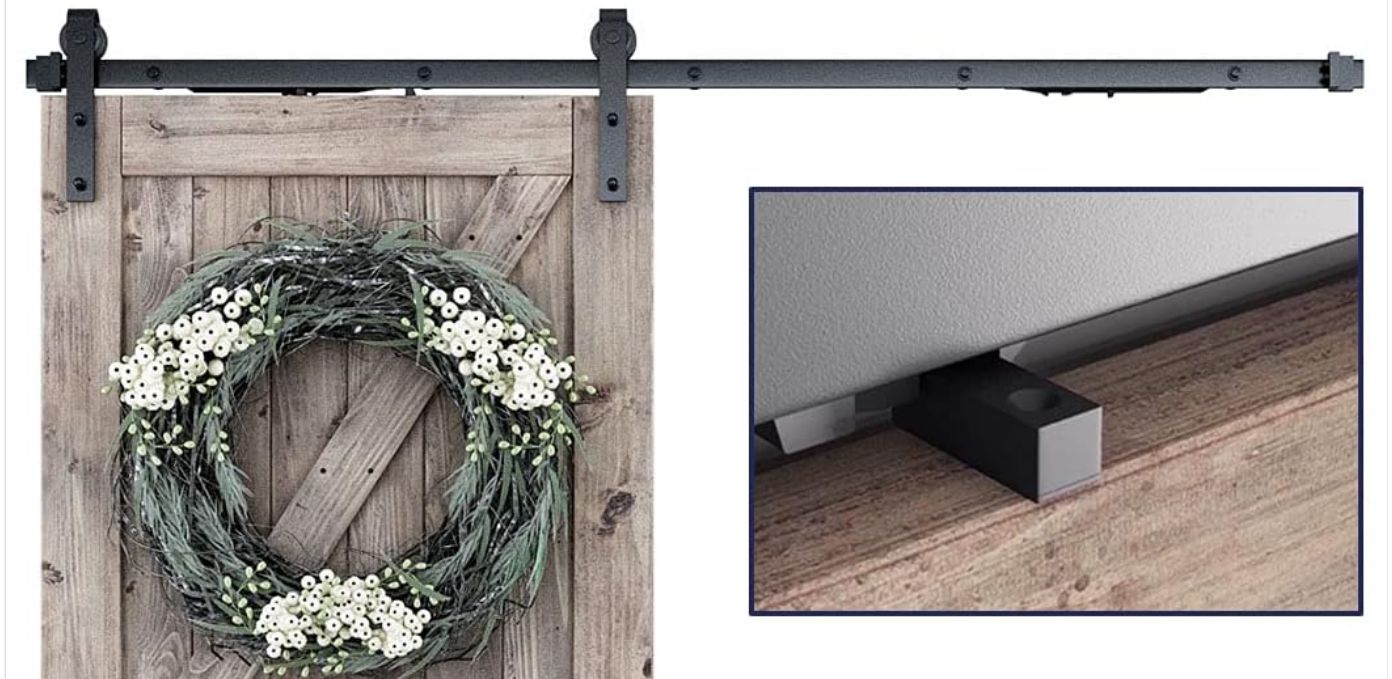
Figure 2: Illustration of the soft close mechanism, highlighting its benefits for quiet and reliable operation.