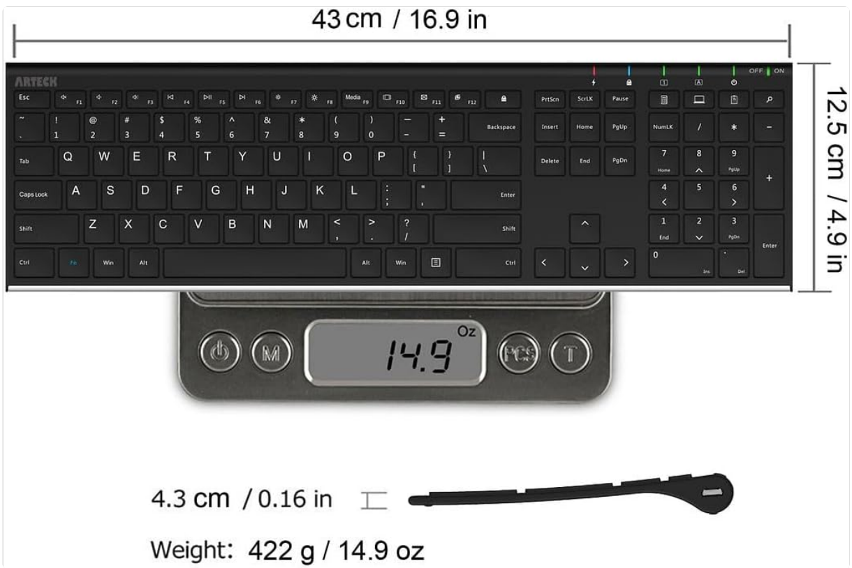
Figure 6: Keyboard dimensions and weight.