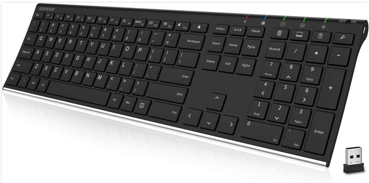
Figure 1: Arteck 2.4G Wireless Keyboard and USB receiver.

Thank you for choosing the Arteck 2.4G Wireless Keyboard. This ultra-slim, full-size keyboard with a numeric keypad is designed for comfortable and quiet typing, offering seamless connectivity and a long-lasting rechargeable battery. This manual provides detailed instructions to help you set up, operate, and maintain your new keyboard.