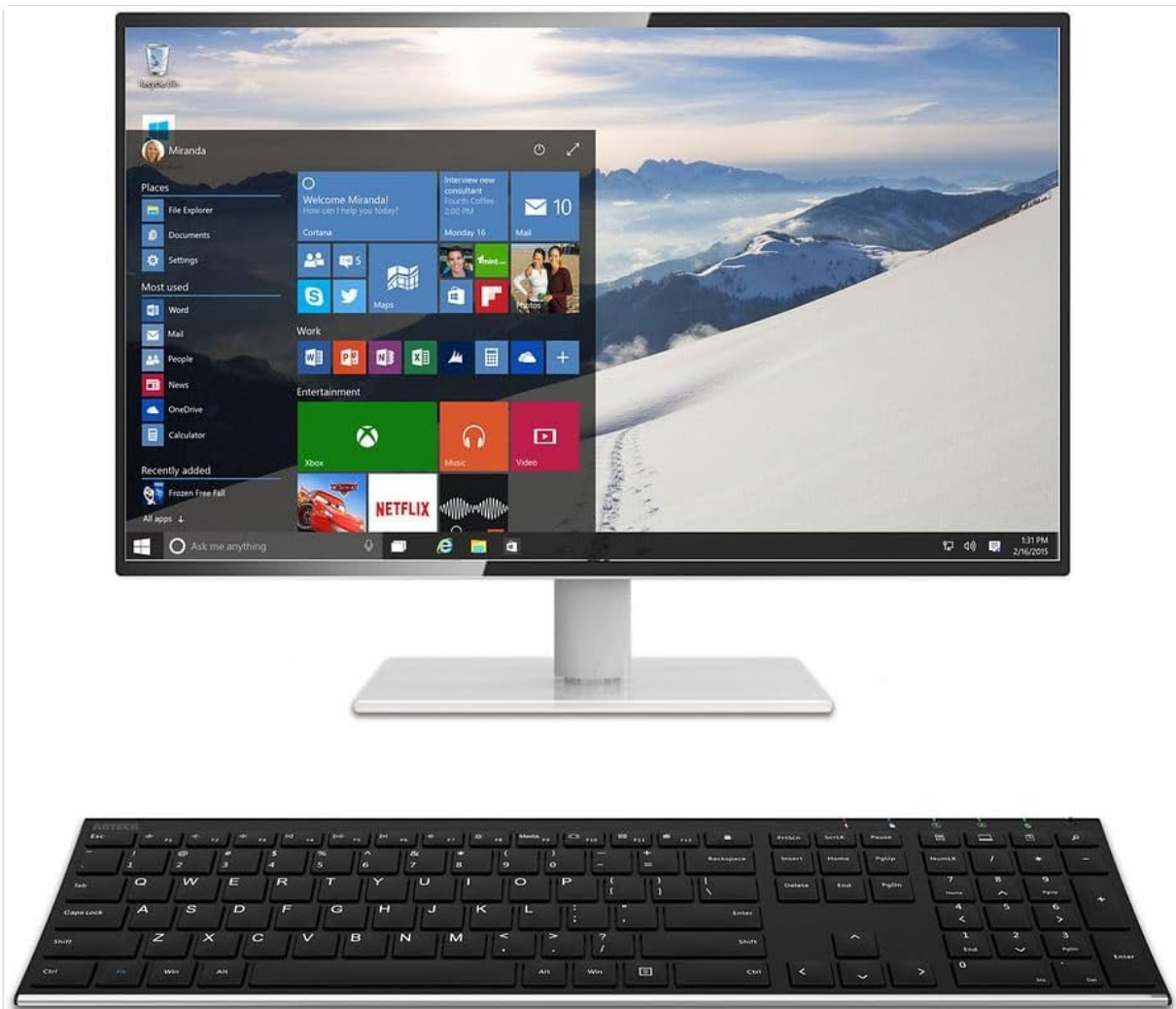
Figure 4: Keyboard in a typical desktop setup.