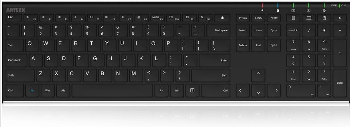
Figure 5: The keyboard offers long battery life.

Use for 6 months per charge, based on 2 hours per day