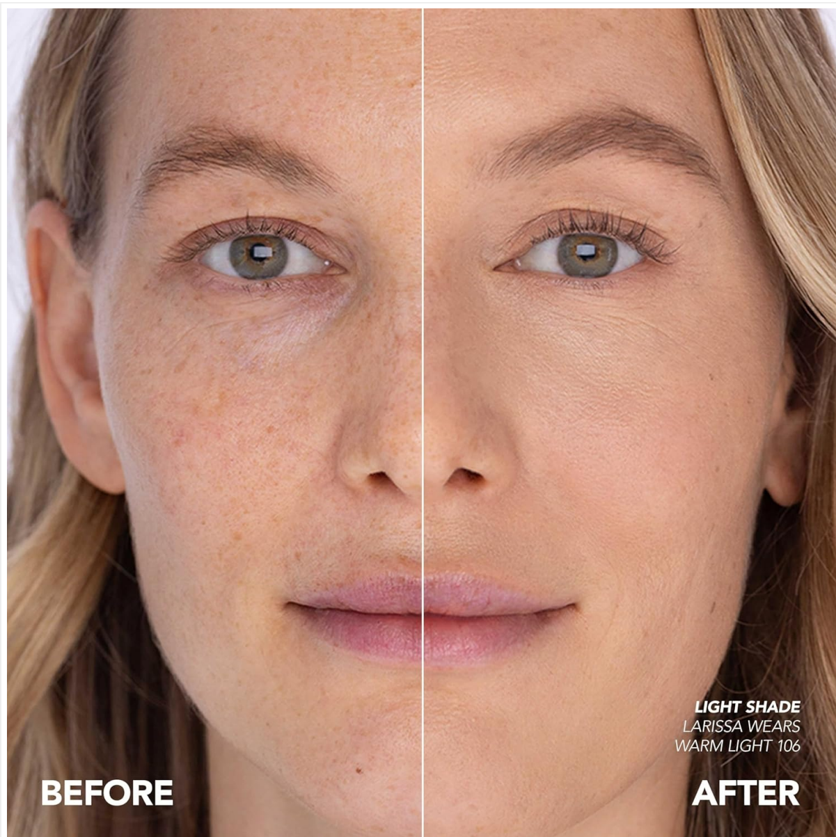
Image 4: A visual comparison of skin before and after applying the CCC Cream, demonstrating its coverage and natural finish.

Video 1: Demonstration of applying CCC Cream for a dewy, moisturized complexion. This video illustrates the blending process and the resulting skin finish.