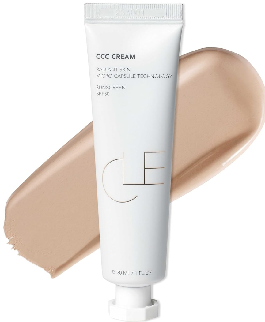
Image 1: The CLE Cosmetics CCC Cream tube, showcasing the product and a swatch of its texture and color.