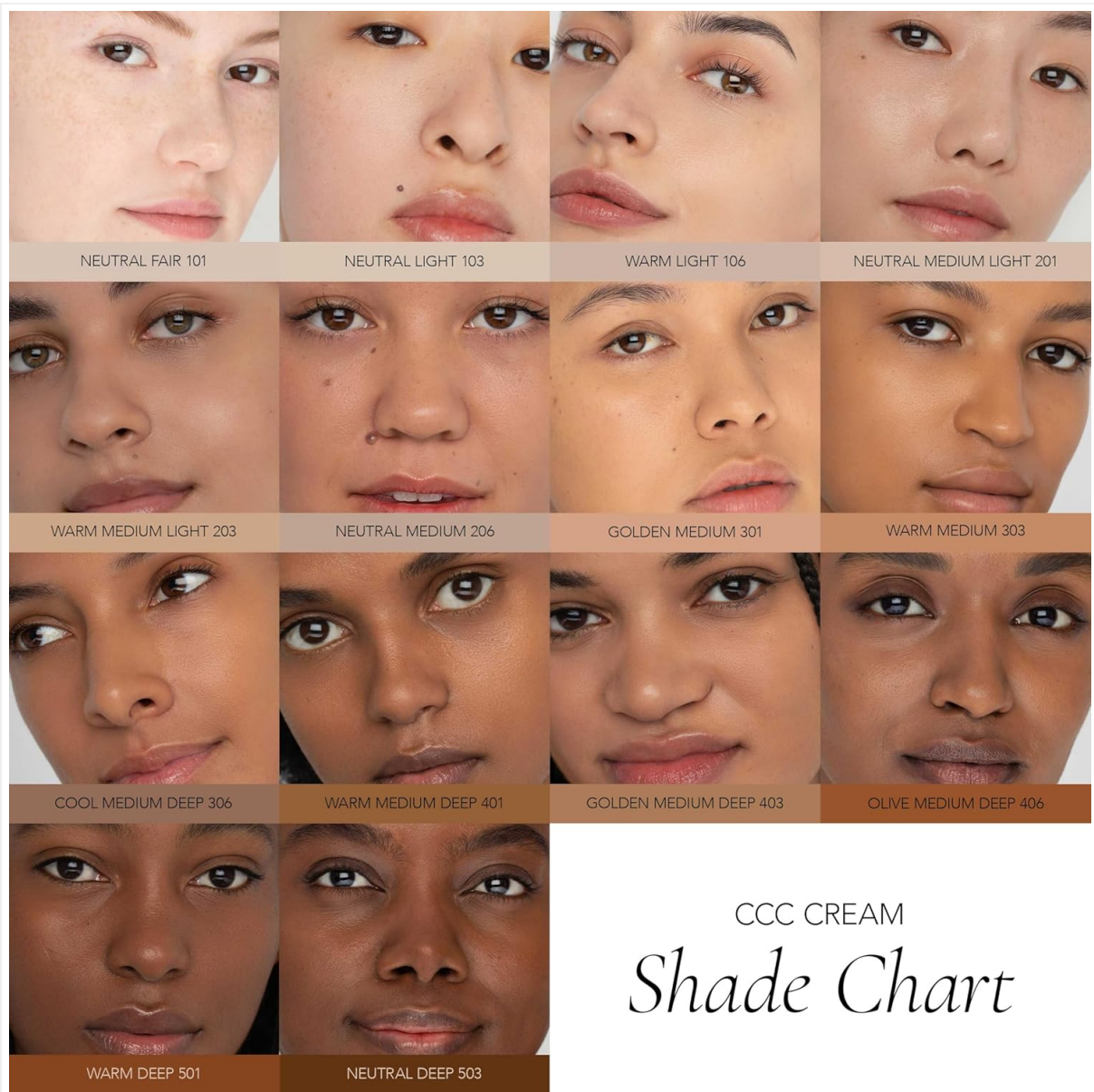
Image 5: A comprehensive shade chart displaying different skin tones and the corresponding CCC Cream shades to help users find their best match.