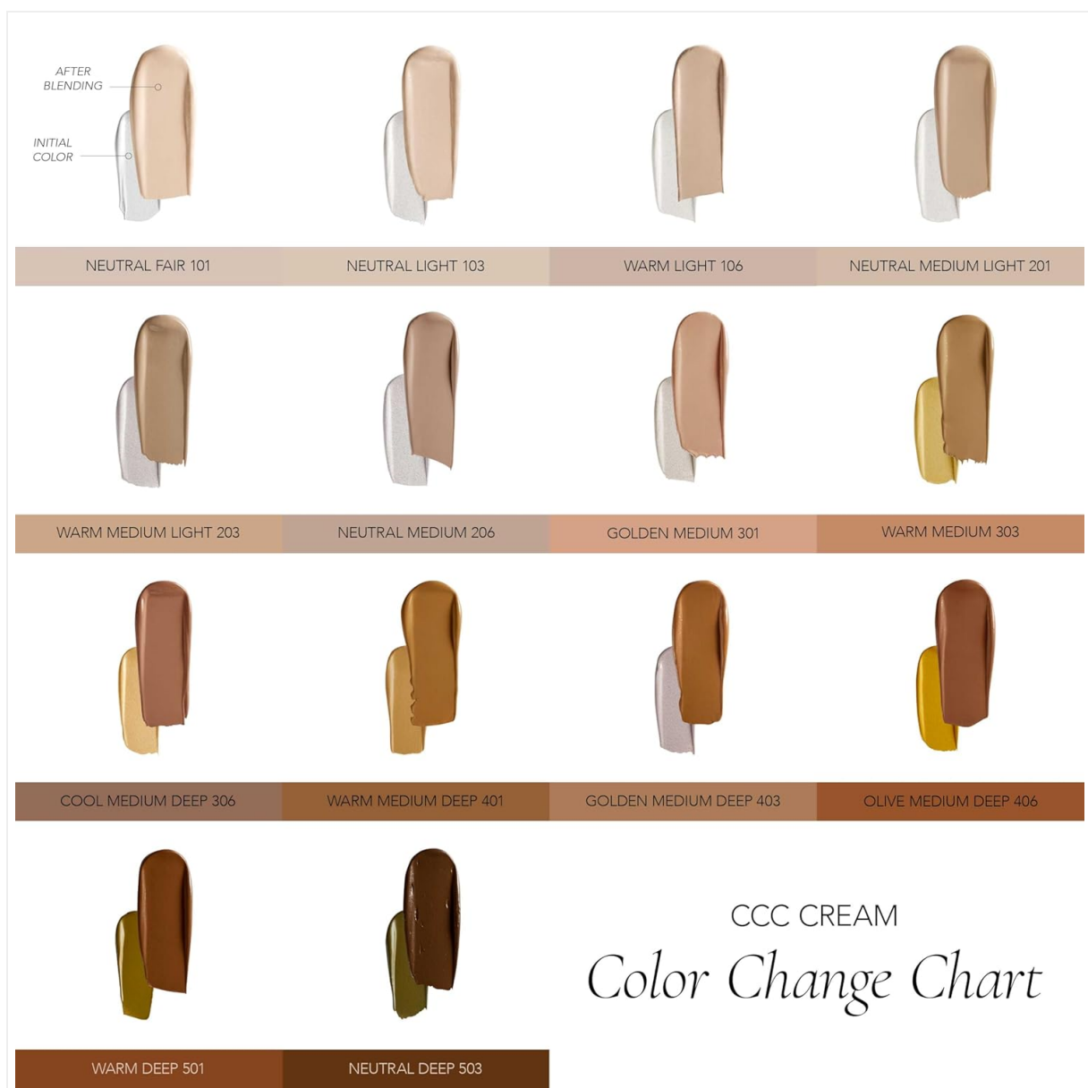
Image 6: A visual guide demonstrating the color-changing effect of the CCC Cream, showing how the initial white cream blends into different skin tones.