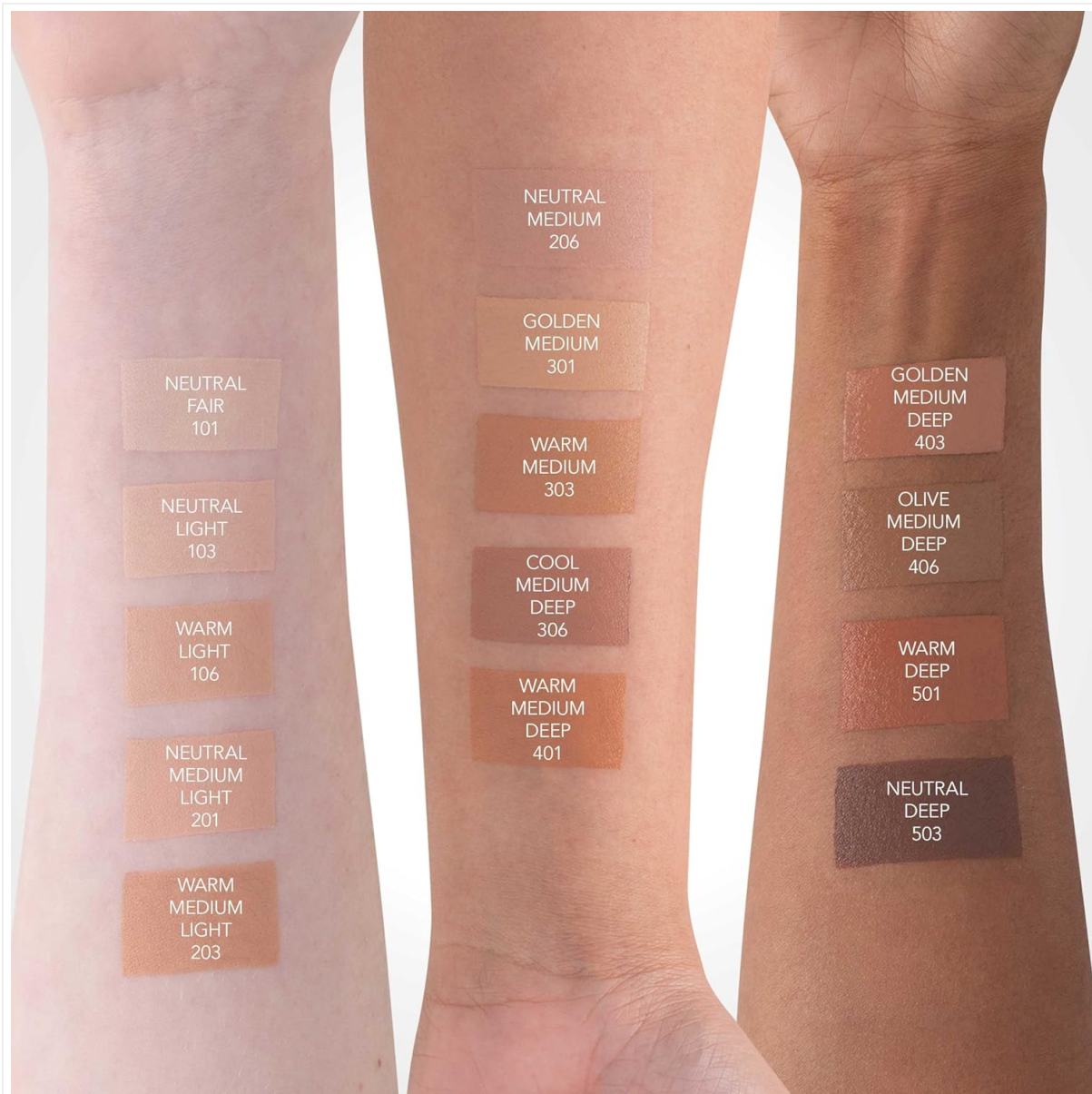
Image 7: Swatches of various CCC Cream shades applied to different arm skin tones, illustrating the product's ability to adapt and match.