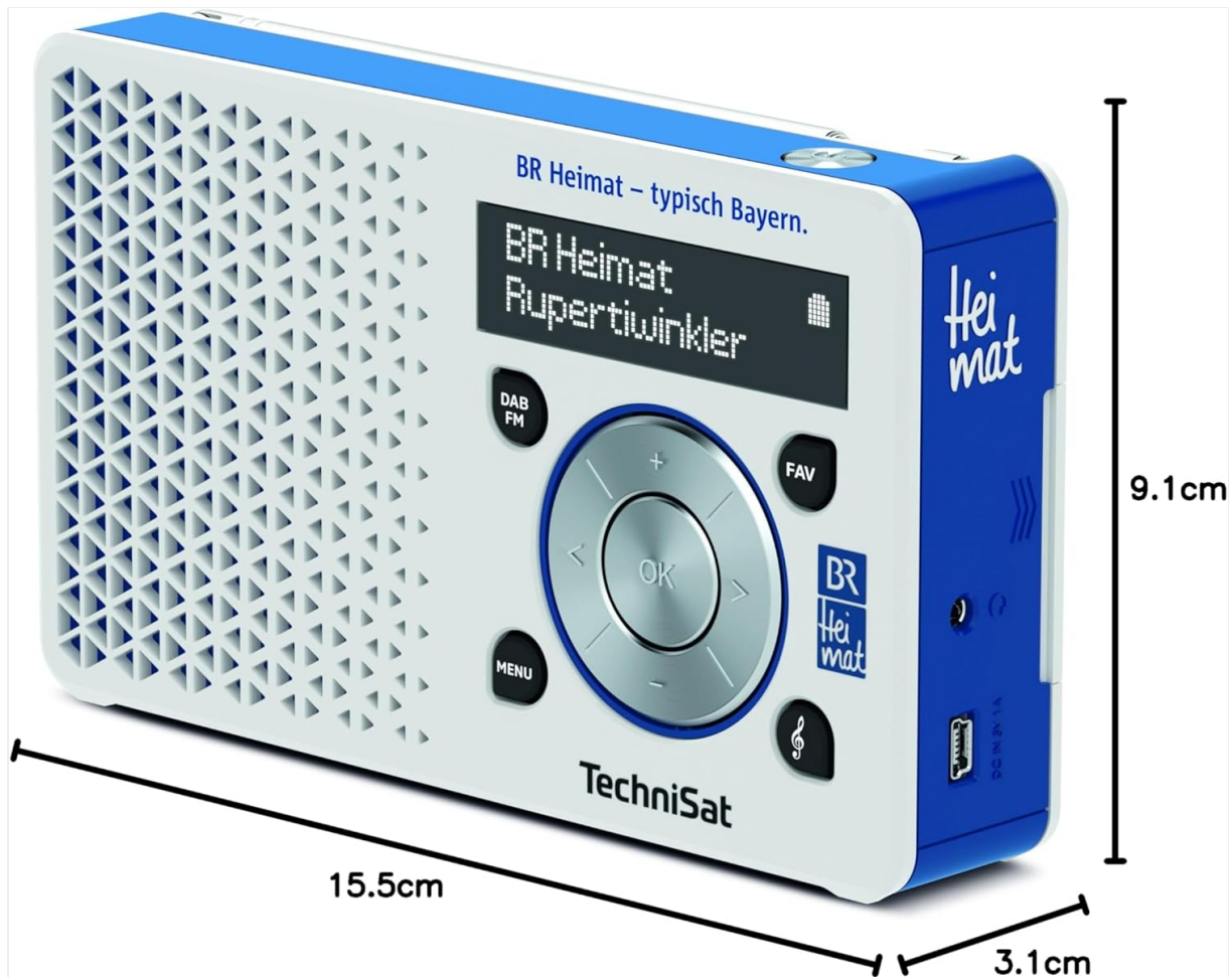
Figure 4: TechniSat Digitradio 1 BR Home Edition showing its dimensions: 15.5 cm length, 3.1 cm width, and 9.1 cm height.