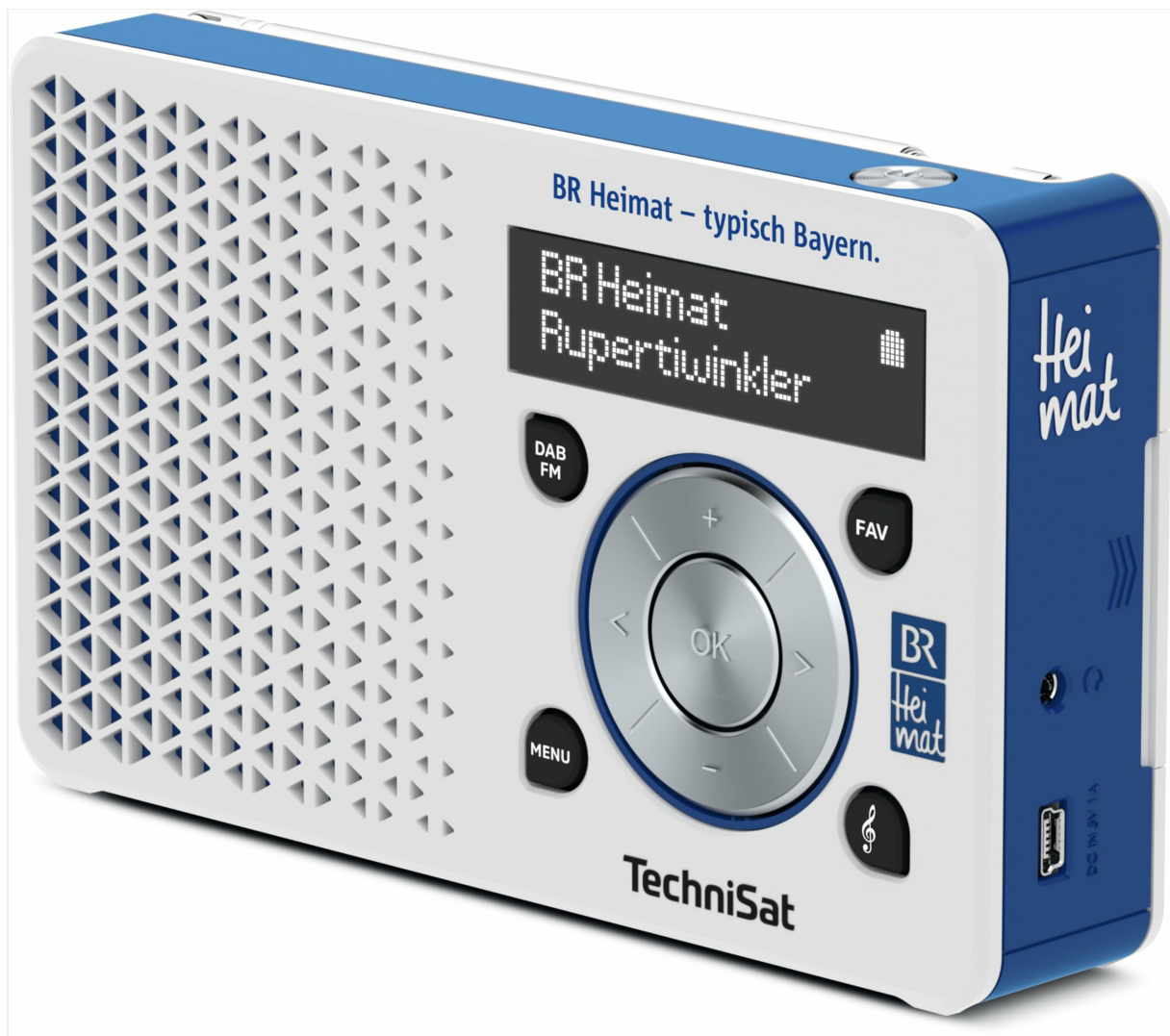
Figure 1: Front view of the TechniSat Digitradio 1 BR Home Edition, showing the display, control knob, and speaker grille.