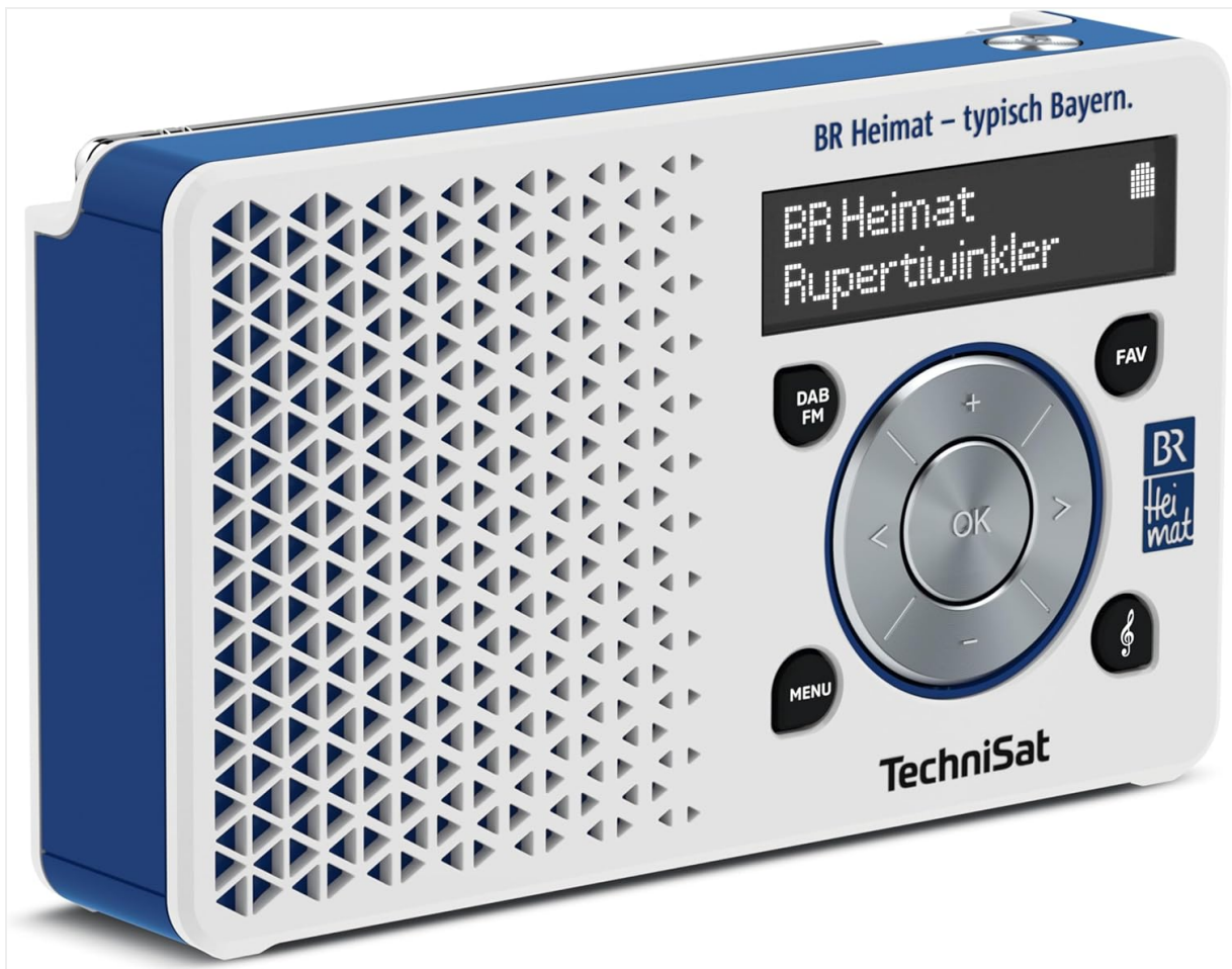
Figure 3: Angled view of the TechniSat Digitradio 1 BR Home Edition, illustrating the control panel with menu, DAB/FM, favorite, and navigation buttons.