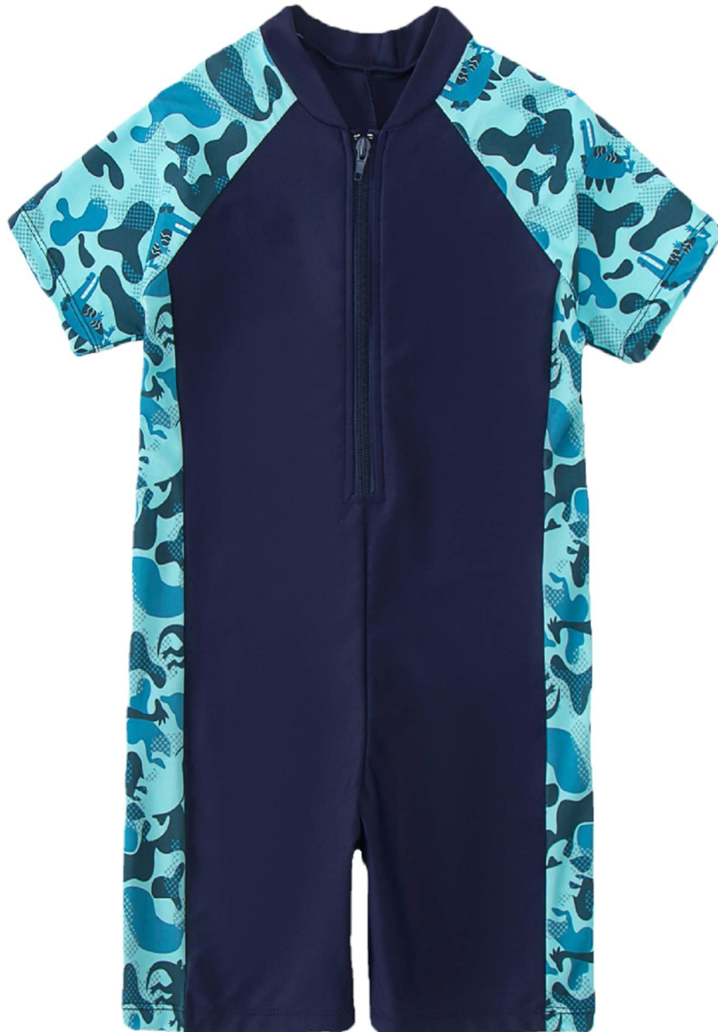
Front view of the M2C One Piece Water Sport Short Swimsuit, showcasing the navy color and short sleeve design.