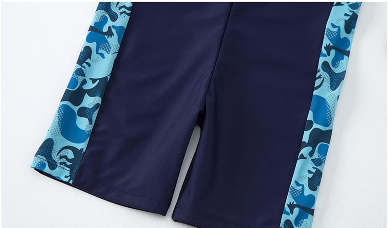
Detailed view of the swimsuit's front zipper for easy wearing and the comfortable leg opening.