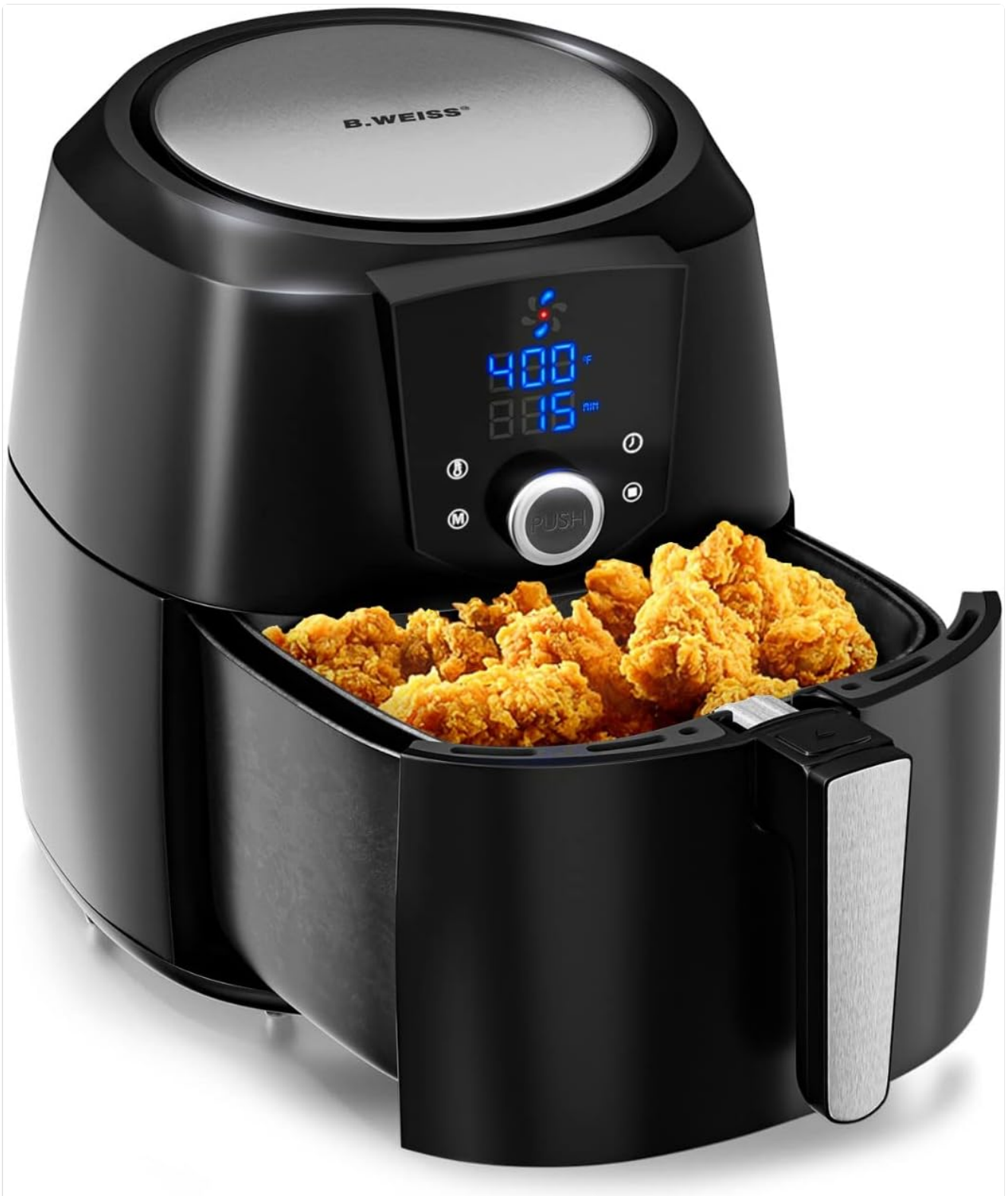
The B. WEISS Air Fryer XL Extreme Model, showcasing its sleek black design and digital display.