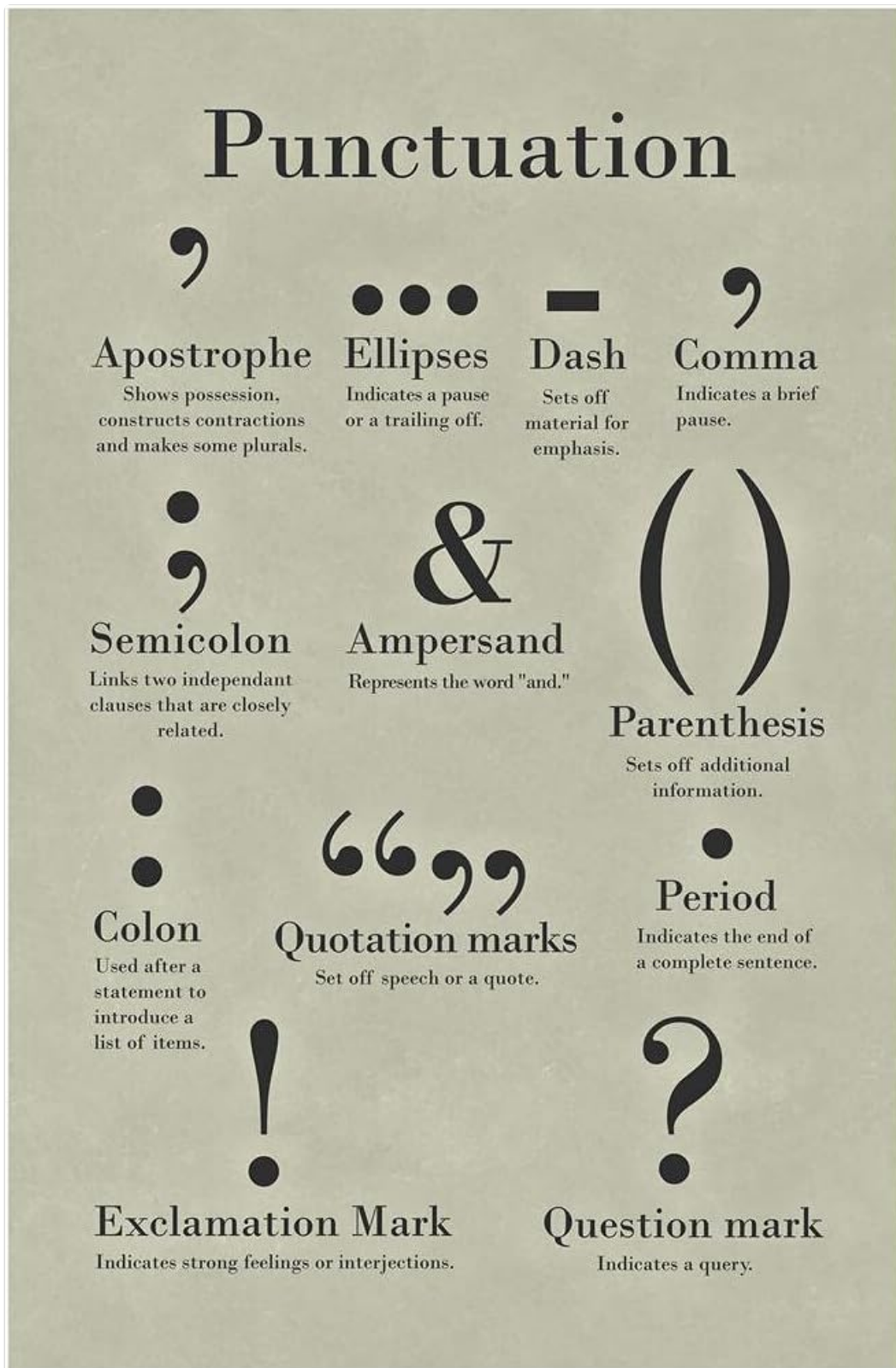
Figure 1: Front view of the Punctuation and Grammar Educational Poster, displaying various punctuation marks and their definitions.