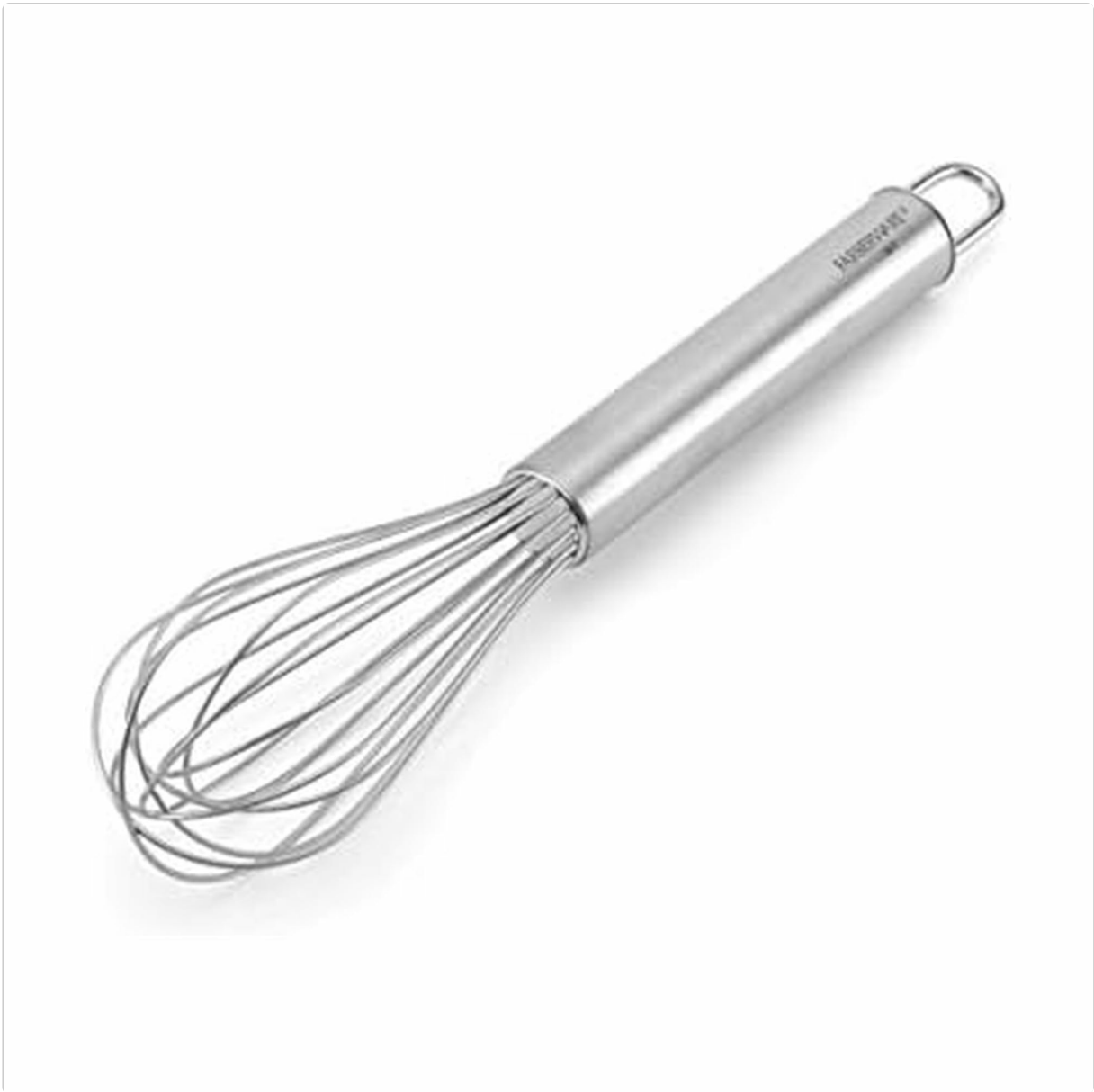
Image: The 10-inch Farberware Professional Stainless Steel Whisk, showcasing its design and construction.