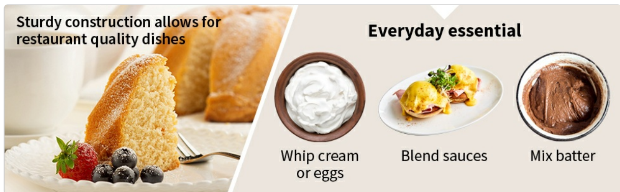
Image: Examples of the whisk's utility in preparing various dishes, including whipping cream, blending sauces, and mixing batters.