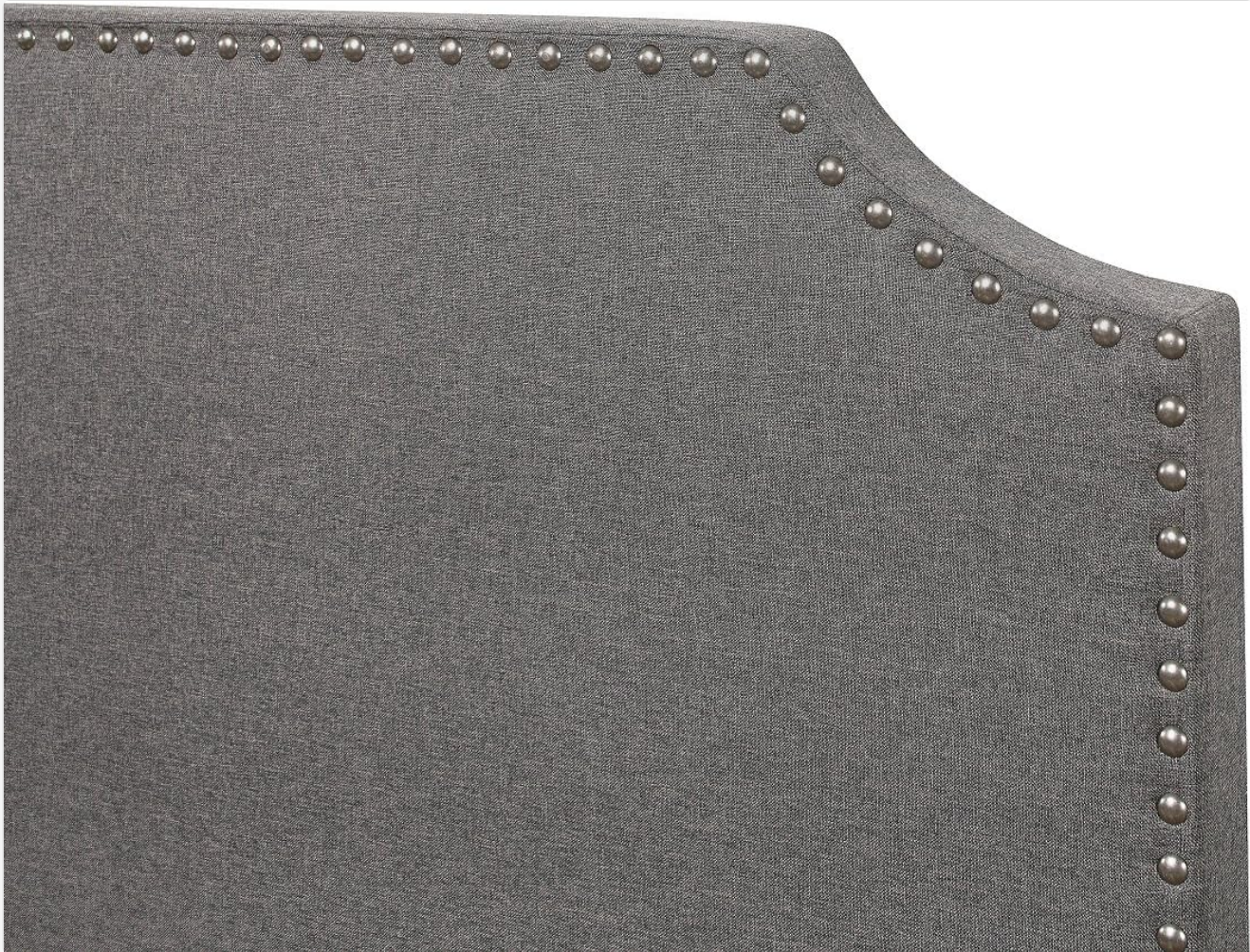
Image: A detailed view of the headboard's dark grey fabric upholstery and the decorative silver nail head trim along its curved edge.