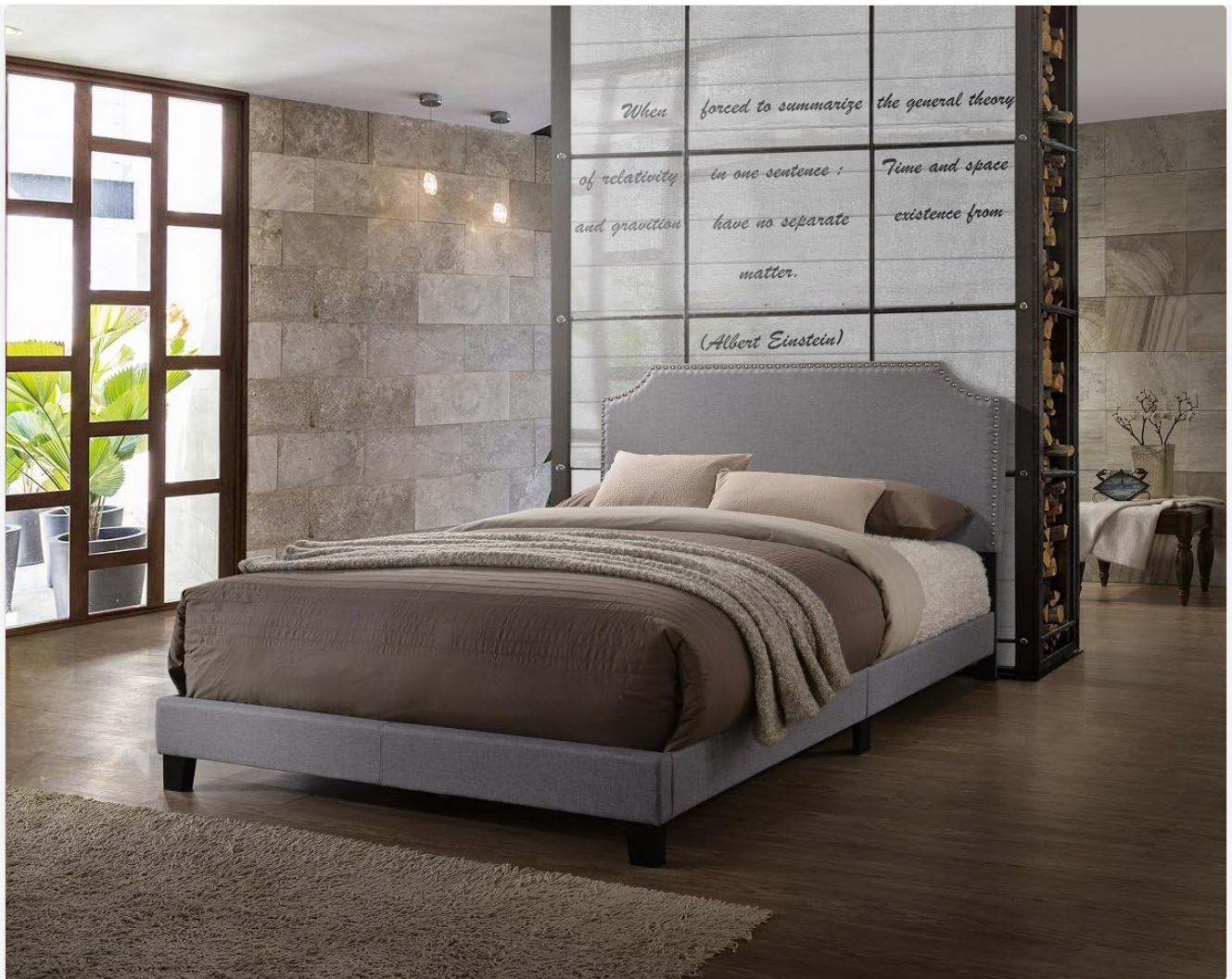
Image: The fully assembled HOME DESIGN Tory Upholstered Panel Bed with a mattress and bedding, showcasing its appearance in a contemporary room.