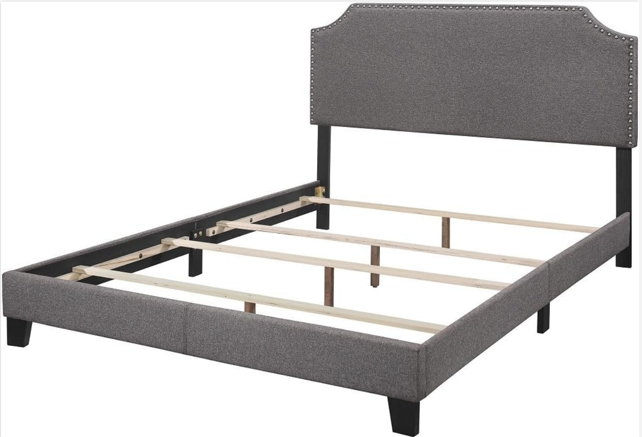
Image: The bed frame components, including the upholstered headboard, side rails, footboard, and wooden slats, laid out before assembly. This shows the structure that supports the mattress.