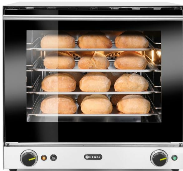
Image: Front view of the HENDI 227077 convection oven with bread baking inside.

Carefully remove the oven from its packaging. Inspect for any shipping damage. Place the oven on a stable, level, and heat-resistant surface. Ensure there is sufficient clearance around the appliance for proper ventilation (minimum 10 cm on sides and rear, 20 cm above). Do not place the oven near flammable materials or heat sources.