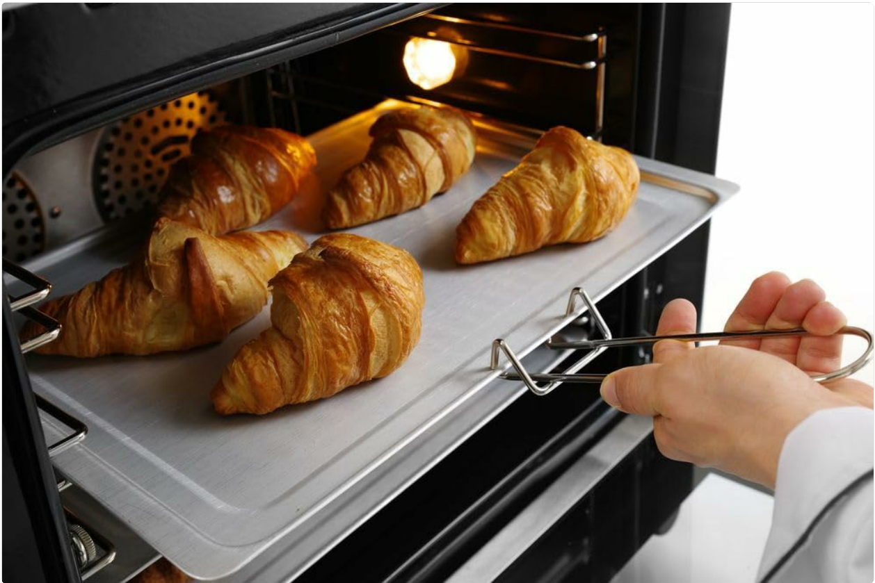
Image: A person using a gripper to remove a tray of freshly baked croissants from the oven.