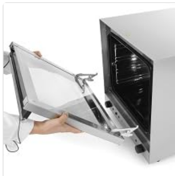
Image: A person demonstrating the removal of the oven door for cleaning or maintenance.

The double-glazed door can be cleaned with glass cleaner. For thorough cleaning or maintenance, the door can be removed. Consult a qualified technician for door removal and reinstallation to avoid damage or injury.