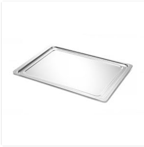
Image: A standard baking tray, compatible with the HENDI convection oven.