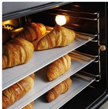
Image: Close-up view of croissants baking on multiple trays inside the convection oven.