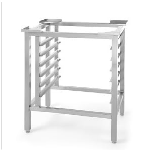
Image: An optional stainless steel stand for the HENDI convection oven.