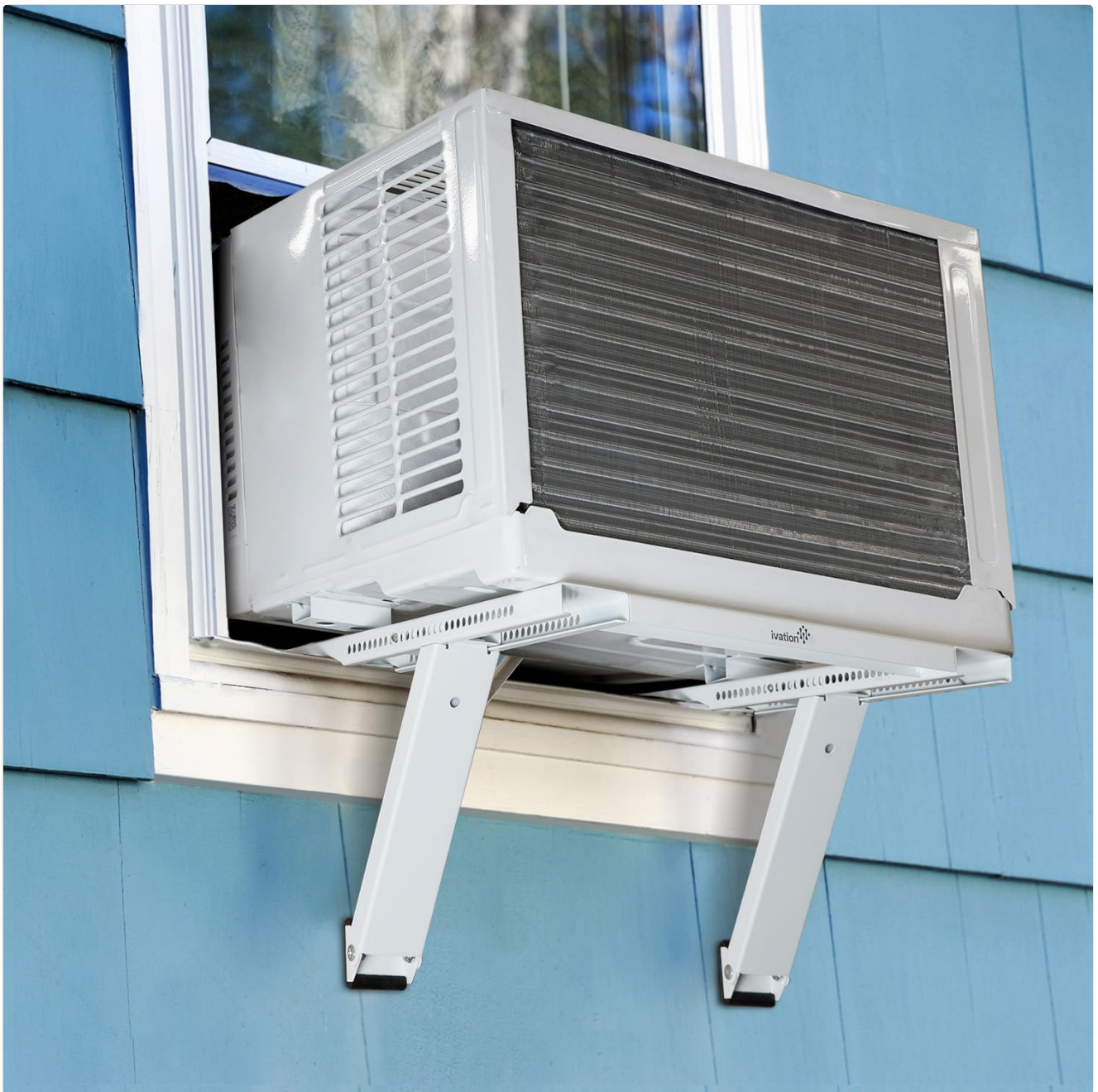
Figure 6: An air conditioner unit securely placed on the Ivation support bracket.