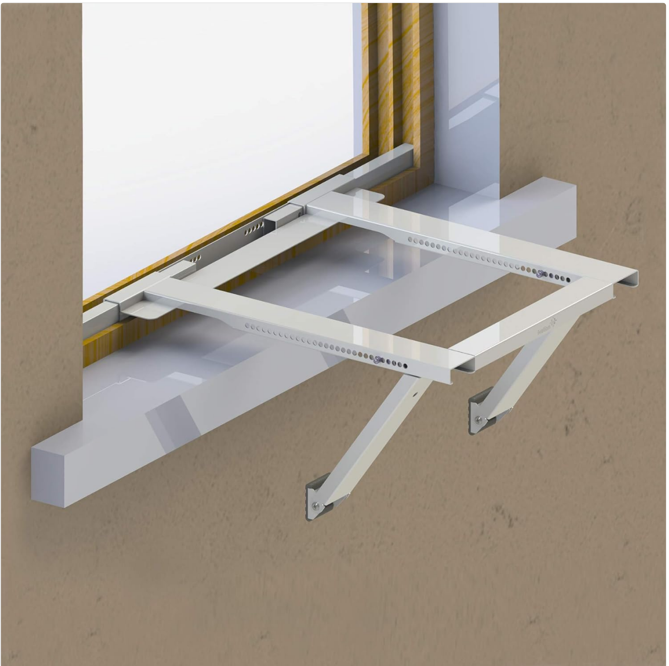
Figure 5: Diagram illustrating the bracket's placement within a window frame.