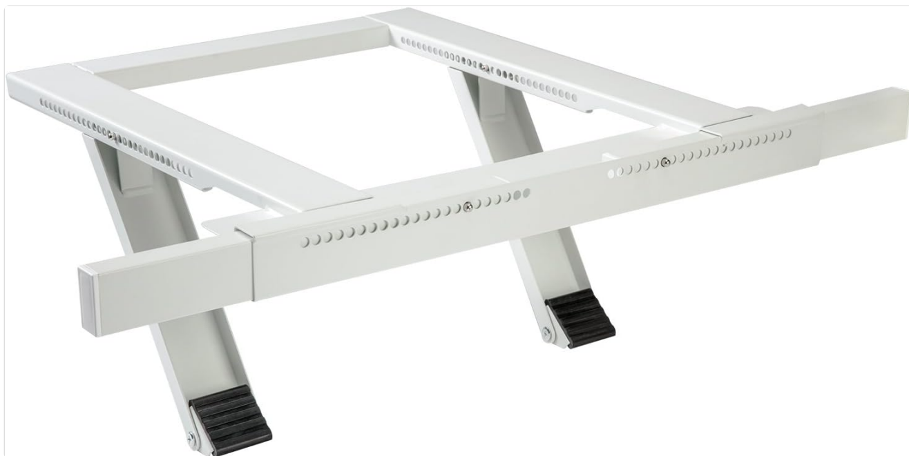
Figure 2: The Ivation Air Conditioner Support Bracket, ready for installation.