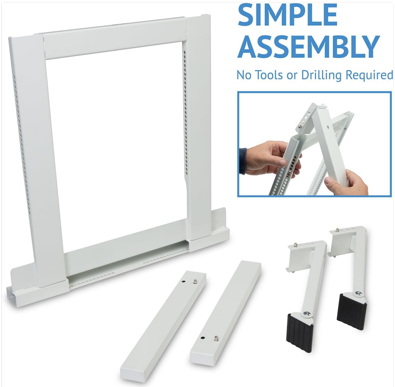
Figure 1: Main components of the Iv Ivation Air Conditioner Support Bracket.