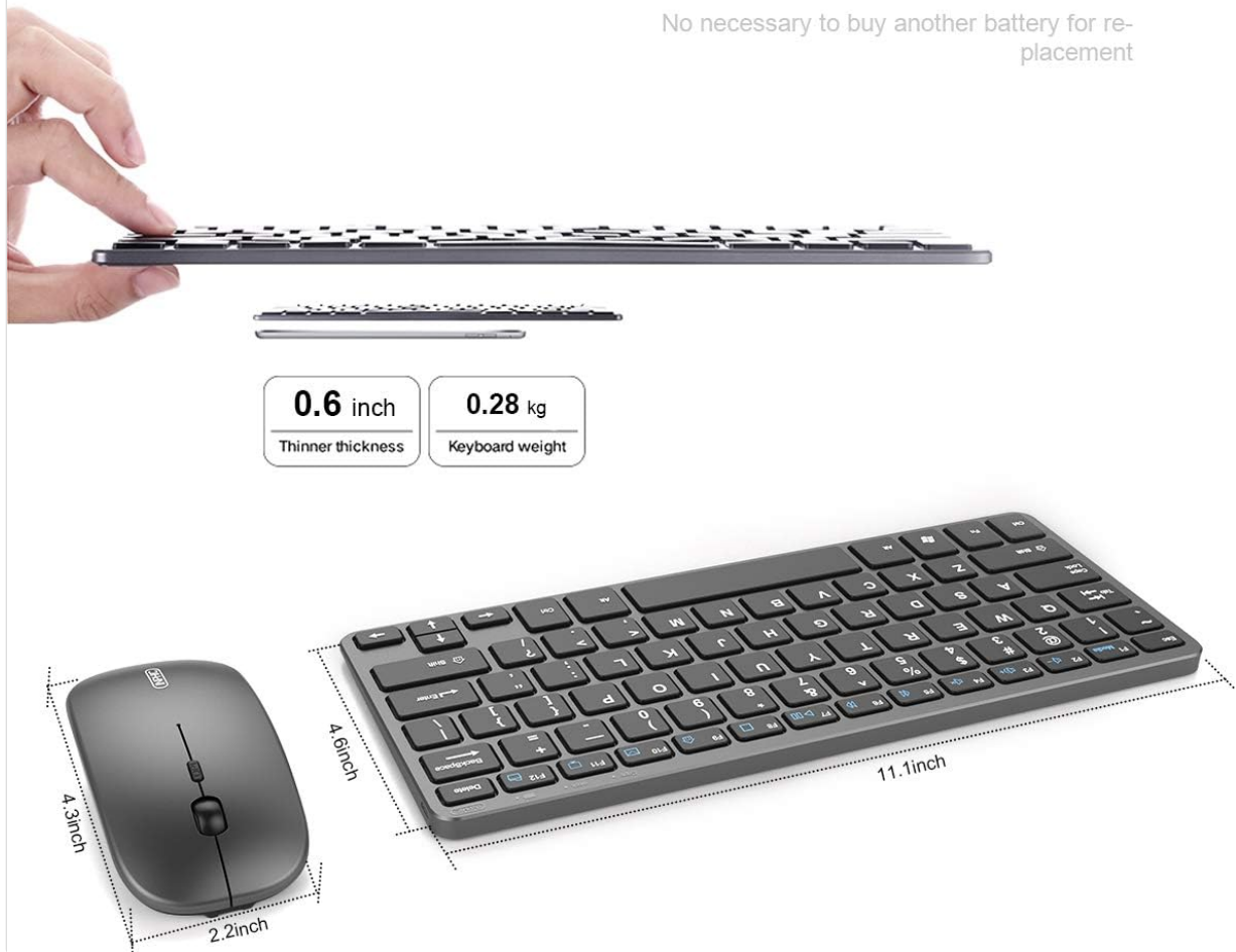
Figure 1: The INPHIC V780 combo highlighting its ultra-slim profile and lightweight design, with dimensions for both the keyboard and mouse.

No necessary to buy another battery for replacement