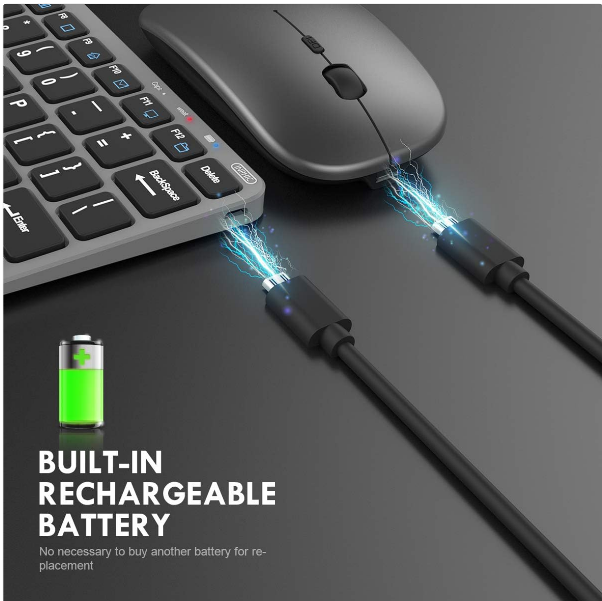
Figure 6: The keyboard and mouse connected via USB cables for recharging, indicating their built-in rechargeable batteries.