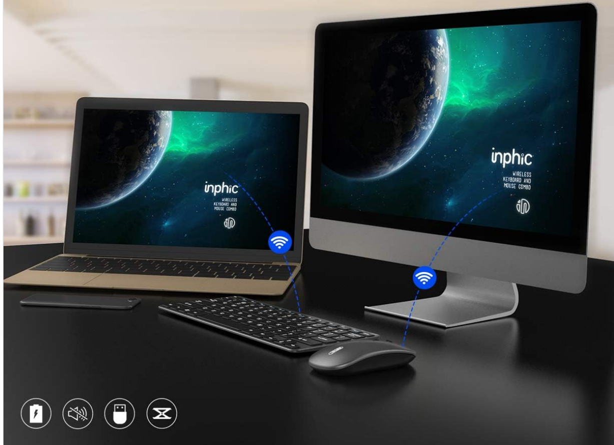
Figure 3: Demonstration of the 2.4G wireless receiver providing stable connectivity between the keyboard, mouse, and a computer setup.

Offers stable and flexible connectivity.