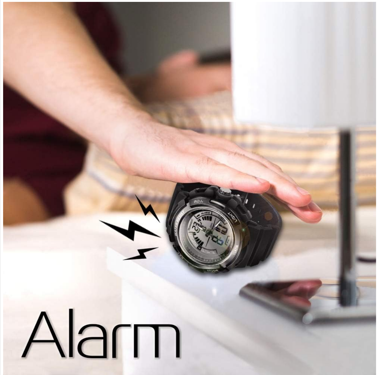
Image: The TEKMAGIC W17-Y watch placed on a bedside table, with a hand reaching to turn off the alarm, indicated by lightning bolt icons, demonstrating its alarm function.