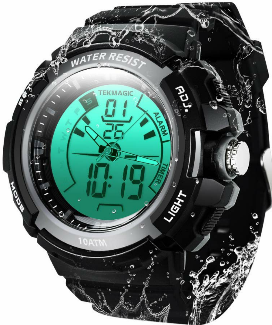
Image: The TEK MAGIC W17-Y watch partially submerged in water, with bubbles around it, and text indicating "100m Underwater Waterproof" and "Diving grade waterproof standard."

The TEK MAGIC W17-Y watch is rated for 10 ATM (100 meters / 330 feet) water resistance, suitable for swimming, snorkeling, and recreational diving. Important: Do not press any buttons while the watch is submerged in water. Pressing buttons underwater can compromise the water resistance seals and lead to water ingress. Ensure the crown is fully pushed in before any water exposure.