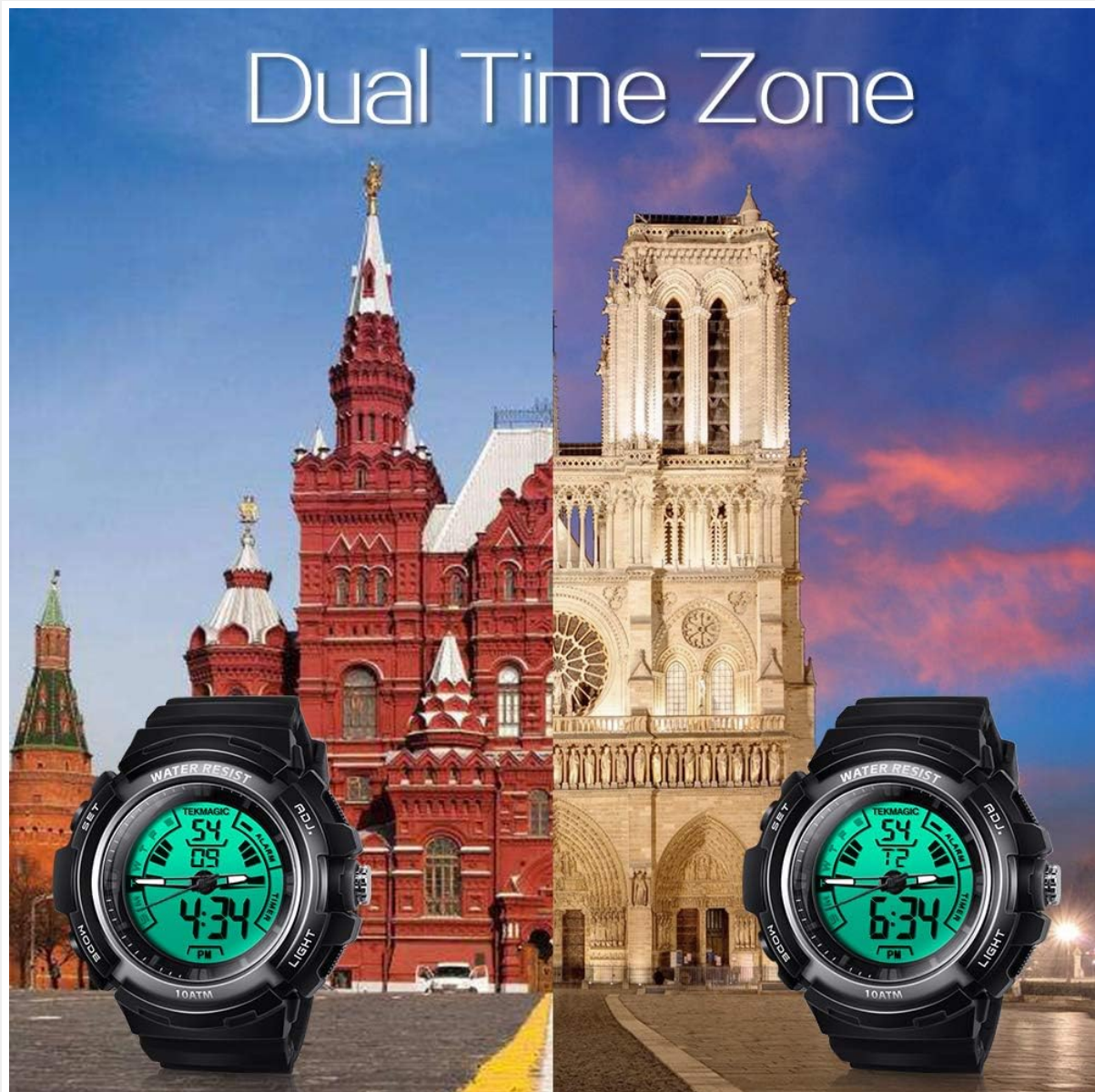
Image: Two TEK MAGIC W17-Y watches side-by-side, each displaying a different time, superimposed over images of famous landmarks (St. Basil's Cathedral and Notre Dame), illustrating the dual time zone feature.

Your watch can display a second time zone (T2). This is useful for travelers or those who need to keep track of time in another region.