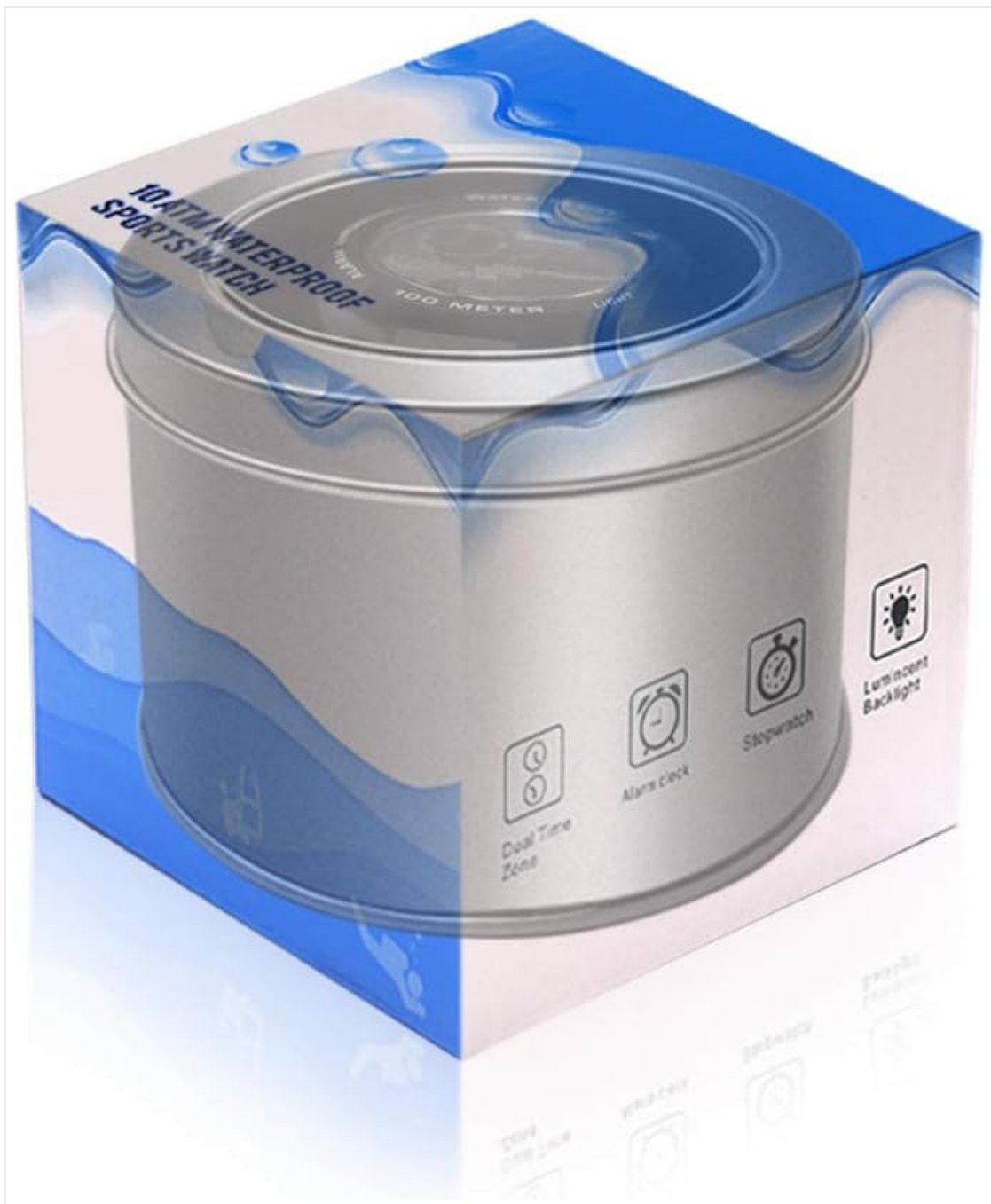
Image: The TEKMAGIC W17-Y watch packaging, a silver cylindrical tin inside a blue and white box, indicating features like Dual Time Zone, Alarm Clock, Stopwatch, and Luminous Backlight.