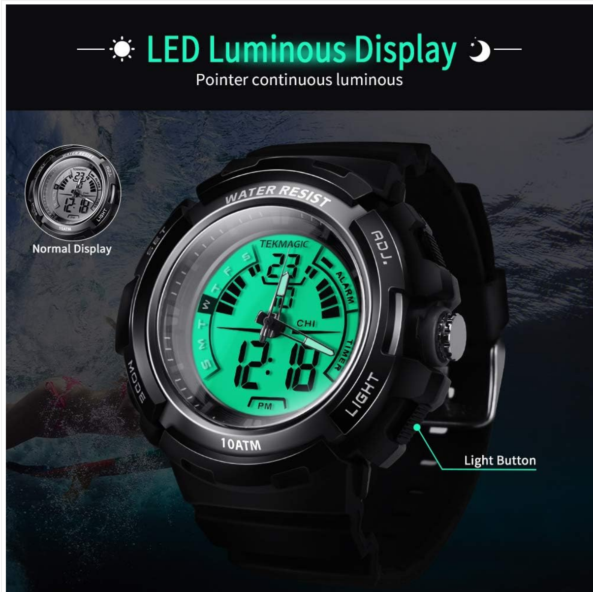
Image: The TEKMAGIC W17-Y watch showing its normal display and then an illuminated green LED luminous display, with an arrow pointing to the "LIGHT" button, demonstrating the backlight feature.

Press the LIGHT button (bottom right) to illuminate the digital display for a few seconds. This is useful in dark environments.