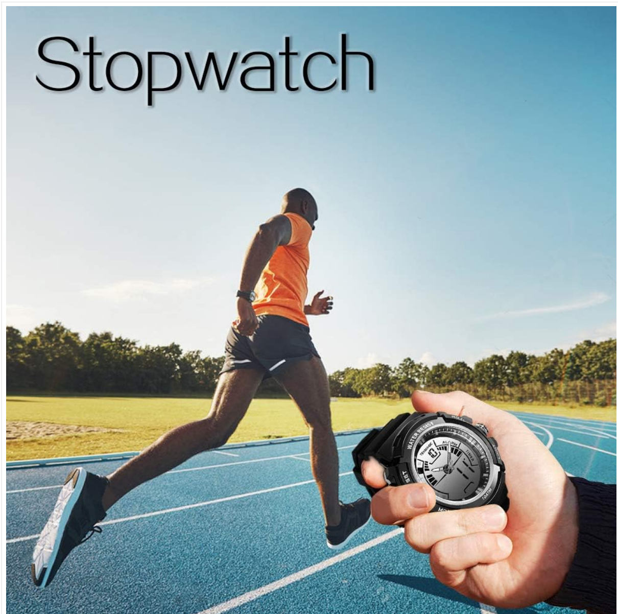
Image: A hand holding the TEKMAGIC W17-Y watch with the word "Stopwatch" overlaid, depicting a runner on a track in the background, illustrating the watch's stopwatch functionality.