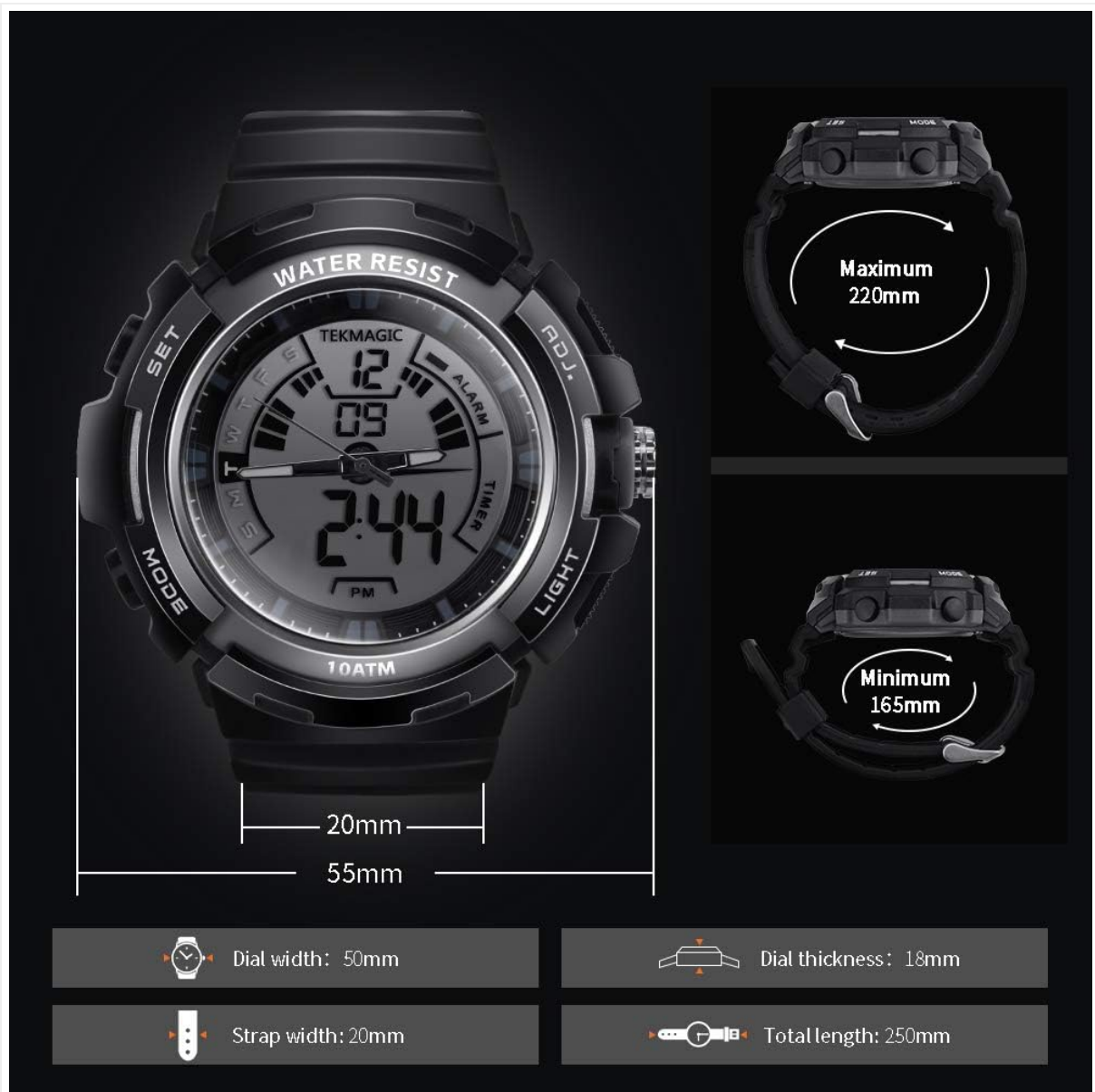
Image: The TEKMAGIC W17-Y watch with measurements indicating dial width (50mm), dial thickness (18mm), strap width (20mm), total length (250mm), maximum wrist circumference (220mm), and minimum wrist circumference (165mm).