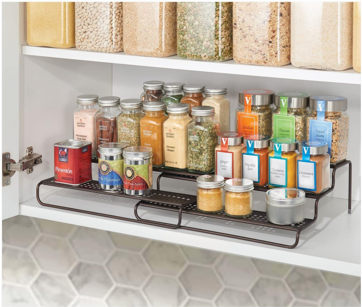
Image: The spice rack demonstrating its expandable feature.