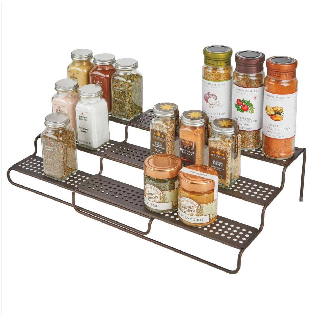
Image: Spice rack in use inside a kitchen cabinet.