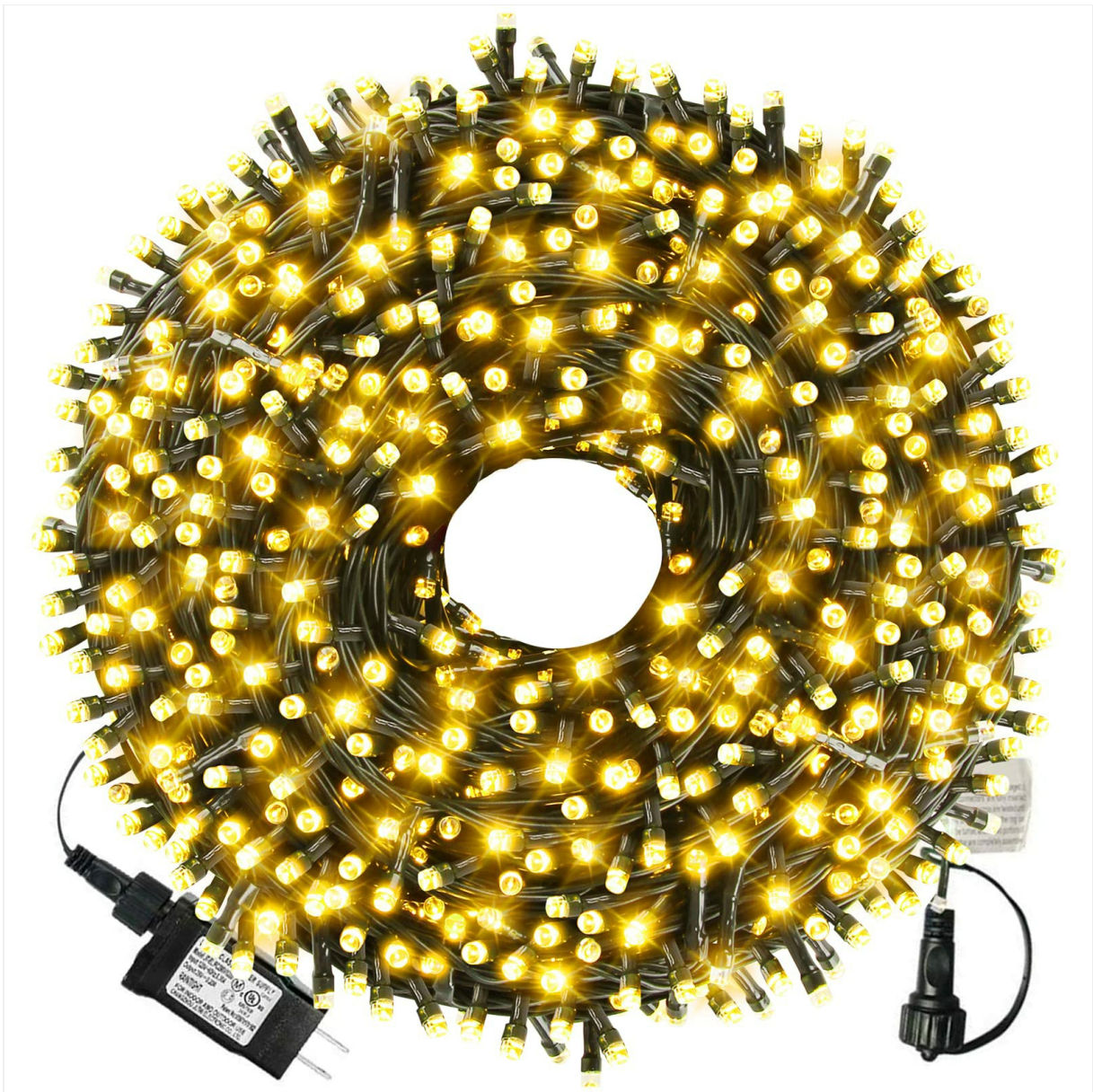
The XTF2015 105ft 300 LED Warm White String Lights, neatly coiled with its power adapter, ready for use.