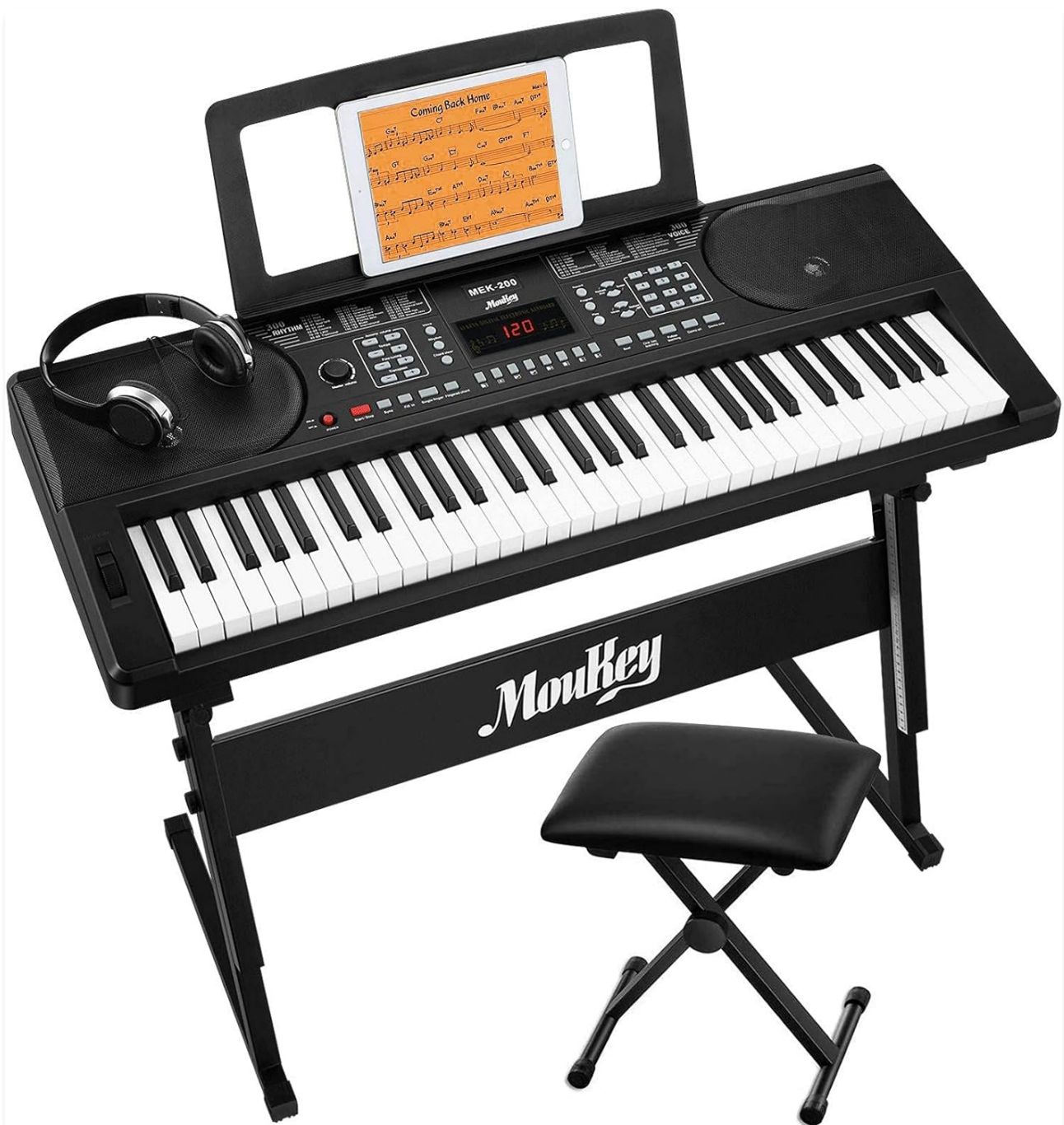
Figure 1.1: Complete Moukey MEK-200 Keyboard Kit setup.