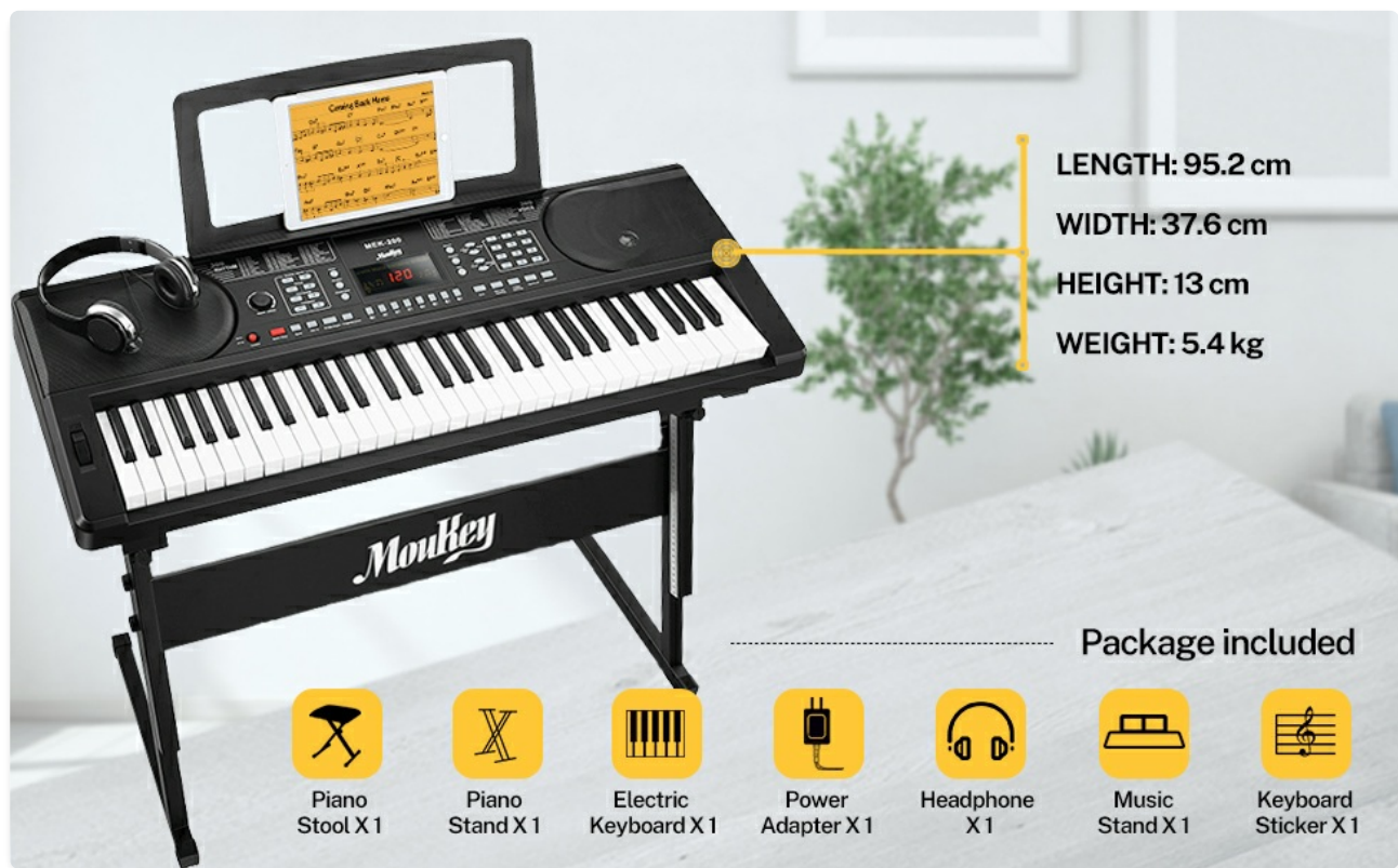
Figure 2.1: All components included in the Moukey MEK-200 package.