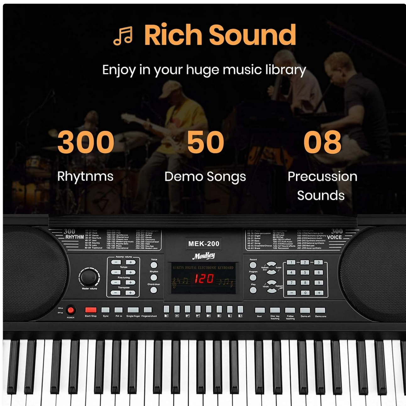
Figure 4.1: Control panel for voice and rhythm selection.