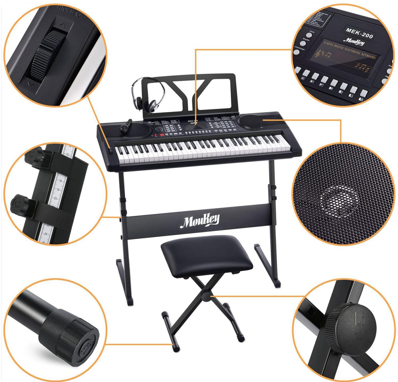
Figure 3.1: The Moukey MEK-200 fully assembled on its stand with the bench.