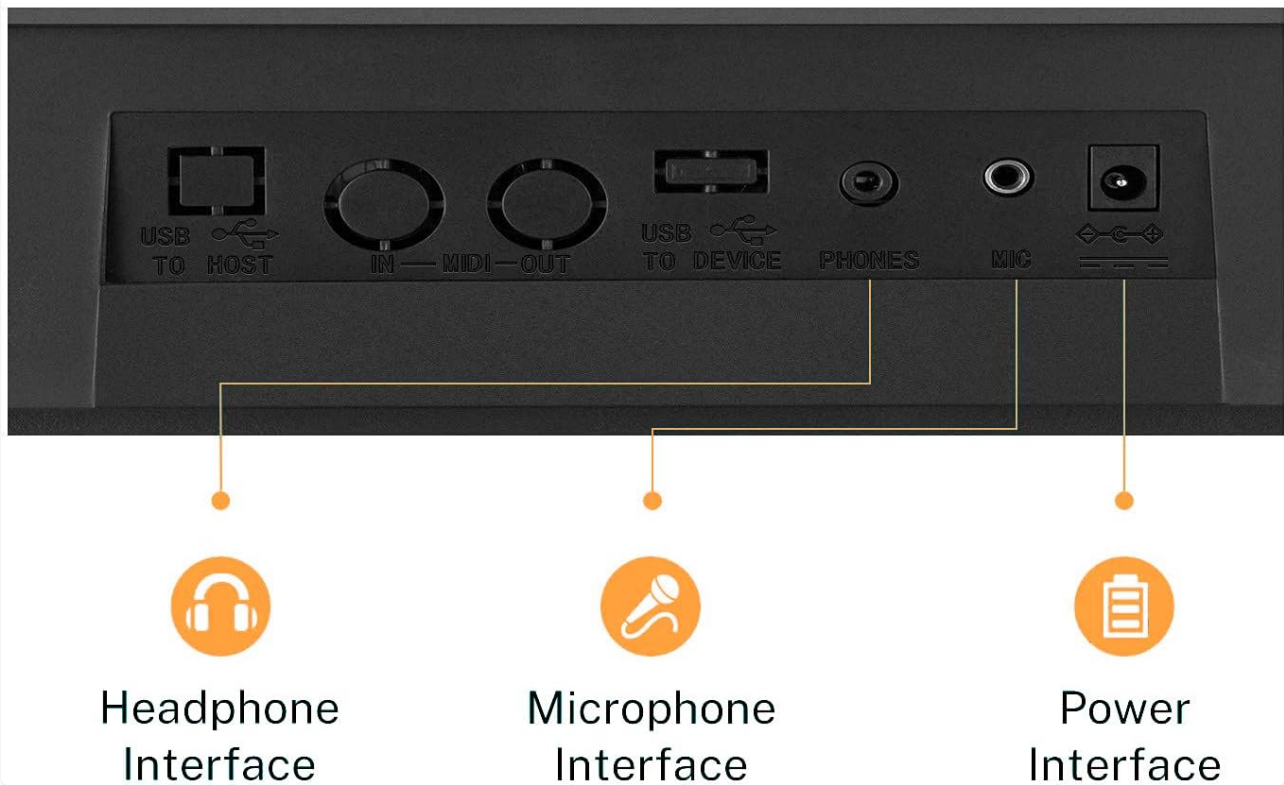
Figure 3.2: Connectivity ports on the Moukey MEK-200.