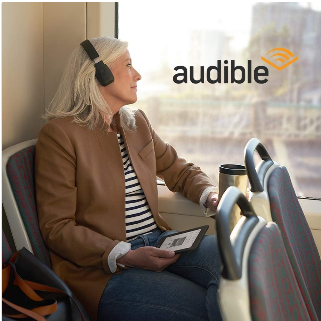
Image: A person on a train wearing headphones and holding a Kindle Paperwhite, demonstrating the use of Audible audiobooks.