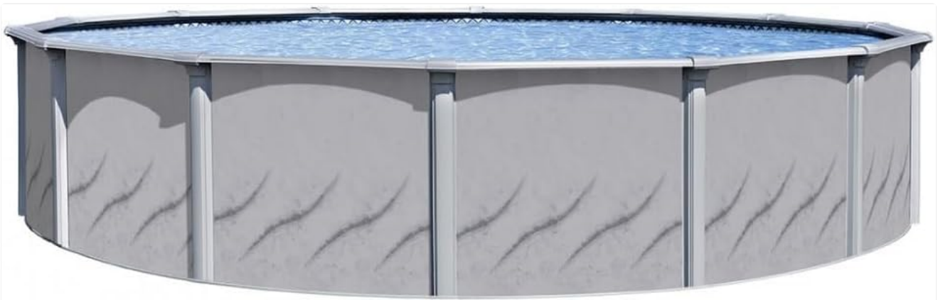
Image 1.1: The Wilbar Galeria 18-Foot Round Above-Ground Swimming Pool.

This manual provides essential instructions for the safe and correct installation, operation, and maintenance of your Wilbar Galeria 18-Foot Round Above-Ground Swimming Pool. Please read all instructions thoroughly before beginning assembly or use. Retain this manual for future reference.