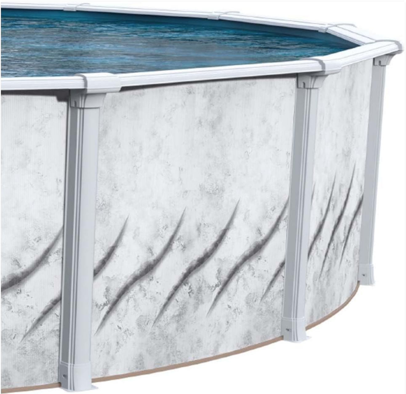
Image 5.1: Key dimensions and materials of the pool structure, including 52-inch wall height, 7-inch wide top ledge, and 5.5-inch wide uprights.