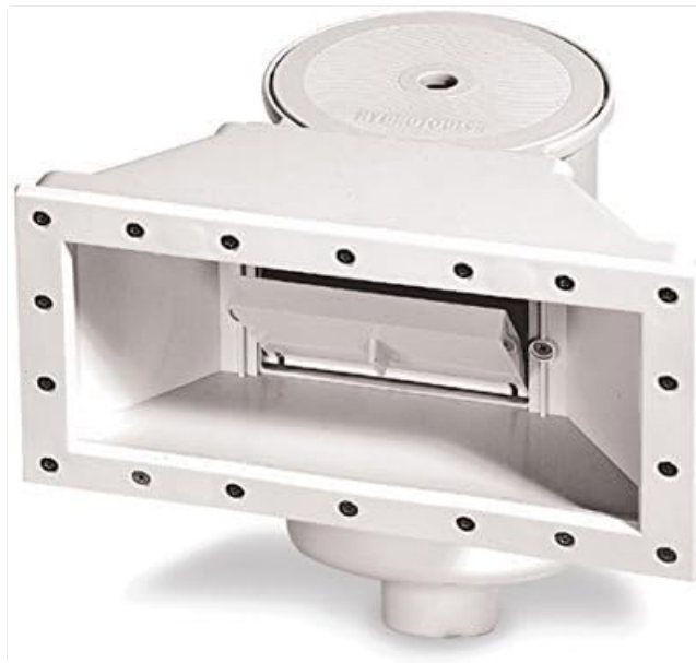
Image 5.4: The widemouth skimmer, designed for efficient debris removal.