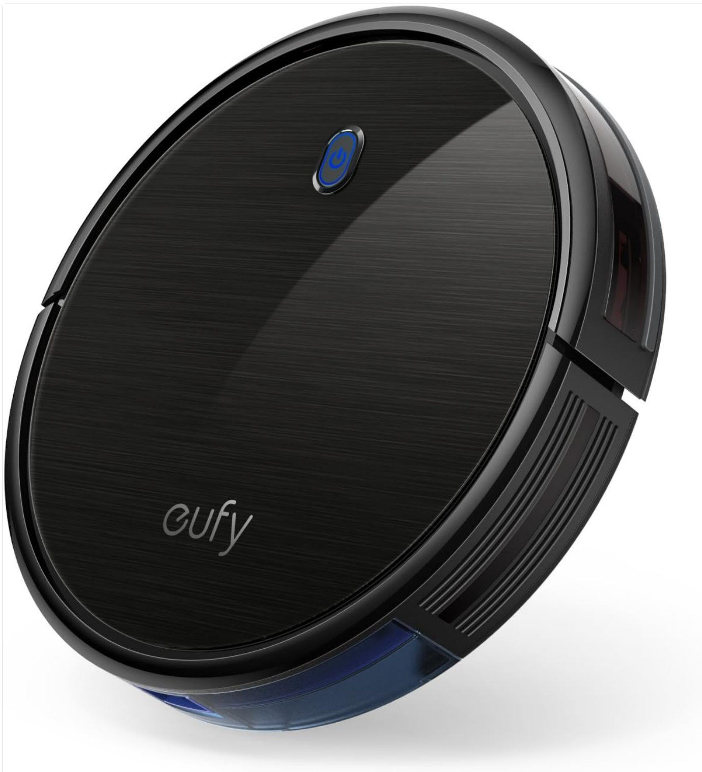
Image: An example of a compatible eufy RoboVac model.