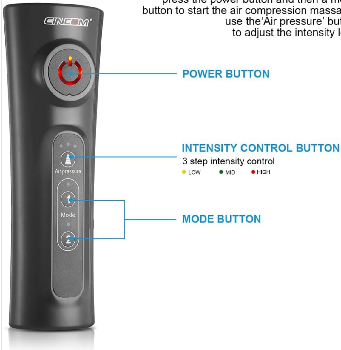
Image 4.1: Handheld controller with clearly marked Power, Intensity, and Mode buttons.

press the power button and then a mode button to start the air compression massager. use the 'Air pressure' button to adjust the intensity level.