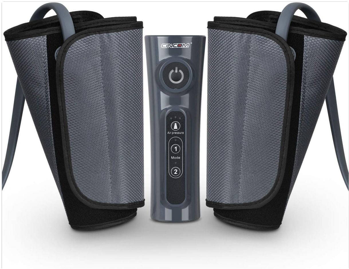
Image 1.1: The CINCOM Leg Massager CM-010A, showing the two leg wraps and the handheld controller.