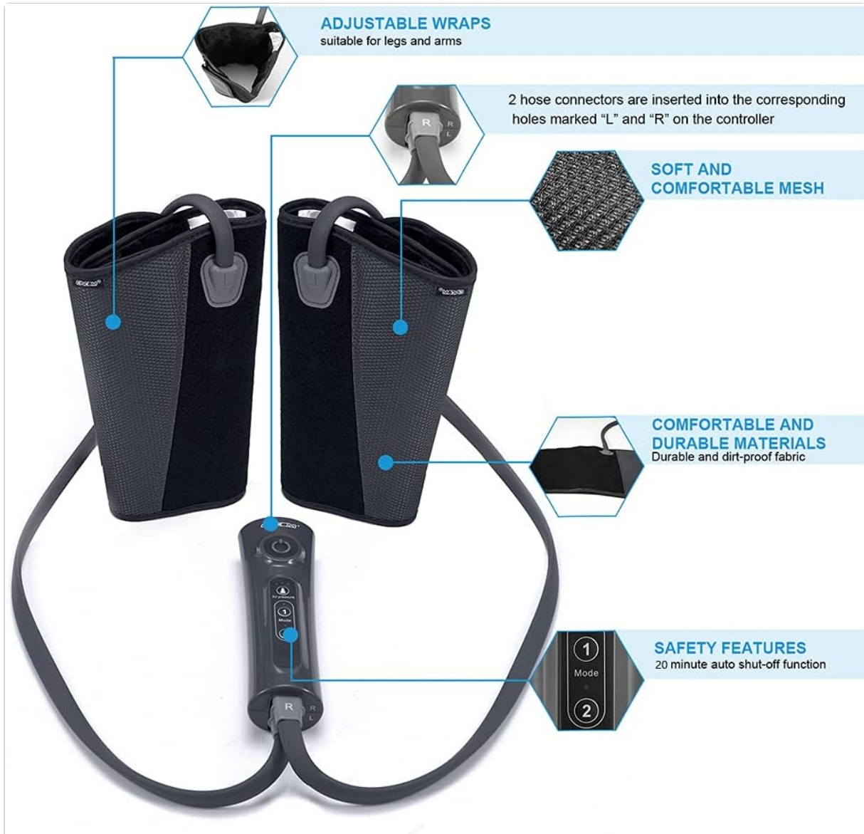
Image 2.1: Key features including adjustable wraps, comfortable materials, and the 20-minute auto shut-off safety function.