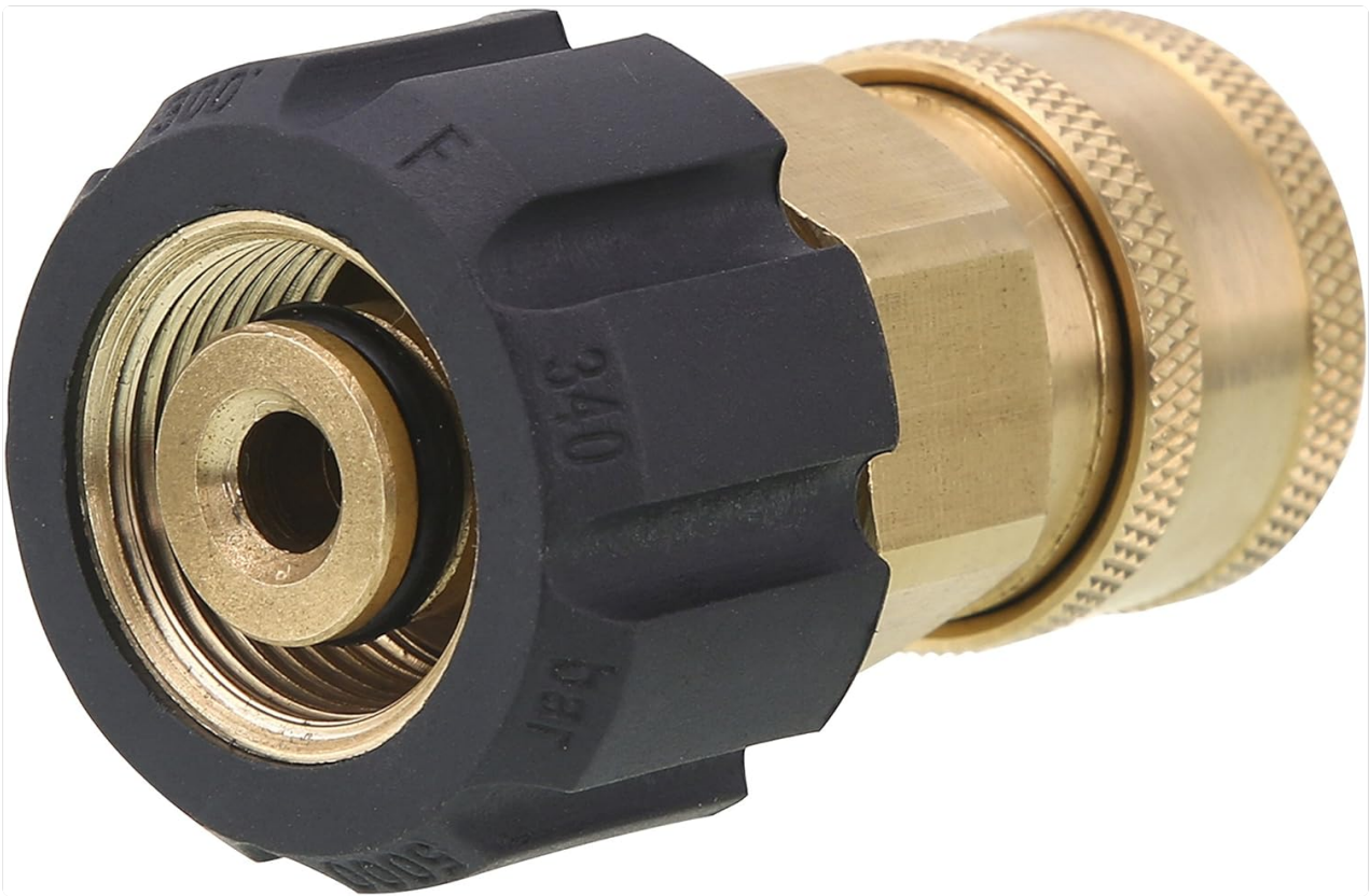
Image: The Tool Daily Quick Connect Socket, showing its brass construction and black swivel grip.