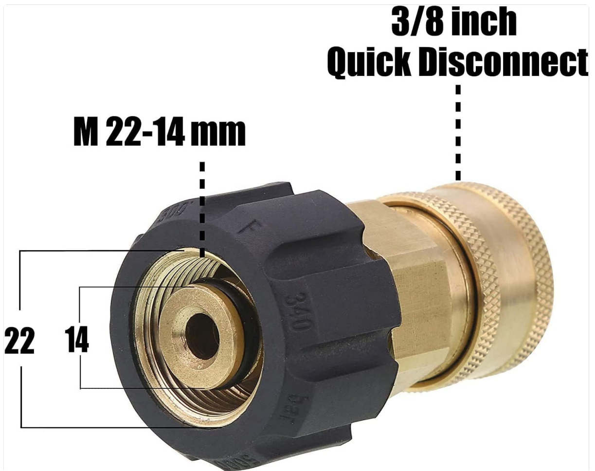
Image: The Quick Connect Socket with M22-14mm and 3/8 inch Quick Disconnect labels, illustrating its dimensions and connection types.