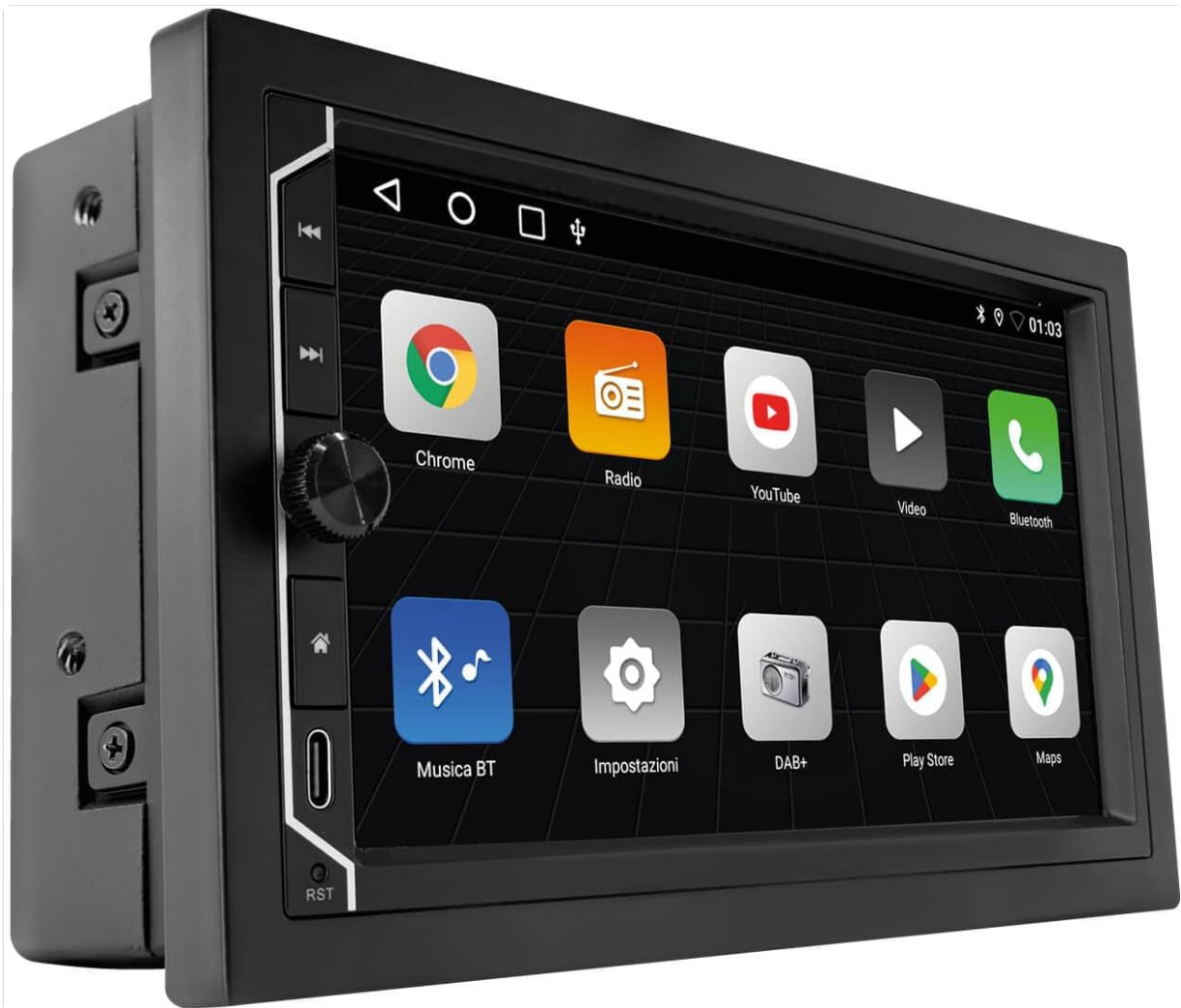
Image 1.1: Front view of the Phonocar VM003 Mediastation displaying its Android home screen with various application icons.