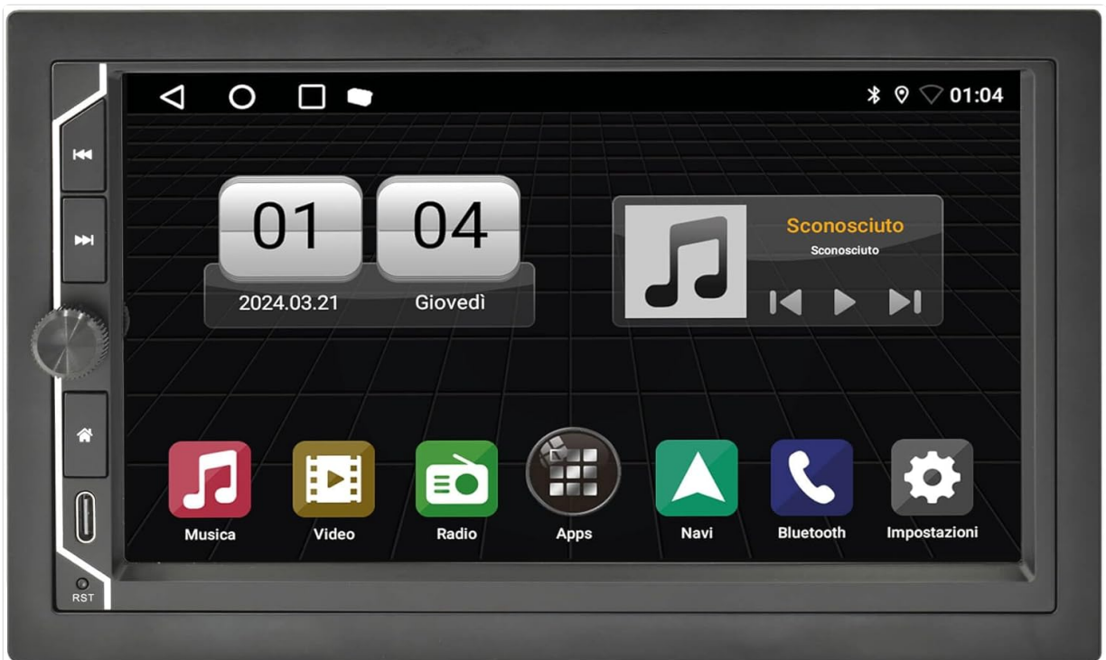
Image 1.2: Front view of the Phonocar VM003 Mediastation displaying the date, time, and a music player interface.