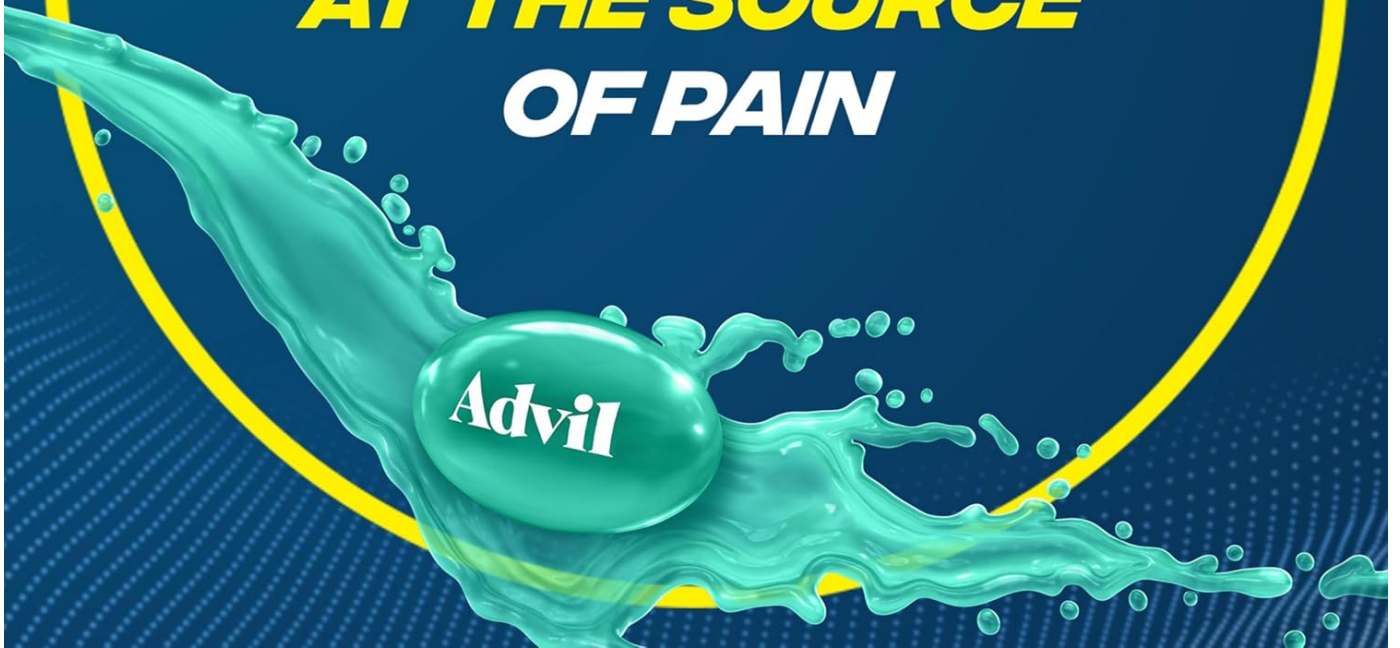
Image: A graphic showing the liquid gel capsule with a splash effect, emphasizing fast liquid relief at the source of pain.

GET FAST LIQUID RELIEF AT THE SOURCE OF PAIN