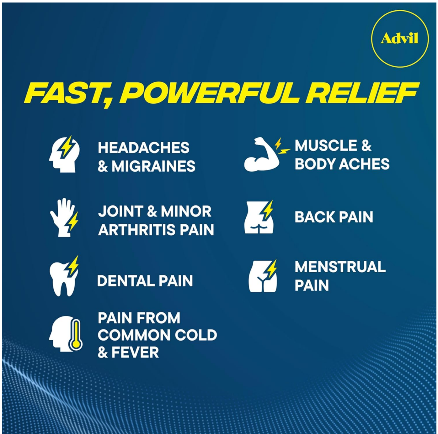
Image: Infographic detailing the types of pain Advil Liqui-Gels minis relieve, including headaches, muscle aches, joint pain, back pain, dental pain, menstrual pain, and pain from common cold & fever.