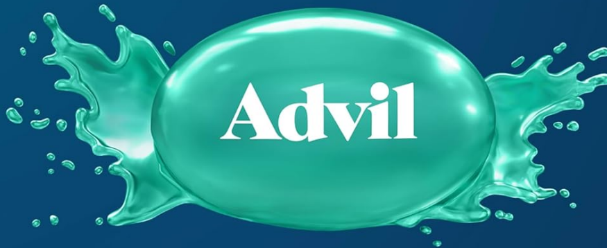
Image: A visual representation of the Advil Liqui-Gels mini capsule, highlighting its 33% smaller size compared to regular Advil Liqui-Gels while maintaining the same strength.

THE SAME STRENGTH OF ADVIL IN A 33% SMALLER CAPSULE