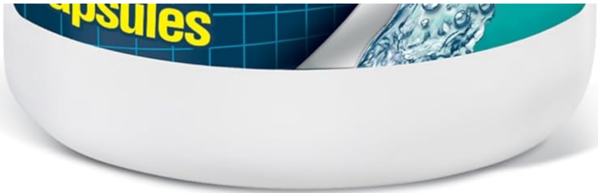
Image: Front view of the Advil Liqui-Gels minis bottle, highlighting the 200-count and 200mg ibuprofen dosage.