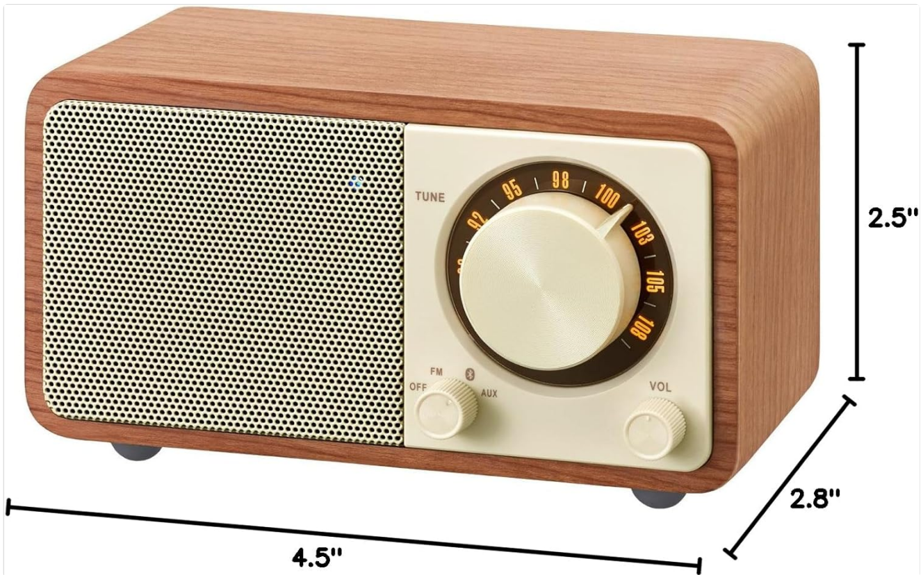
Image 8.1: Diagram showing the dimensions of the Sangean WR-7WL speaker.