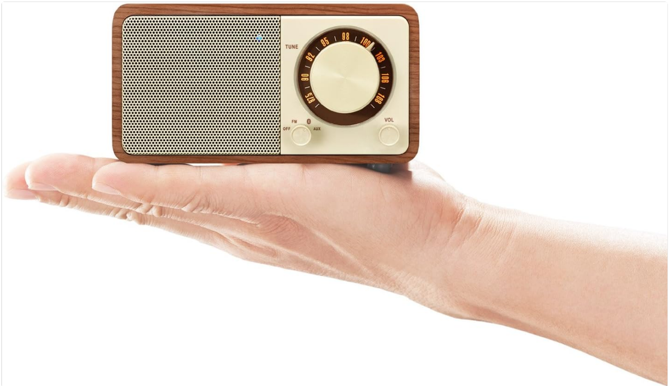
Image 1.2: The Sangean WR-7WL speaker held in a hand, illustrating its compact size.