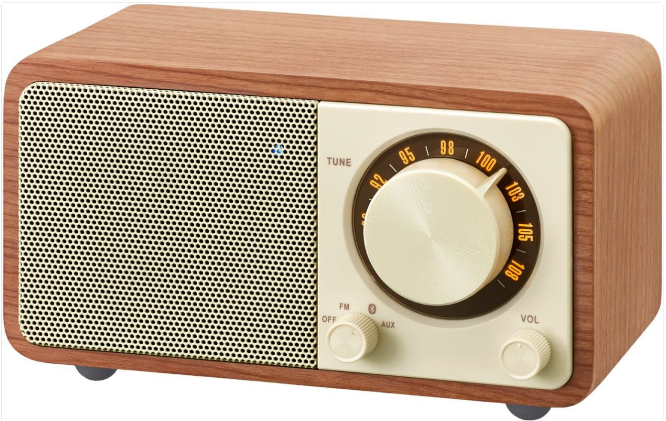
Image 3.1: Angled front view highlighting the tuning dial, mode selector, and volume knob.