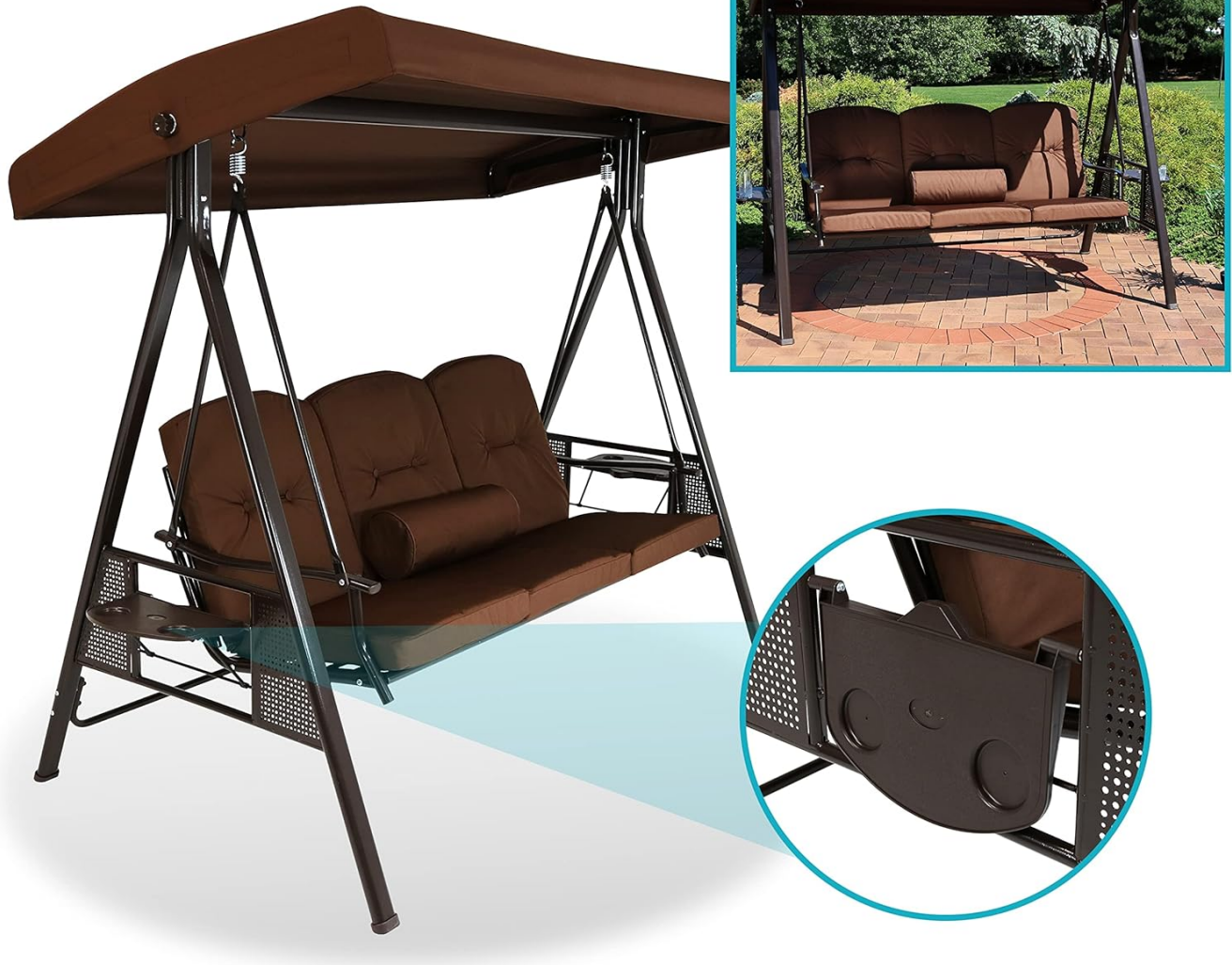
Image: A visual representation highlighting the adjustable tilt canopy, foldable side tables, and comfortable seating for three people.