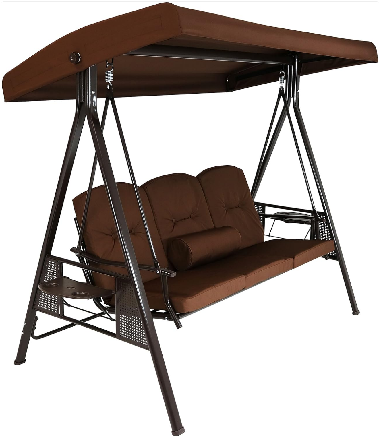
Image: The Sunnydaze 3-Person Steel Patio Swing Bench, showcasing its brown frame, canopy, and cushions, set in an outdoor patio environment.