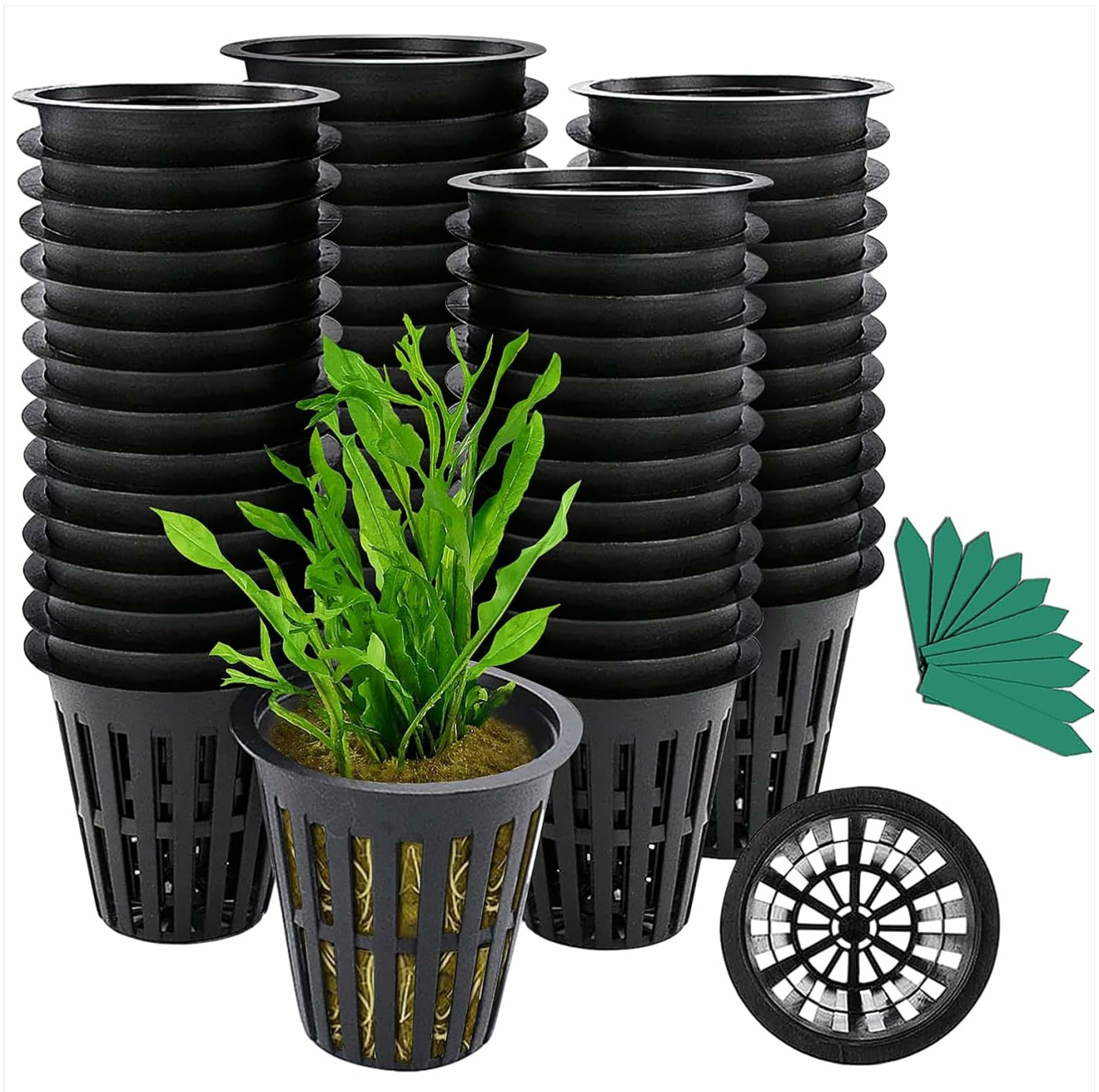
Image: A set of GROWNEER 2-inch black plastic net pots, showcasing their design and quantity.