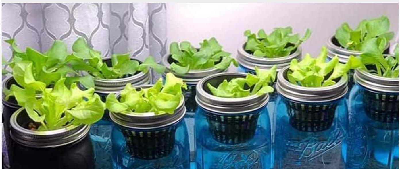
Image: Multiple 2-inch net pots with small plants, placed in wide-mouth jars, demonstrating a common setup.