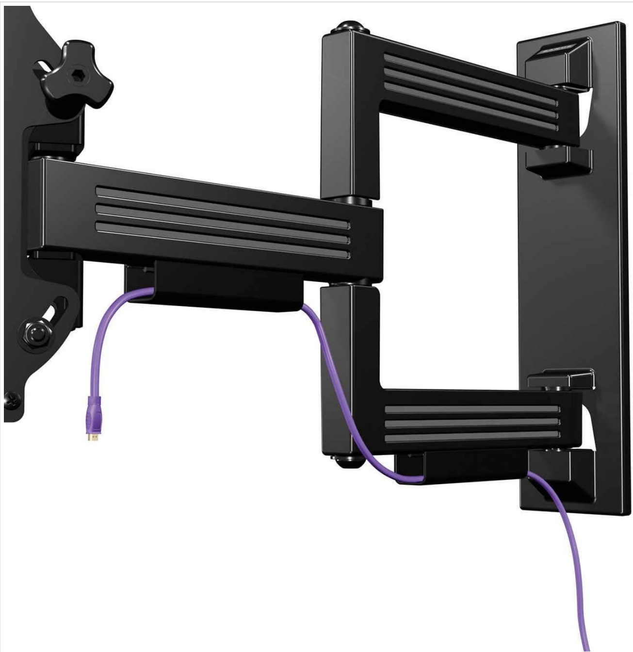
Image: The SANUS Simplicity Full Motion TV Mount is shown installed on a wall, extended, with a purple cable neatly routed through its integrated cable management channels.