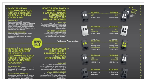
Figure 2: Image illustrating the TO.GO2A model with ARC encoding and 433.92 MHz frequency.