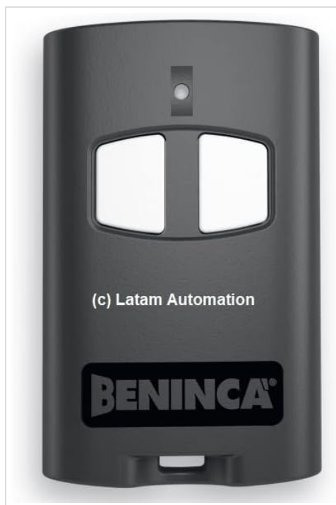
Figure 1: Front view of the BENINCA to.GO 2 A remote control, showing two white buttons and the BENINCA logo. Key features include: