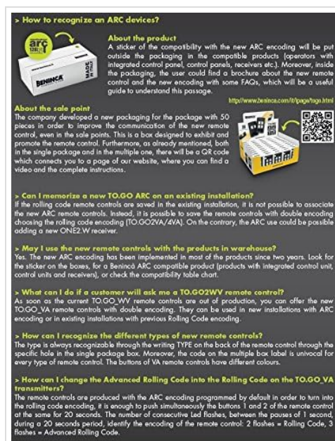
Figure 4: Information on how to recognize ARC devices and answers to frequently asked questions regarding ARC compatibility and programming.

The ARC 128-bit encoding provides enhanced security. If you are replacing an older remote or adding a new one to an existing installation, ensure your receiver is compatible with ARC encoding. Some older installations may require a specific procedure or a compatible receiver to utilize ARC remotes. For detailed information on ARC compatibility and programming, refer to the official BENINCA documentation or website. The image below provides some general guidance on ARC devices and frequently asked questions.