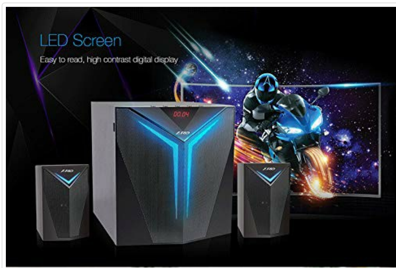
Image 3.1: The subwoofer's front panel displaying the digital LED screen.

The subwoofer houses the primary controls and connections. It features a high-contrast digital LED display for easy readability and a rust-proof metal grill for durability and protection of the internal components.