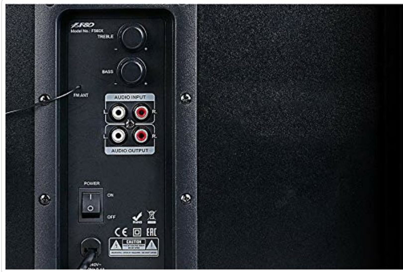
Image 8.1: Diagram illustrating key specifications and connectivity options.