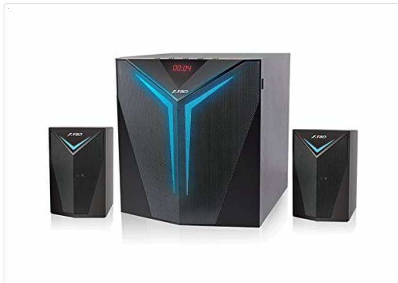
Image 1.1: The FD F560X 2.1 Multimedia Speaker System, consisting of one subwoofer and two satellite speakers.

This manual provides detailed instructions for the setup, operation, and maintenance of your FD F560X 56W 2.1 Bluetooth Multimedia Speaker system. Please read this manual thoroughly before using the product to ensure proper functionality and to maximize your listening experience. The FD F560X system delivers powerful bass and clear sound, featuring Bluetooth connectivity and a fully remote-controlled interface.