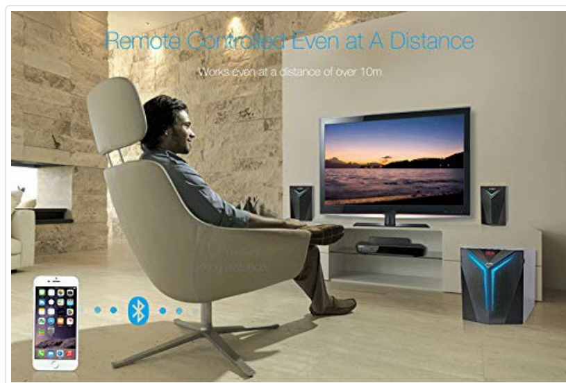
Image 5.2: The remote control allows for convenient operation from a distance.