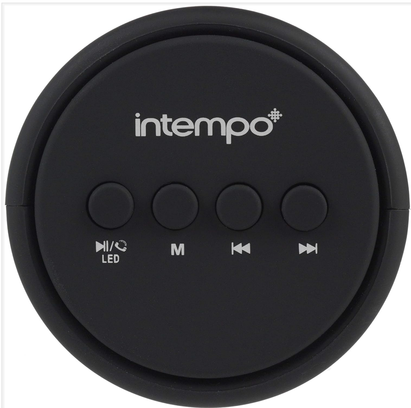
Figure 2: Top control panel with Play/Pause/LED, Mode, Previous, and Next buttons.