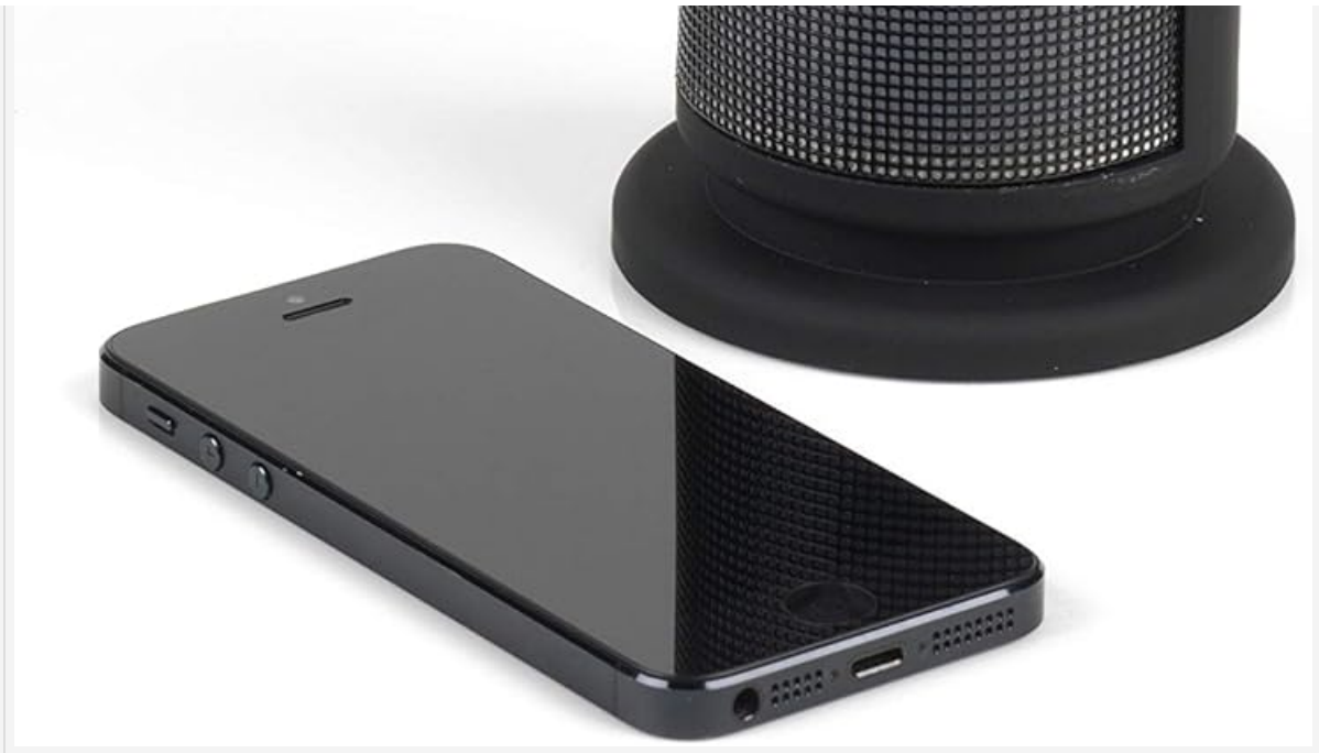
Figure 3: Speaker shown with a smartphone, demonstrating connectivity options.