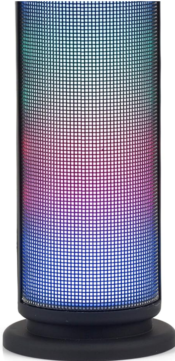
Figure 1: Front view of the INTEMPO LED Light Tower Speaker with its vibrant LED lights active.