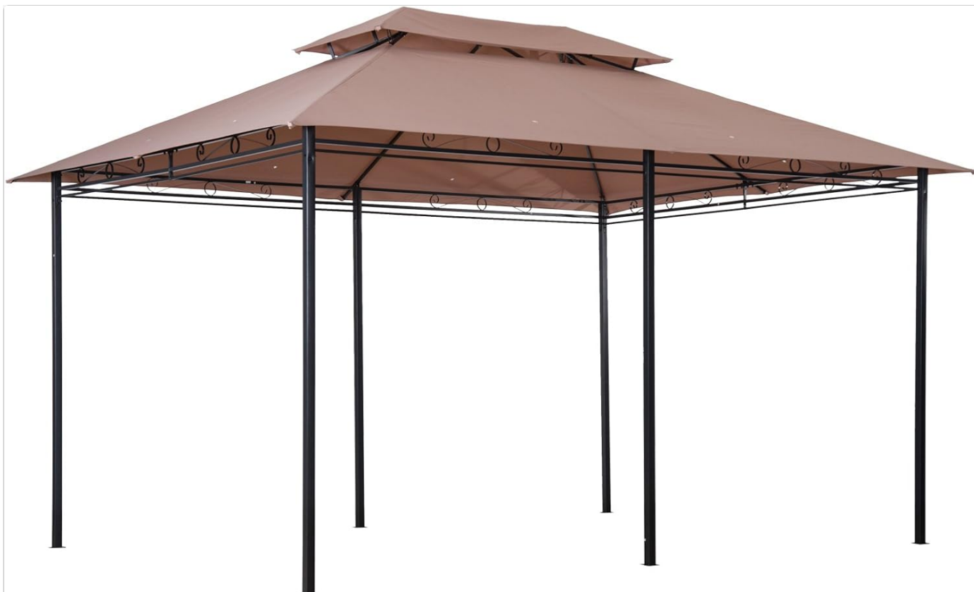
Figure 2.1: The robust powder-coated steel frame provides the primary structure for the gazebo.