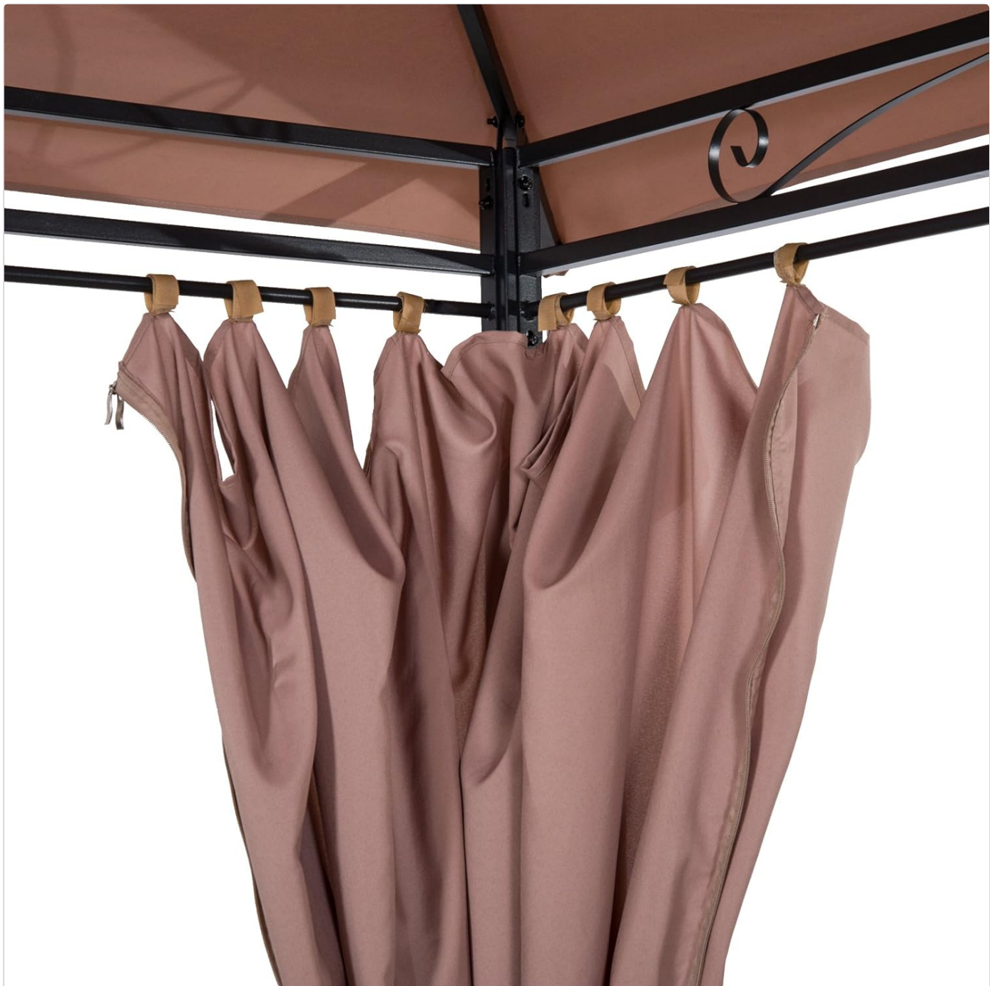
Figure 2.4: Curtains are easily attached to the frame using integrated rings and straps.