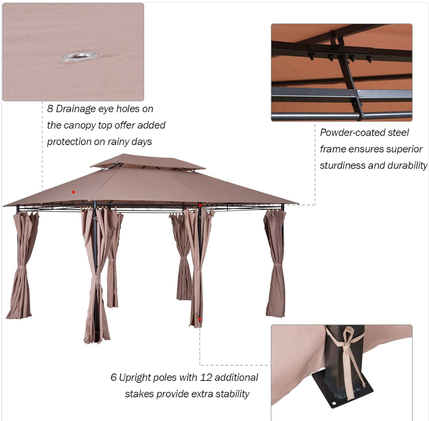
Figure 2.5: Key stability features include the powder-coated steel frame, 6 upright poles, and 12 additional stakes for ground anchoring.