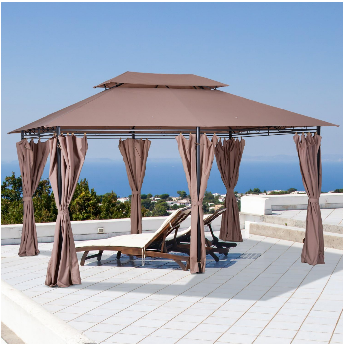
Figure 3.1: The gazebo provides a spacious outdoor gathering area, adaptable with its adjustable curtains.