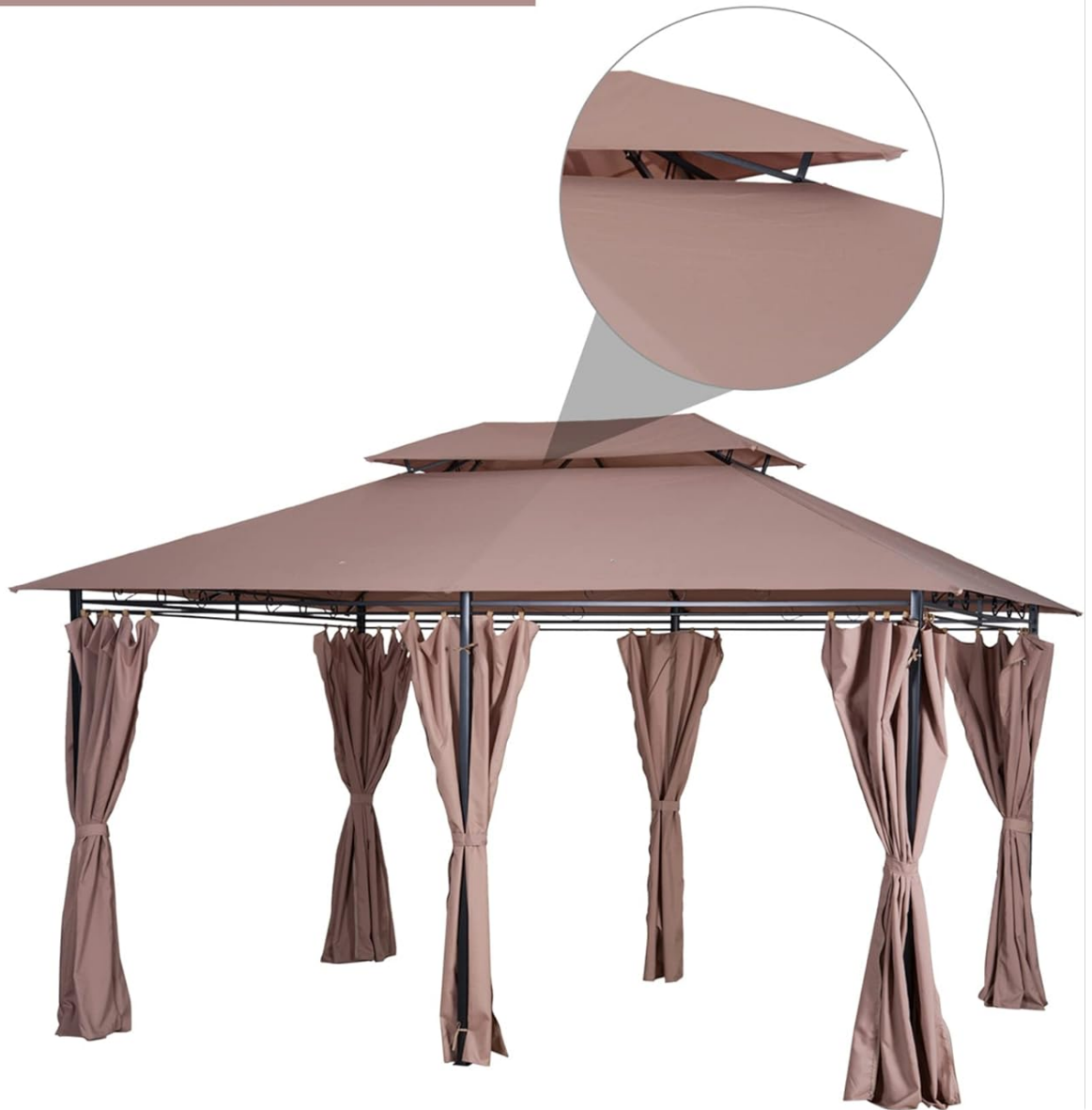
Figure 2.2: Detail of the 2-tier canopy top, designed for improved ventilation and weather resistance.