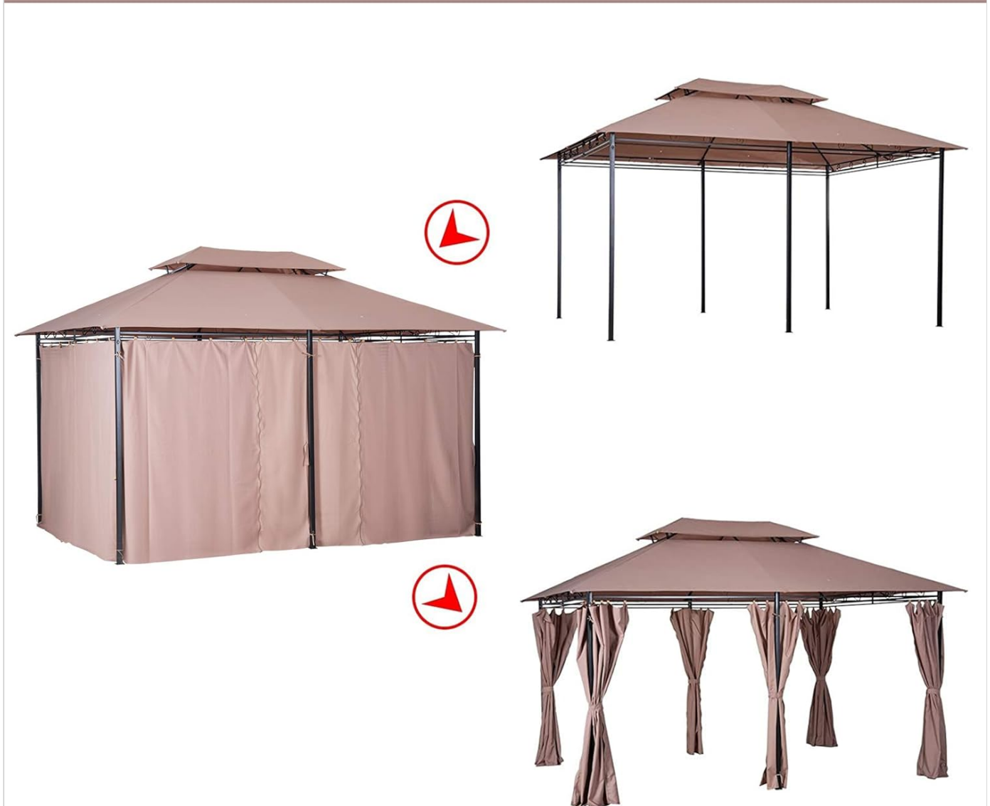
Figure 2.3: The zippered curtains offer flexibility to create either a private or airy environment.

Detachable zippered curtains adjust for private space or airy environment