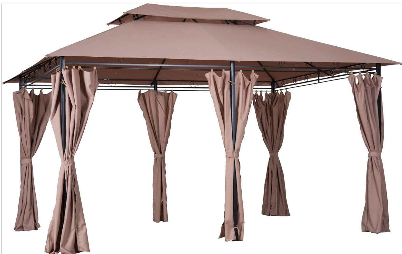
Figure 1.1: The Outsunny 10' x 13' Patio Gazebo in Khaki, featuring its two-tier canopy and privacy curtains.