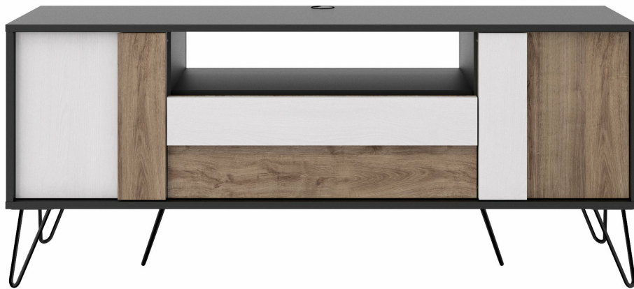
Image 1.1: Front view of the Tvilum Glasgow TV Stand, showcasing its overall design and dimensions.