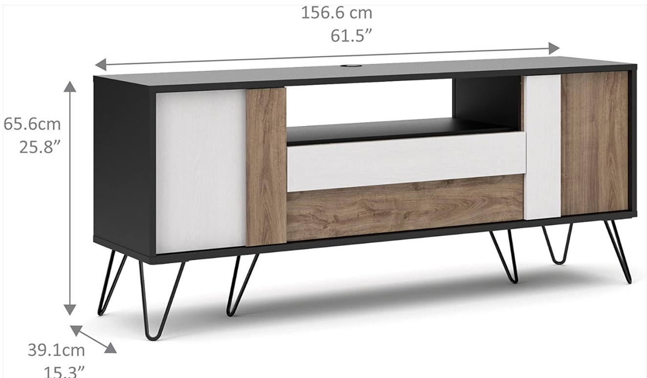
Image 3.2: Dimensional drawing of the TV stand, useful for planning placement.