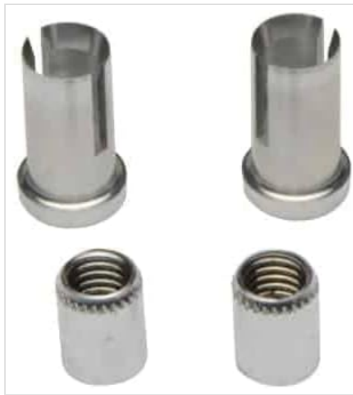
Figure 1: Components of the Barkbusters B-025 Bar End Mounting Kit. The image displays two silver-colored, cylindrical alloy inserts with slotted ends, and two smaller, silver-colored threaded inserts designed to fit within them.