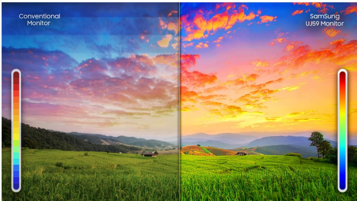
Image: Visual comparison of color depth on a conventional monitor versus the Samsung UJ59 monitor.