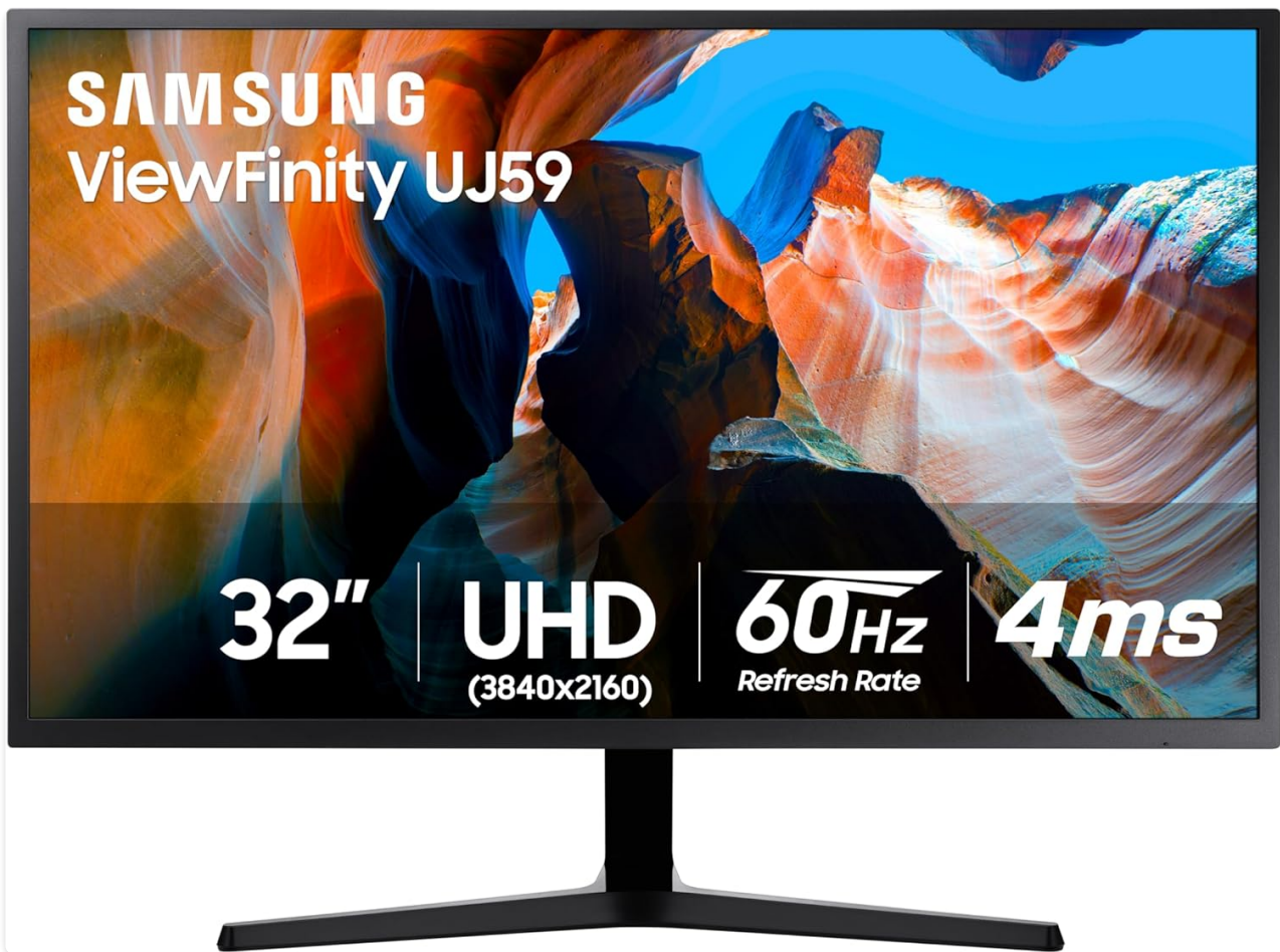
Image: Front view of the Samsung 32-inch UJ59 Series 4K UHD Monitor.