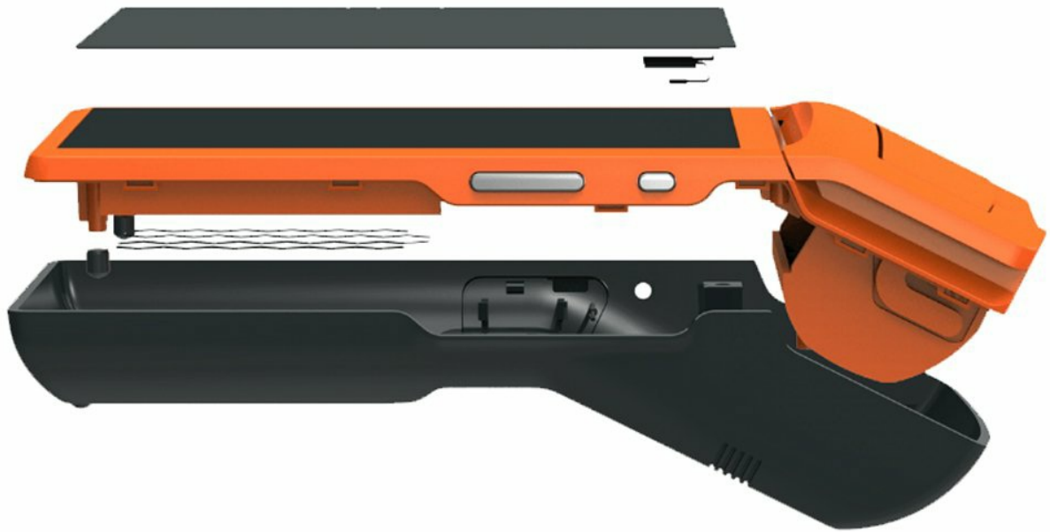
Figure 2.3: Exploded view illustrating the internal structure of the Sunmi V1, including the screen, main board, battery compartment, and thermal printer mechanism.