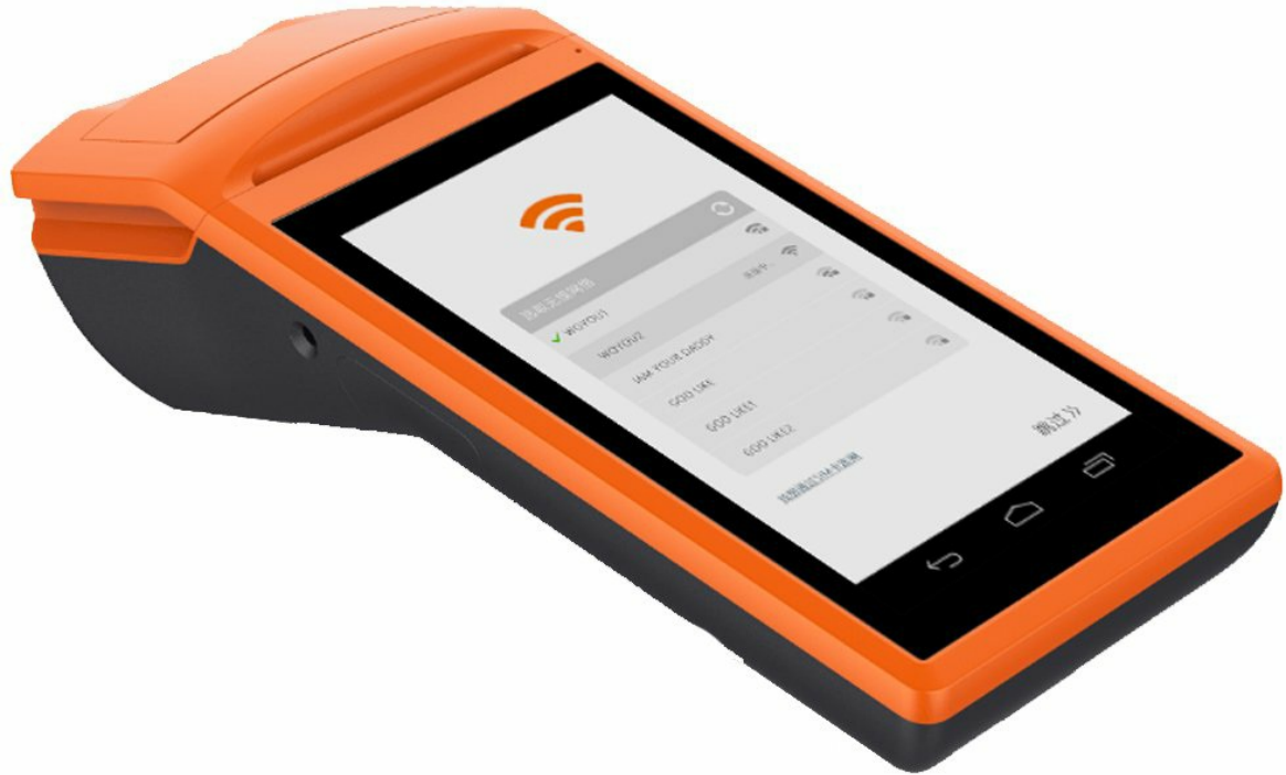
Figure 4.1: The Sunmi V1 screen displaying available Wi-Fi networks, with one network successfully connected.