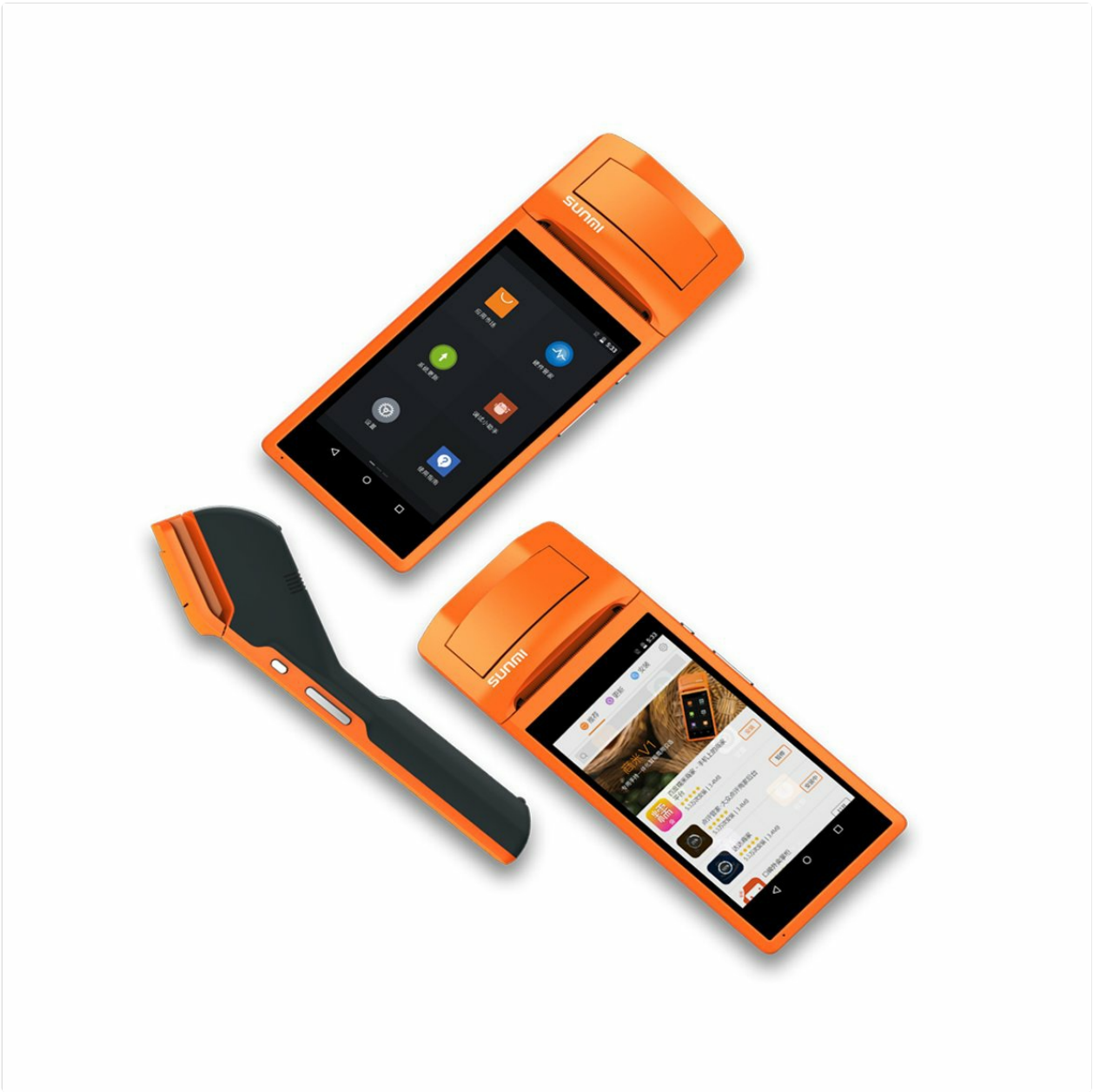
Figure 2.1: Angled view of the Sunmi V1 Handheld POS Terminal, showcasing its orange and black design.