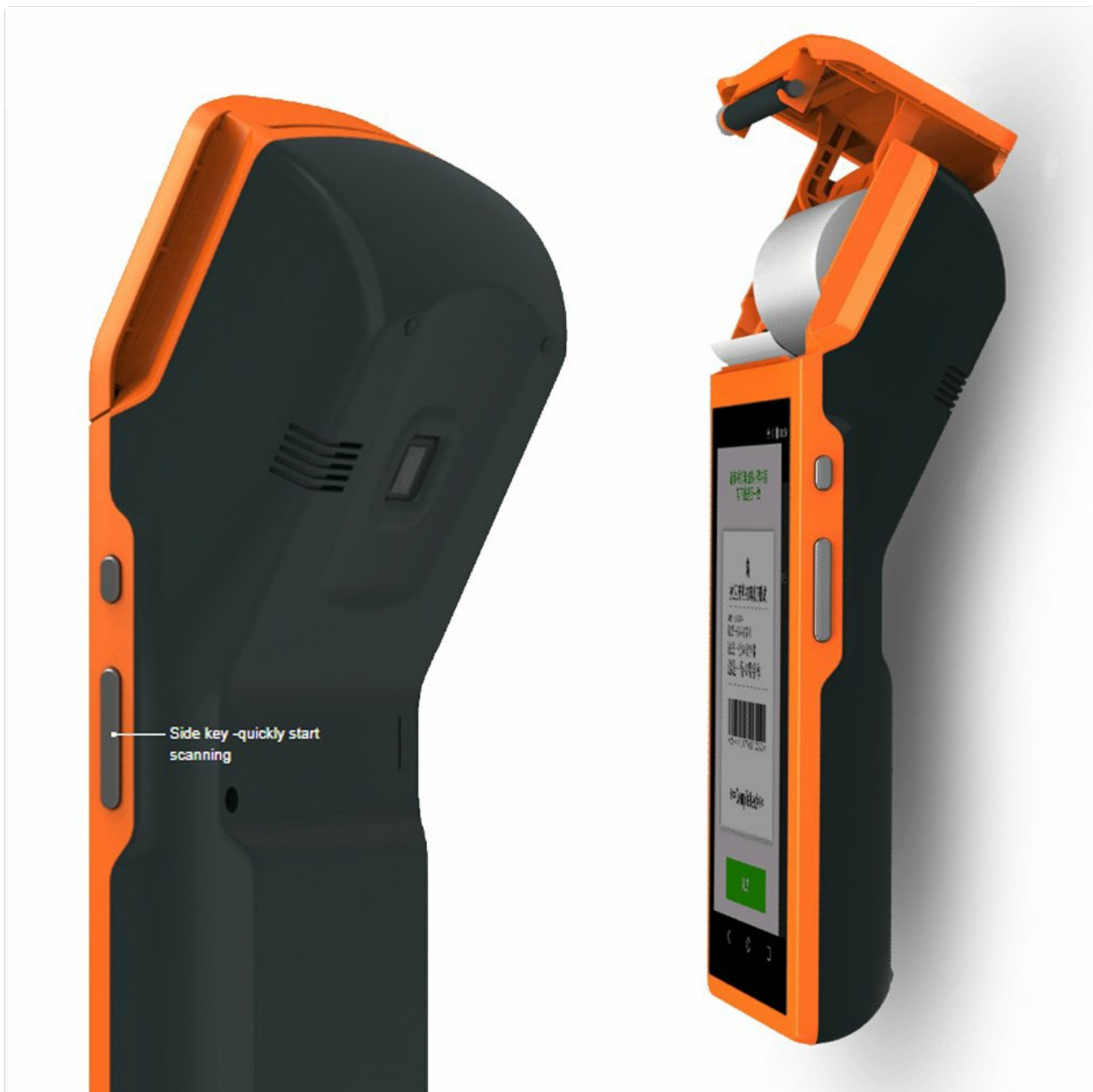
Figure 2.5: Side view of the Sunmi V1, indicating the side key for quick scanning and the open printer compartment with a thermal paper roll inserted.