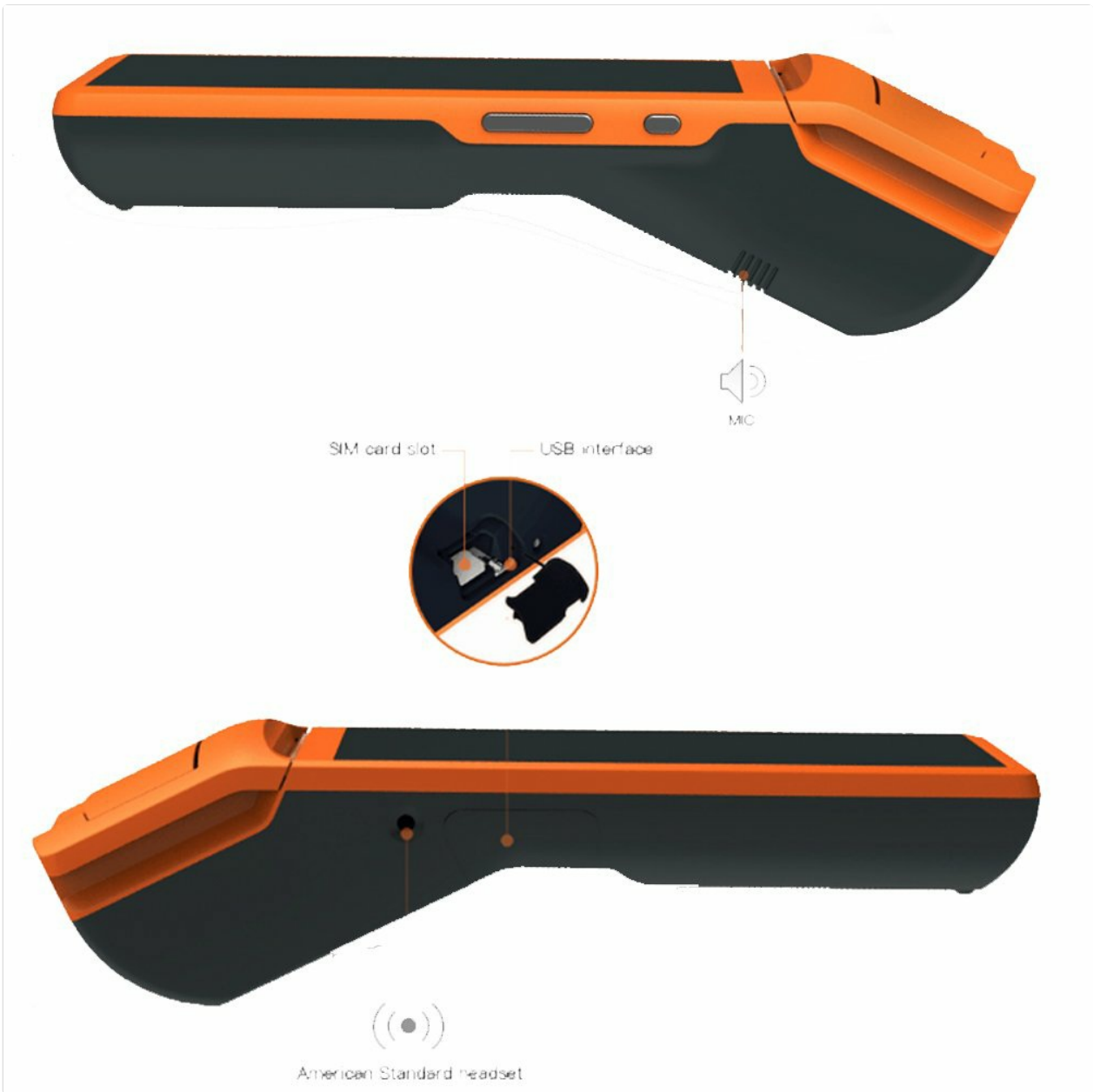
Figure 2.4: Side view of the Sunmi V1, highlighting the SIM card slot, USB interface, microphone, and American Standard headset jack.