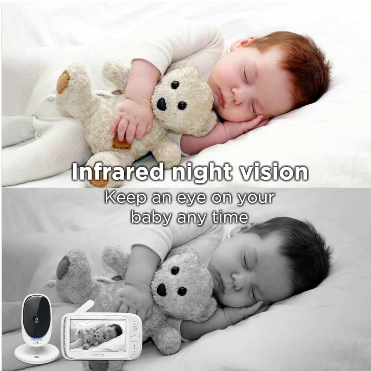
Image: A split image showing a baby sleeping, one side in color (day vision) and the other in black and white (infrared night vision), with the camera and parent unit.