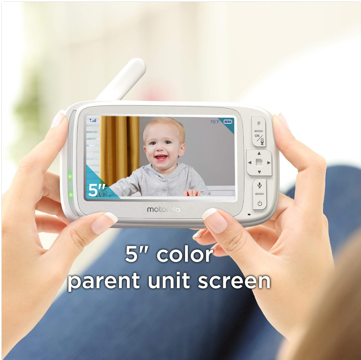
Image: The 5-inch color parent unit screen held in hands, displaying a baby.

The parent unit features a 5-inch full-color LCD screen for clear viewing of your baby. It includes controls for digital zoom, two-way audio, and menu navigation.