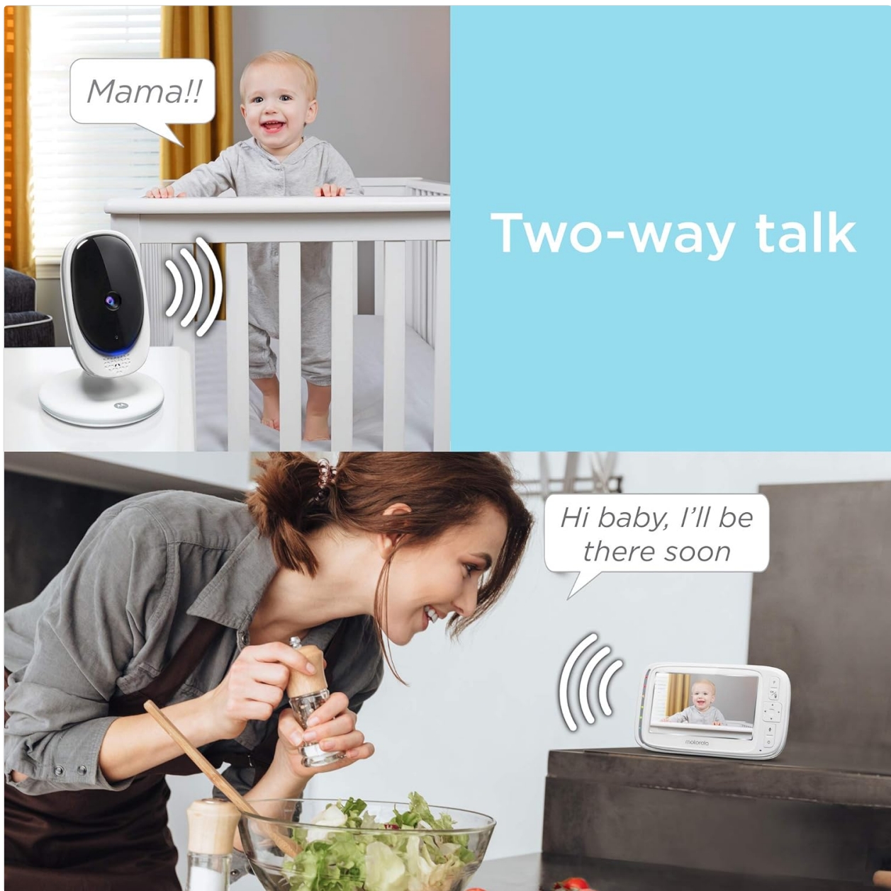
Image: A baby in a crib with a camera, and a parent speaking into the parent unit, illustrating two-way talk.