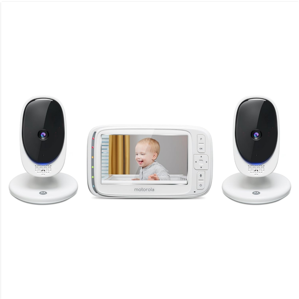
Image: Two baby units (cameras) flanking the parent unit, showing a baby on its screen.