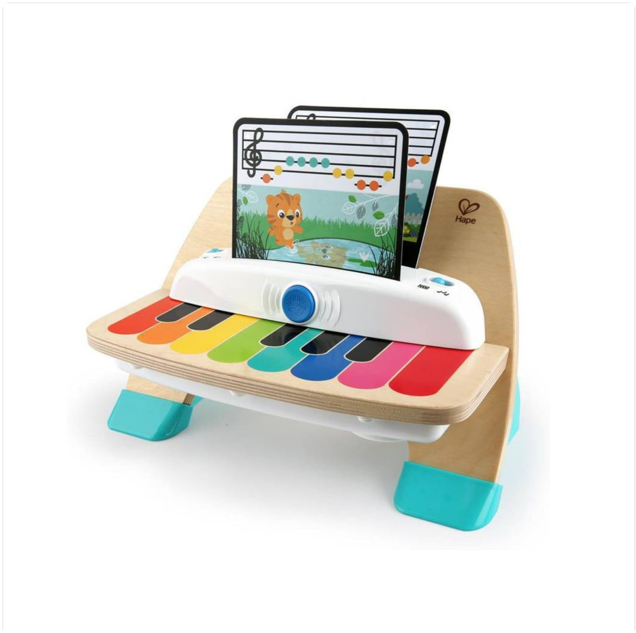
Figure 1: The Baby Einstein and Hape Magic Touch Wooden Toy Piano, showcasing its colorful keys and music sheet holder.