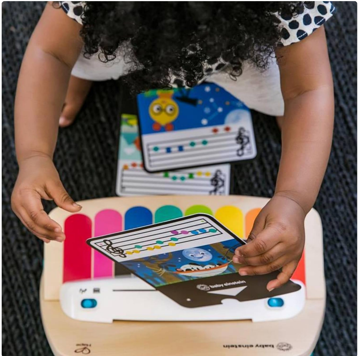
Figure 2: A child's hands interacting with the piano, demonstrating how music sheets are placed and used for guided play.

The piano comes with 3 double-sided music sheets. To use them, simply slide a desired music sheet into the slot located above the piano keys. The sheet will stand upright, displaying the color-coded notes for the song.